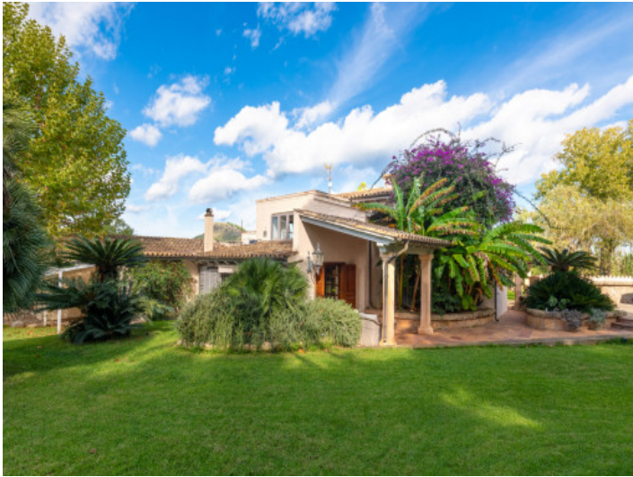
Main finca: Mediterranean finca view in a natural setting