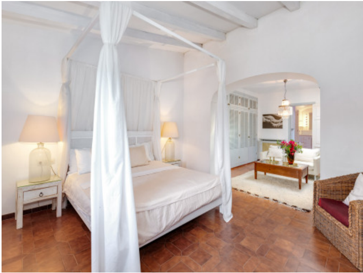
Bedroom with dressing area and en suite bathroom