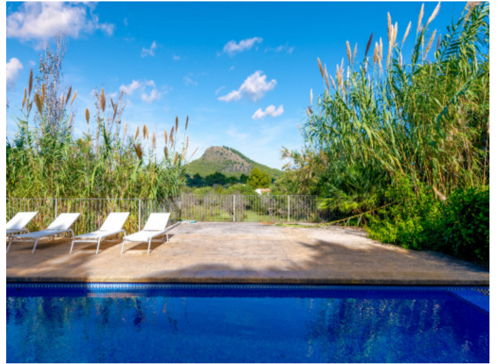
Pool with plenty of sun and a relaxed atmosphere