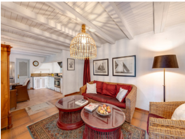
Cozy living area with a warm atmosphere, connection between kitchen and dining area