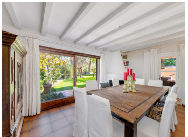
Bright dining area connected to the garden

All information is correct to the best of our knowledge. Errors and prior sale excepted. This prospectus is purely for information purposes. Only the notarized deed of sale is legally binding.