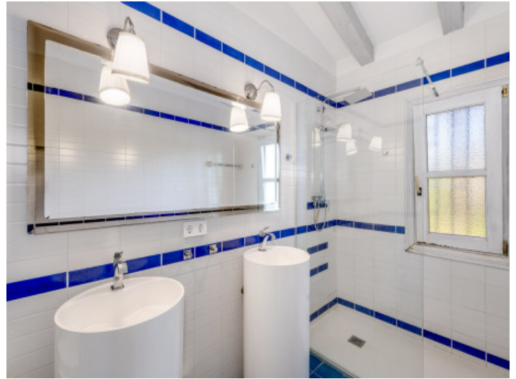
Bathroom with clean, streamlined design