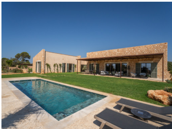
Pool with Terraces