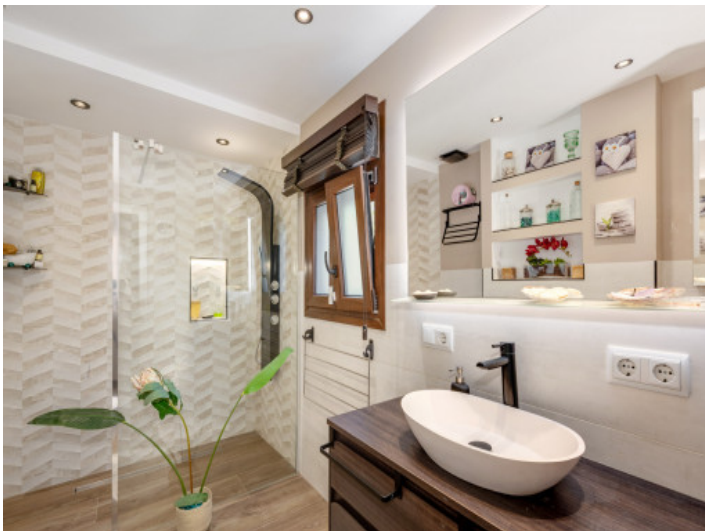
Bathroom first floor