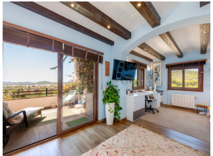
Office with sea views