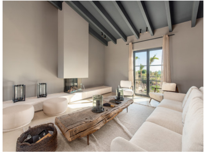
Second living area in the first floor