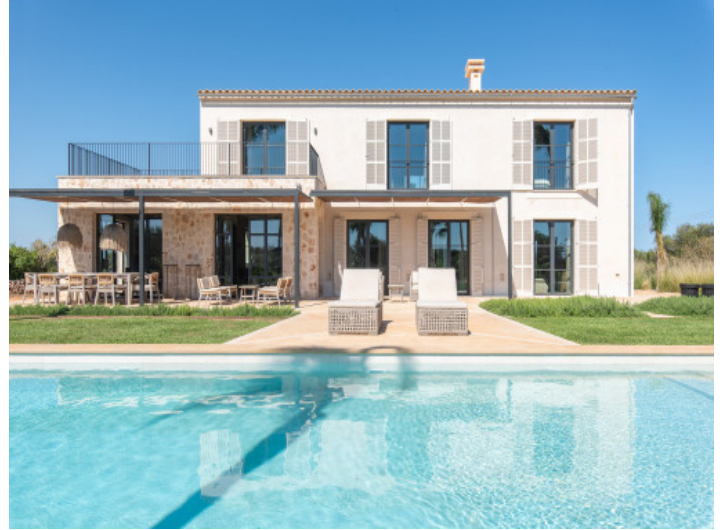
Newly-built finca with pool