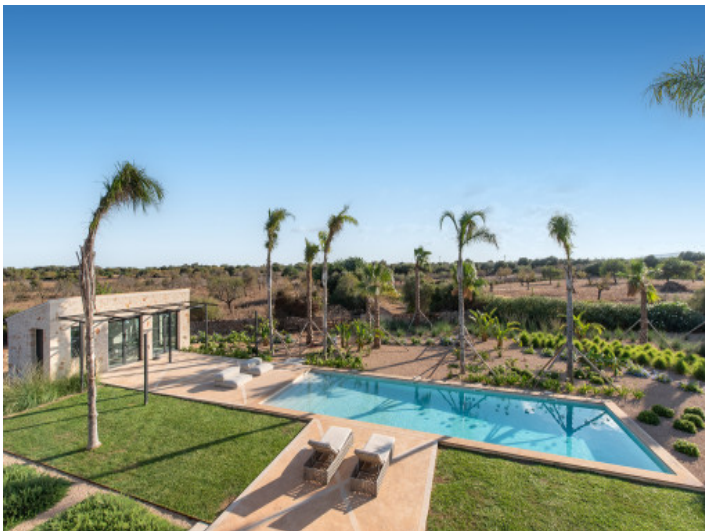
View at the pool area