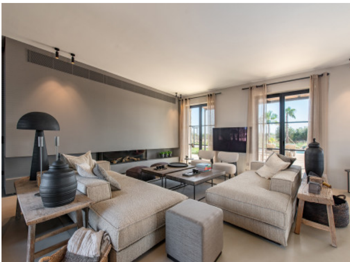
Elegante living area with fireplace