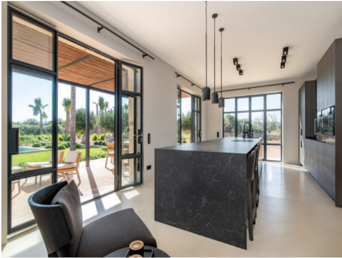
Kitchen with direct access to the terrace