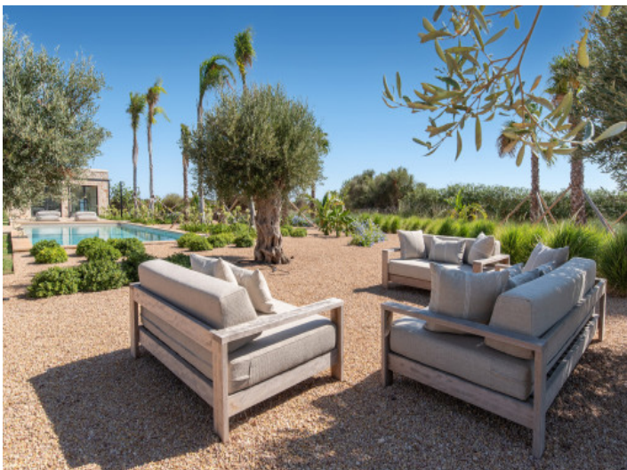
Chillout area at the pool