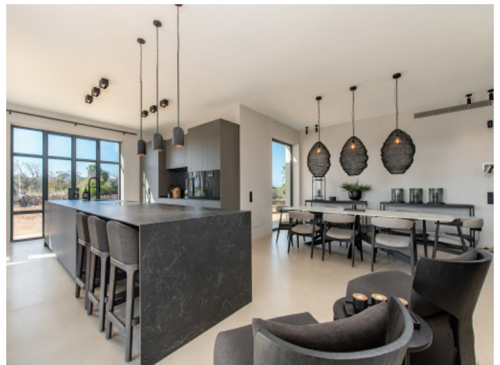
High quality kitchen

All information is correct to the best of our knowledge. Errors and prior sale excepted. This prospectus is purely for information purposes. Only the notarized deed of sale is legally binding.