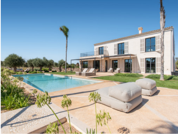
Newly-built finca with sea view