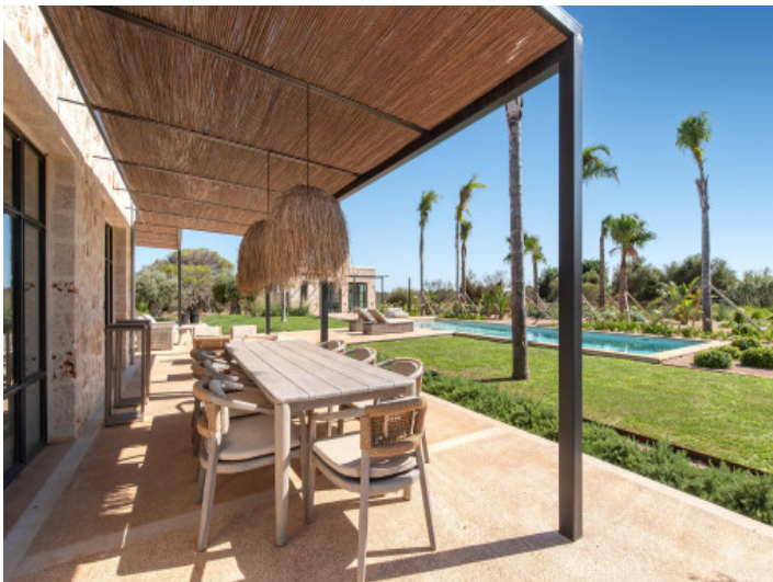
Terrace with dining area