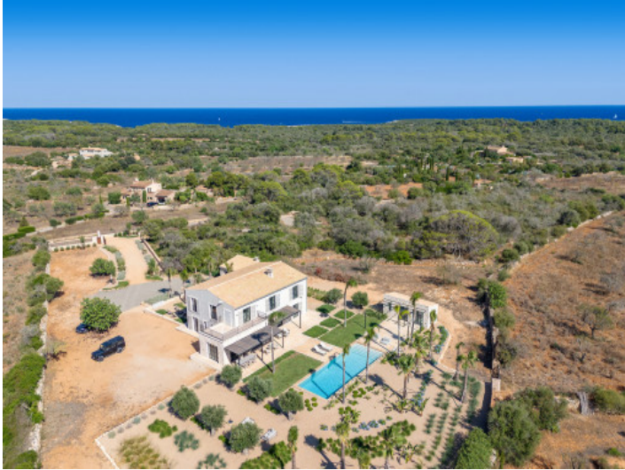
Birds eye view