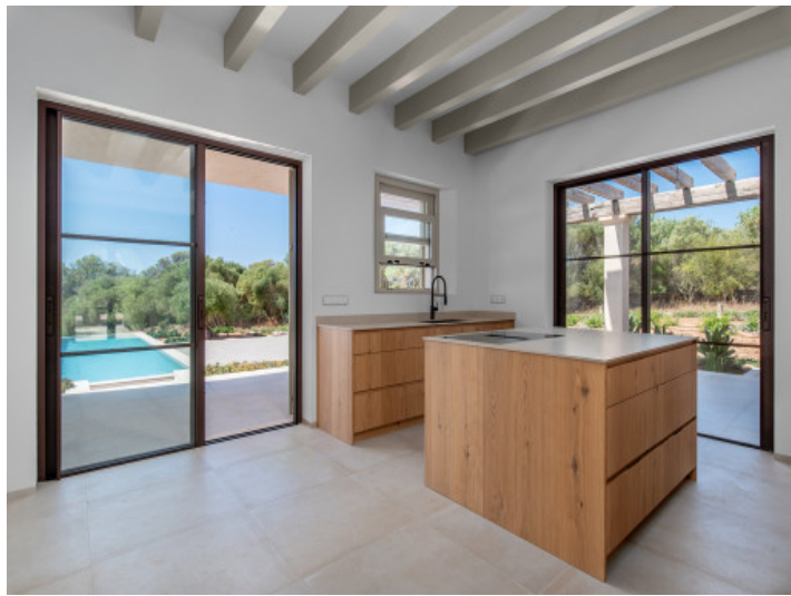
Spacious dining area