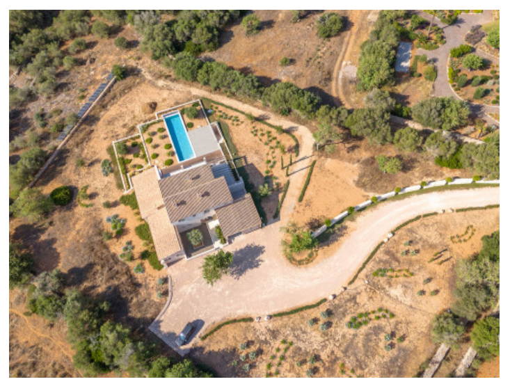
Birds eye view