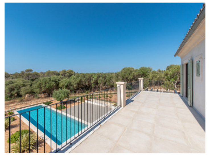
Terrace with far reaching views Large Pool All information is correct to the best of our knowledge. Errors and prior sale excepted. This prospectus is purely for information purposes. Only the notarized deed of sale is legally binding.