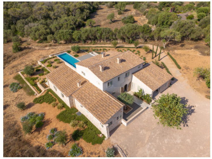
Finca with privacy