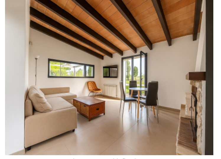
Lounge area with fireplace

All information is correct to the best of our knowledge. Errors and prior sale excepted. This prospectus is purely for information purposes. Only the notarized deed of sale is legally binding.