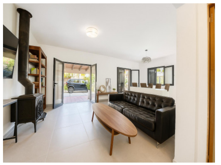
Living room with terrace access