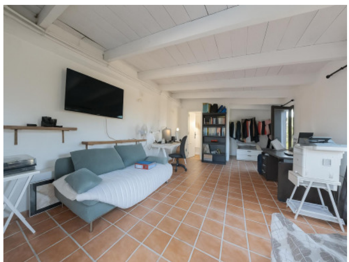
Third external bedroom of the main house (office)