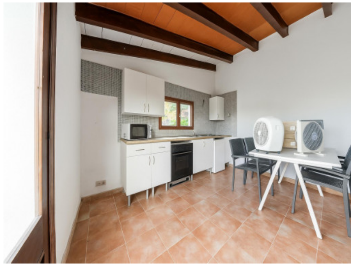
Guest house living room