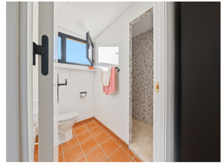
Shower room of the third bedroom