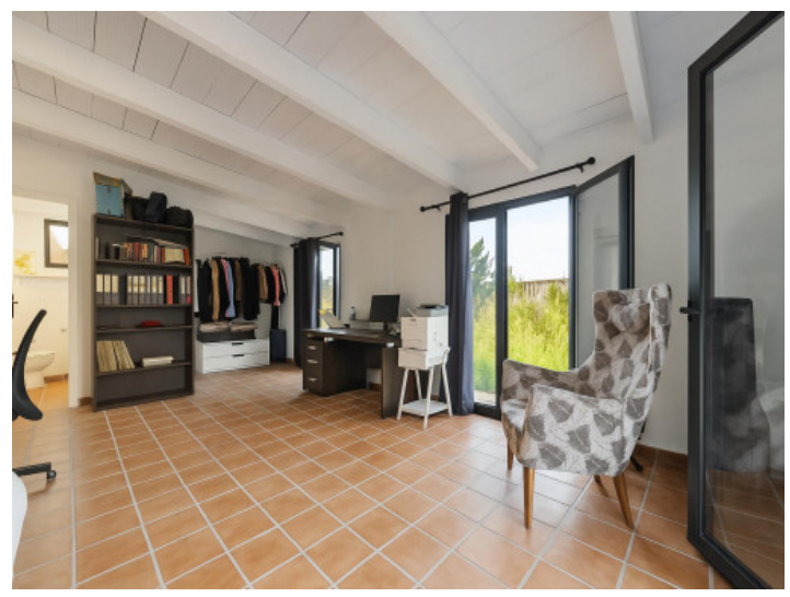
Third external bedroom of the main house (office)