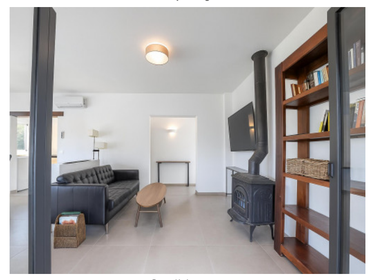
Cozy living room