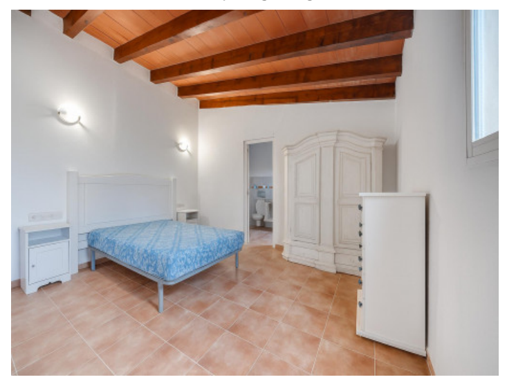
Double bedroom with en-suite-bathroom

All information is correct to the best of our knowledge. Errors and prior sale excepted. This prospectus is purely for information purposes. Only the notarized deed of sale is legally binding.