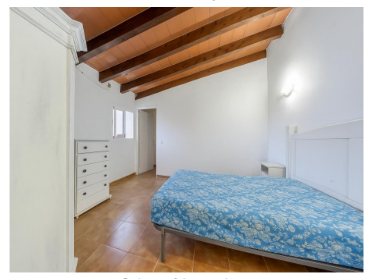
Bedroom of the guest house