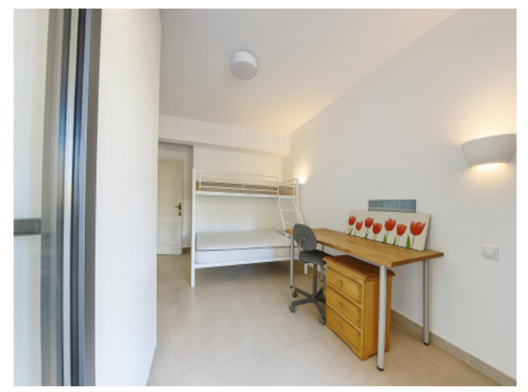
Children's room Sa Pobla