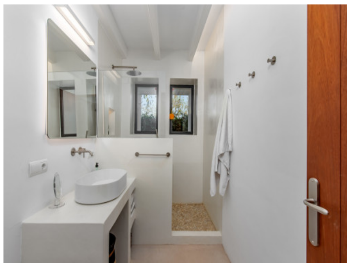
One of 6 bathrooms