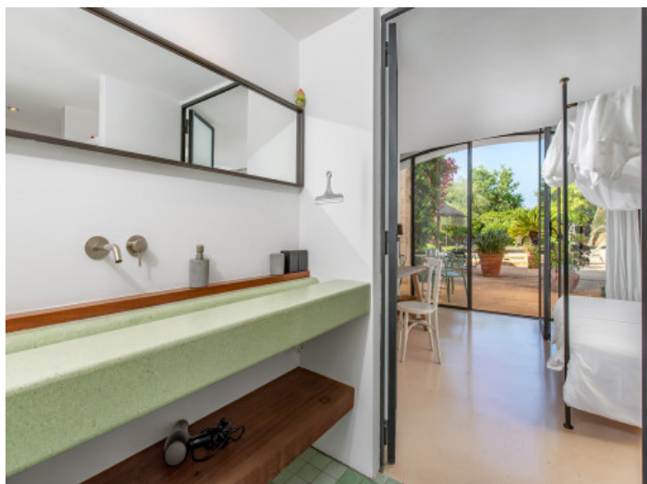
One of 6 bathrooms