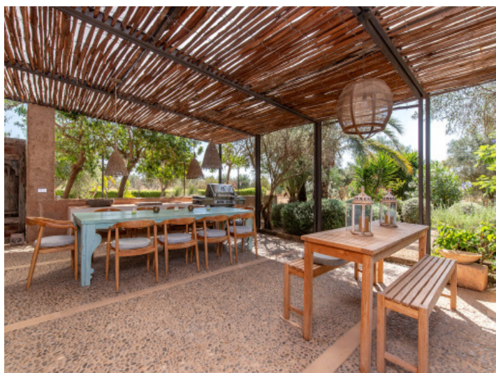
Terrace with barbecue area