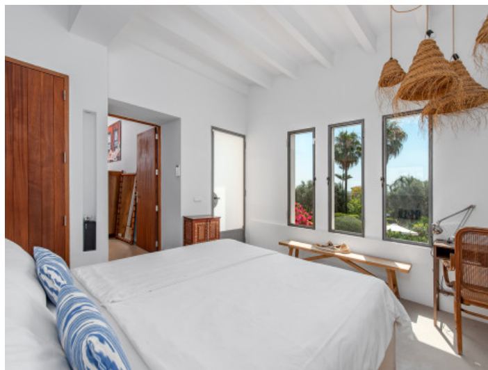
One of 6 bedrooms