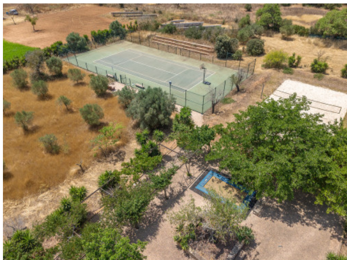
Birds eye view