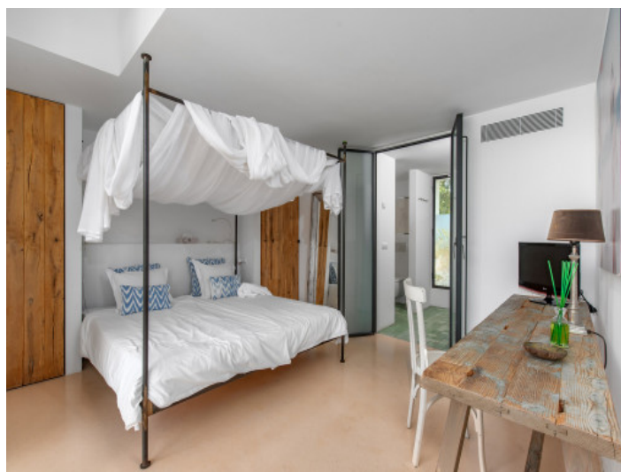
One of 6 bedrooms