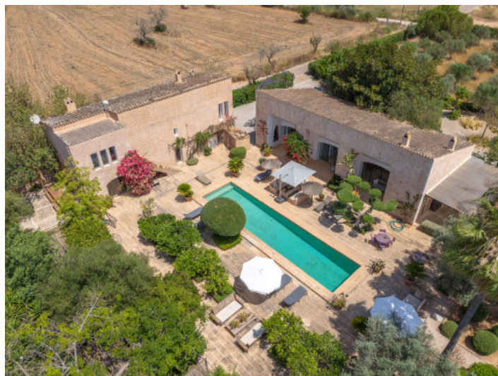
Finca with holiday license

All information is correct to the best of our knowledge. Errors and prior sale excepted. This prospectus is purely for information purposes. Only the notarized deed of sale is legally binding.