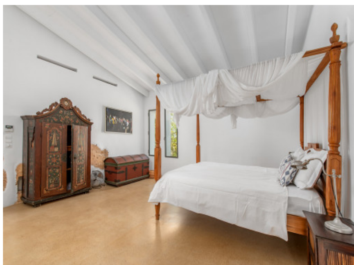
One of 6 bedrooms