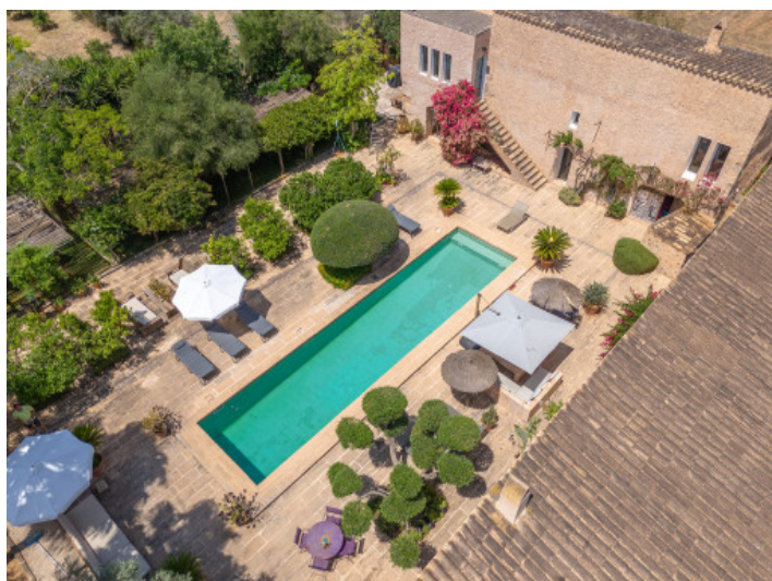
Birds eye view