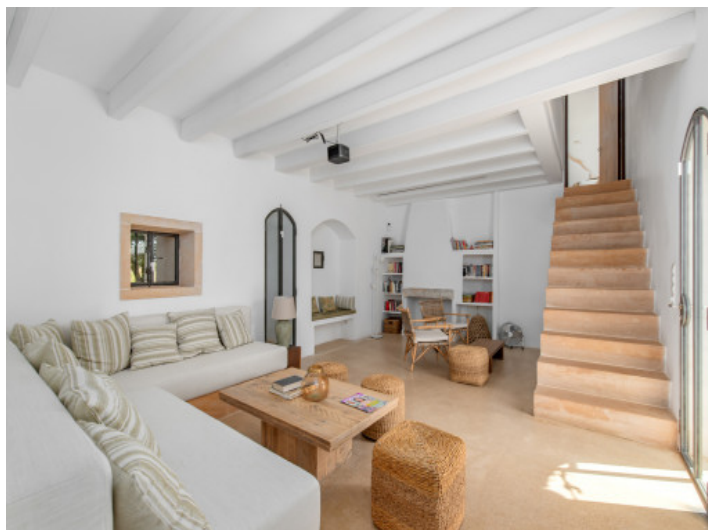
Living area in the guesthouse