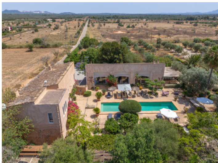
Finca birds eye view