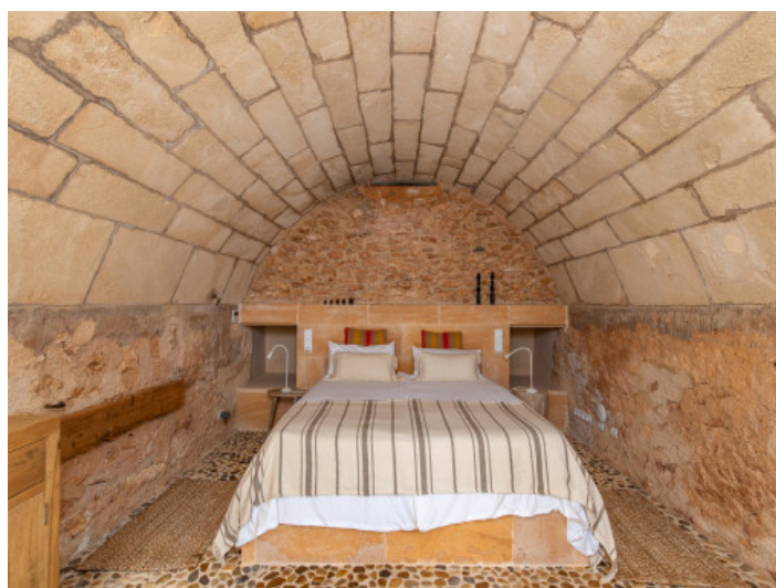
One of 6 bedrooms

All information is correct to the best of our knowledge. Errors and prior sale excepted. This prospectus is purely for information purposes. Only the notarized deed of sale is legally binding.