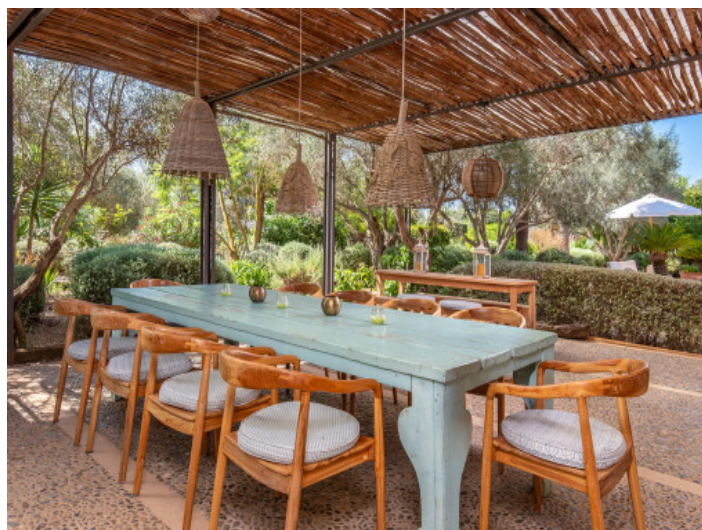
Terrace with garden view

All information is correct to the best of our knowledge. Errors and prior sale excepted. This prospectus is purely for information purposes. Only the notarized deed of sale is legally binding.