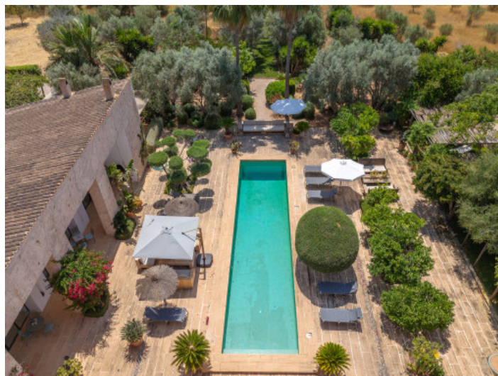
Finca with large pool