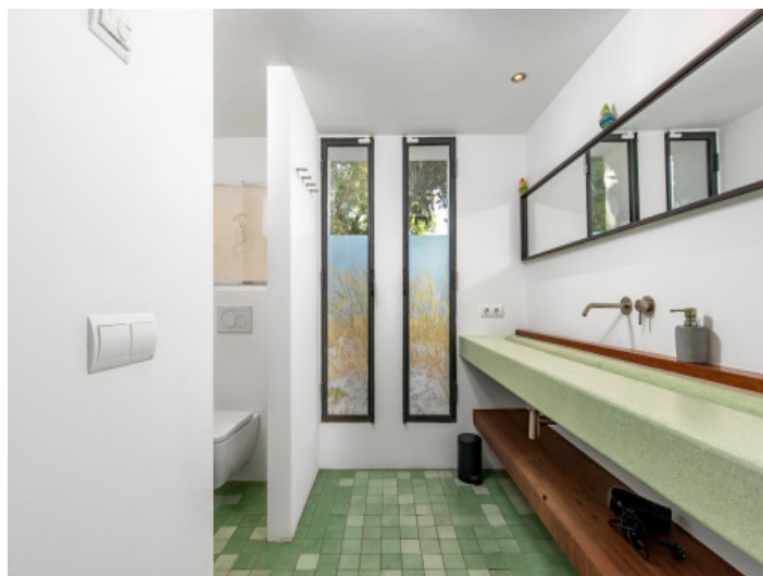
One of 6 bathrooms

All information is correct to the best of our knowledge. Errors and prior sale excepted. This prospectus is purely for information purposes. Only the notarized deed of sale is legally binding.