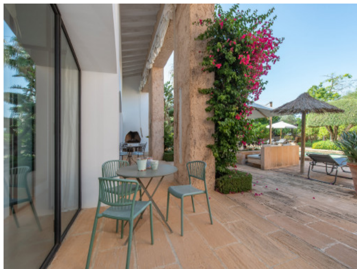
Terrace with fireplace