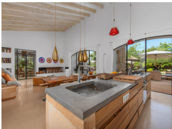
Totally equipped kitchen