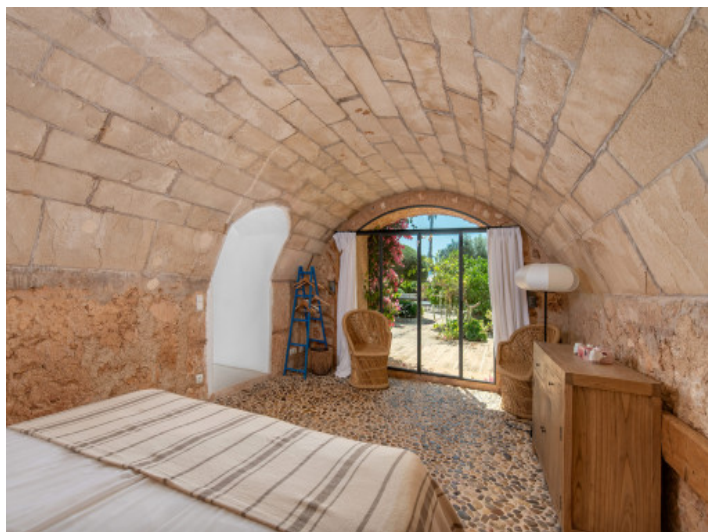
One of 6 bedrooms