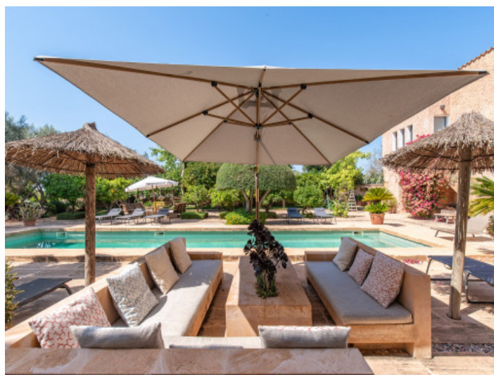
Cozy chillout area