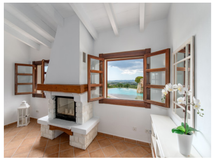
Dining area with chimney and views