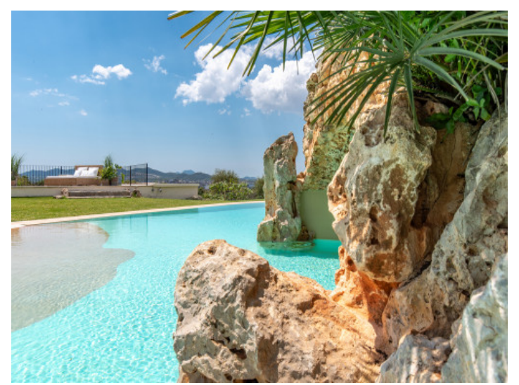
Pool with grotto Exceptional views All information is correct to the best of our knowledge. Errors and prior sale excepted. This prospectus is purely for information purposes. Only the notarized deed of sale is legally binding.

PORTA MALLORQUINA • THERESIENSTR.: 81, 80333 MUNICH TEL. +34 971 698 242 • INFO@PORTAMALLORQUINA.COM