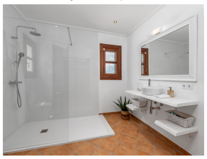
Bathroom enSuite Bedroom All information is correct to the best of our knowledge. Errors and prior sale excepted. This prospectus is purely for information purposes. Only the notarized deed of sale is legally binding.

PORTA MALLORQUINA • THERESIENSTR.: 81, 80333 MUNICH TEL. +34 971 698 242 • INFO@PORTAMALLORQUINA.COM