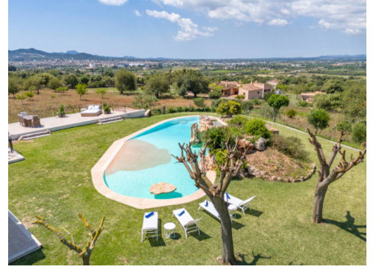
Pool with views