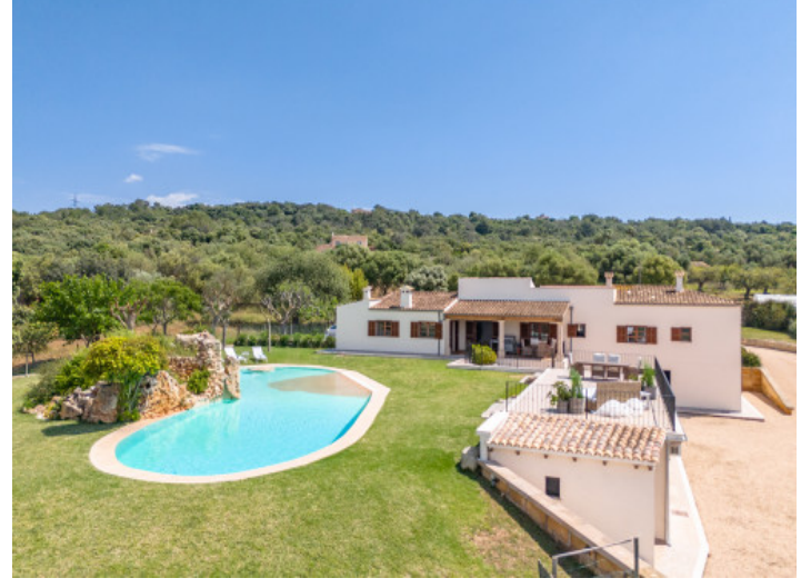
South west orientation

PORTA MALLORQUINA® Your home. Our passion.