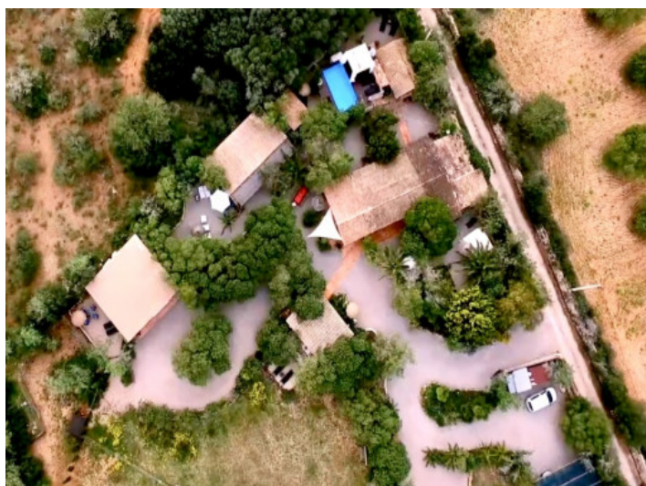
from the Sky