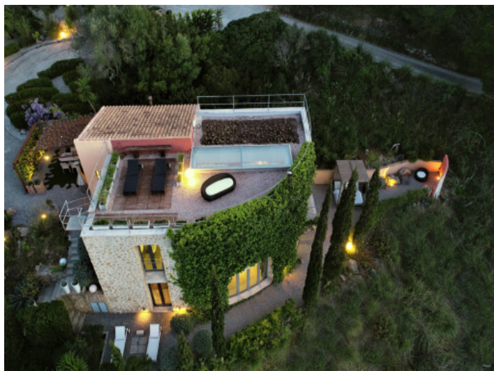
Loft at night