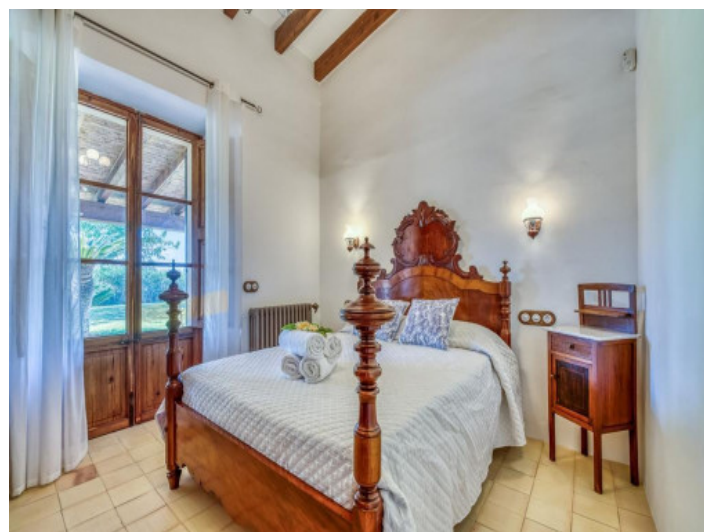
One of the 4 double bedrooms