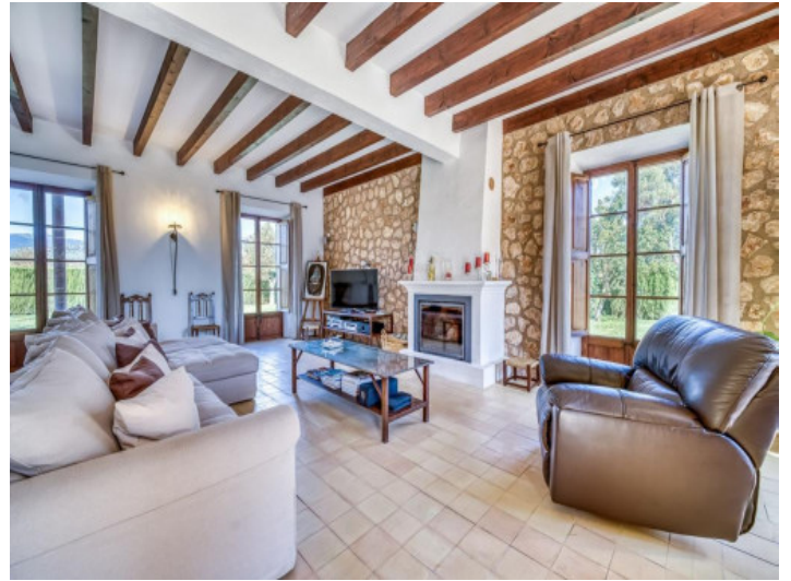
Bright living area with fireplace and natural stone accents – perfect for