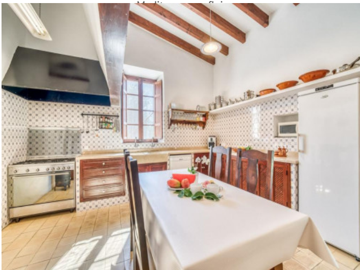
Spacious kitchen in Mallorcan style – with plenty of storage space dining area and access