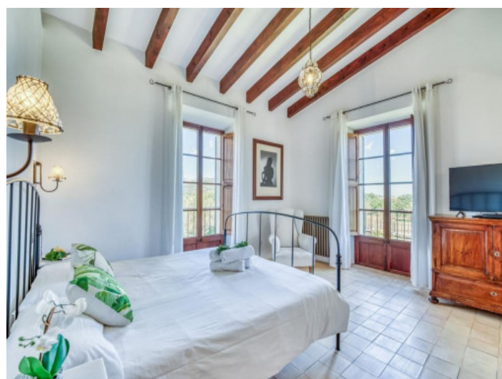
One of the 4 double bedrooms