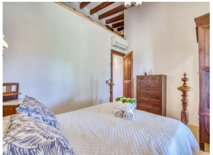
One of the 4 double bedrooms

All information is correct to the best of our knowledge. Errors and prior sale excepted. This prospectus is purely for information purposes. Only the notarized deed of sale is legally binding.