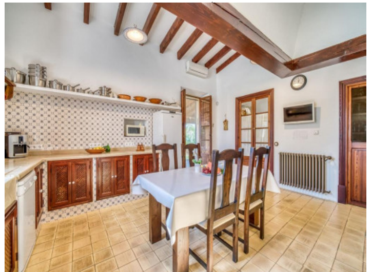
Spacious kitchen in Mallorcan style – with plenty of storage space dining