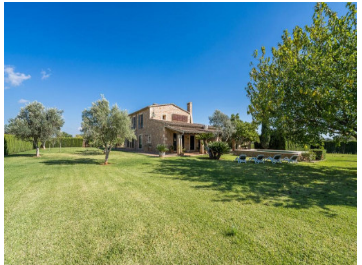
Spacious garden with well-kept lawn and lots of privacy