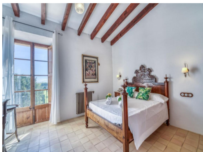
One of the 4 double bedrooms