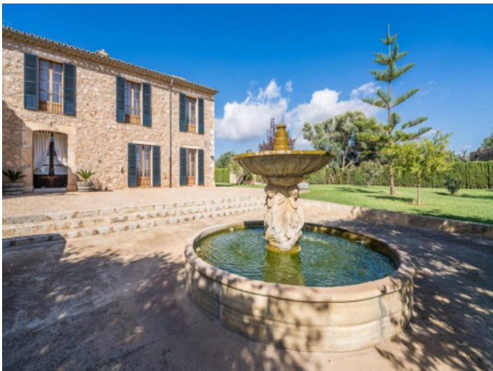
View of the finca with idyllic garden and fountain