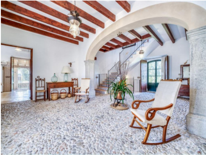
Traditional entrance area with arch and natural stone floor