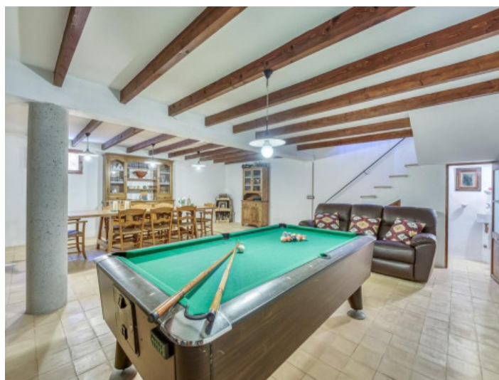
Hobby room with pool table cosy lounge and private spa & fitness area