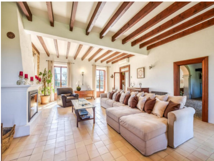
Inviting living room with comfortable sofa area wooden beams and