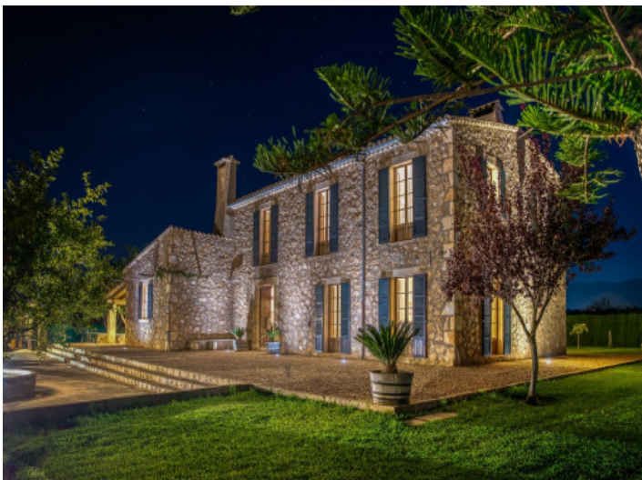
Natural stone façade with access to the extensive garden