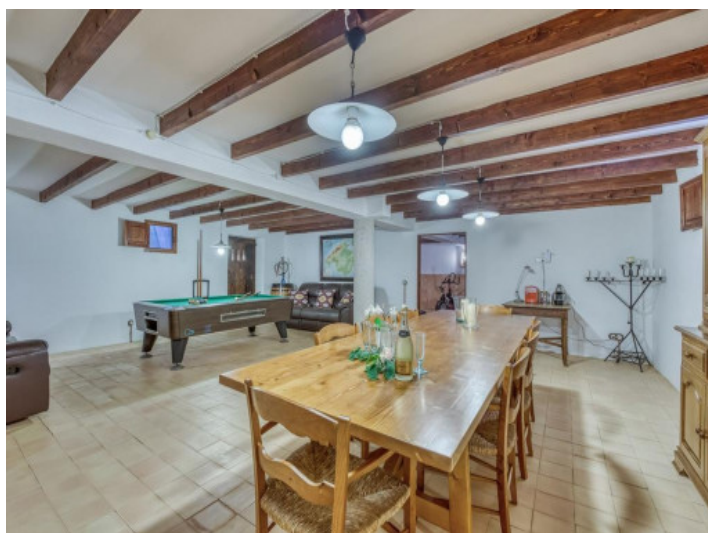
Hobby room with pool table cosy lounge and private spa & fitness area

All information is correct to the best of our knowledge. Errors and prior sale excepted. This prospectus is purely for information purposes. Only the notarized deed of sale is legally binding.