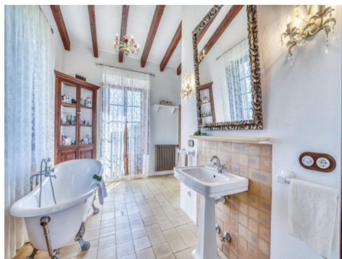
Spacious bathroom with bath tub

All information is correct to the best of our knowledge. Errors and prior sale excepted. This prospectus is purely for information purposes. Only the notarized deed of sale is legally binding.