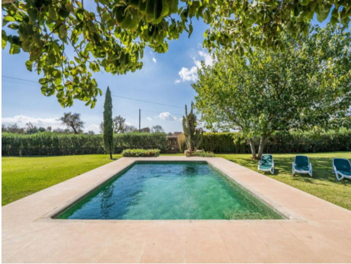
Inviting saltwater pool and lovingly designed outdoor areas