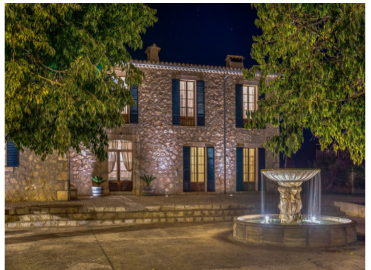
Natural stone façade with access to the extensive garden

All information is correct to the best of our knowledge. Errors and prior sale excepted. This prospectus is purely for information purposes. Only the notarized deed of sale is legally binding.