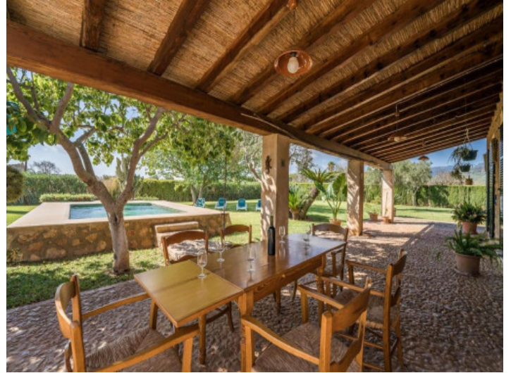
Covered veranda with outdoor dining table