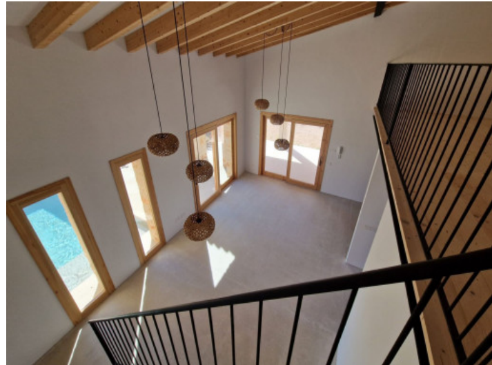
Gallery Living area All information is correct to the best of our knowledge. Errors and prior sale excepted. This prospectus is purely for information purposes. Only the notarized deed of sale is legally binding.

PORTA MALLORQUINA • THERESIENSTR.: 81, 80333 MUNICH TEL. +34 971 698 242 • INFO@PORTAMALLORQUINA.COM