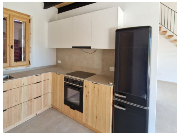
Living area Kitchen All information is correct to the best of our knowledge. Errors and prior sale excepted. This prospectus is purely for information purposes. Only the notarized deed of sale is legally binding.

PORTA MALLORQUINA • THERESIENSTR.: 81, 80333 MUNICH TEL. +34 971 698 242 • INFO@PORTAMALLORQUINA.COM