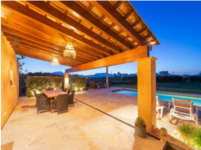
Evenings with Tramuntana Mountain Views