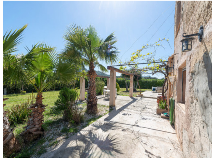
Mediterranean Terrace by the Guest House