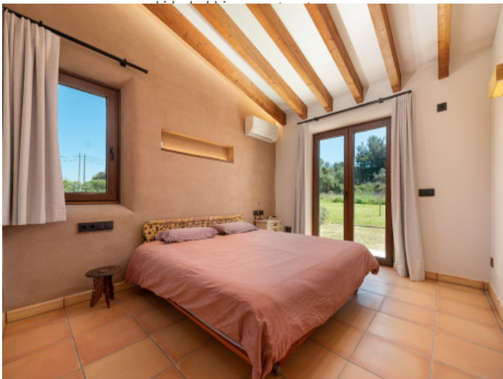
Master bedroom with direct garden access.