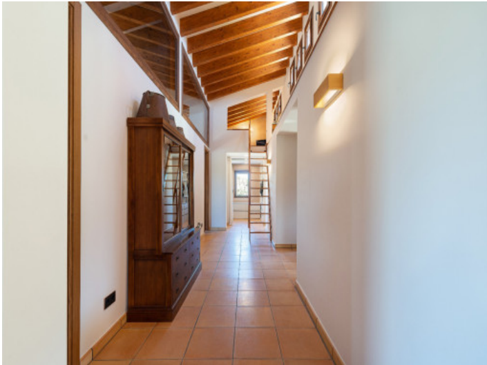
Bright hallway leading to the bedrooms and a versatile loft – perfect for