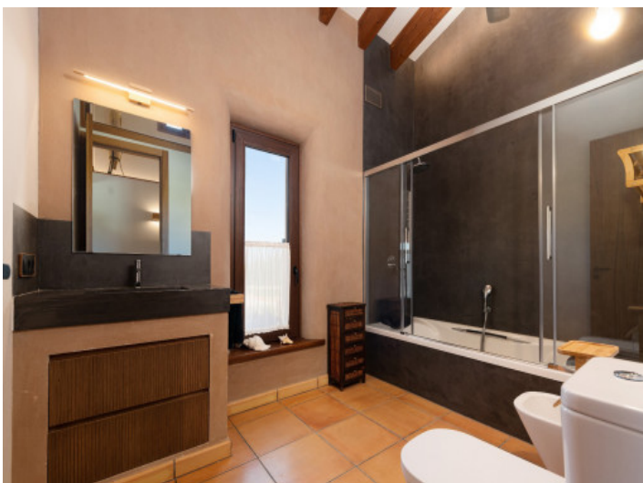
Separate individual bathroom with bathtub