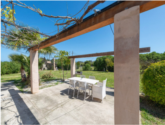
Outdoor Dining with Pergola and Nature Views