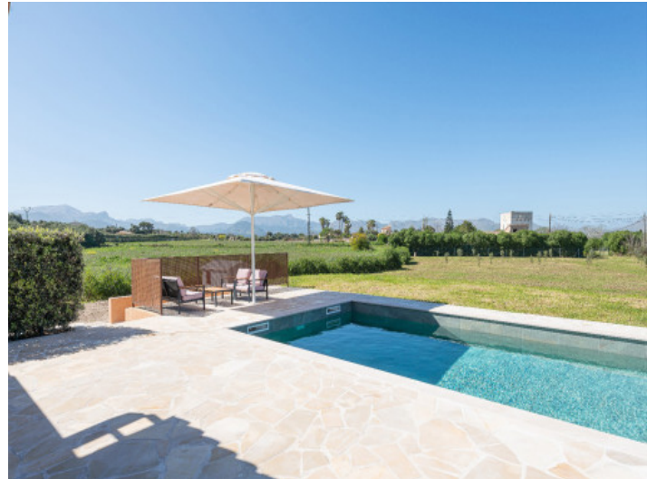
Pool with Views of Rural Serenity