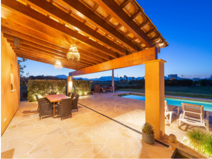
Natural Light Meets Eco Design