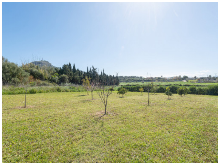
Orchard with Open Views and Young Fruit Trees

All information is correct to the best of our knowledge. Errors and prior sale excepted. This prospectus is purely for information purposes. Only the notarized deed of sale is legally binding.