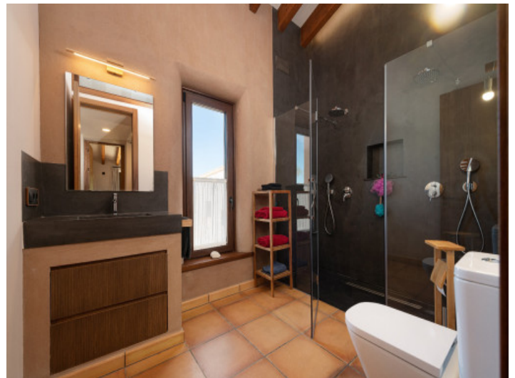
En-suite shower bathroom