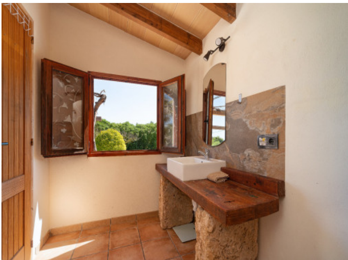
Rustic Bathroom with Garden View