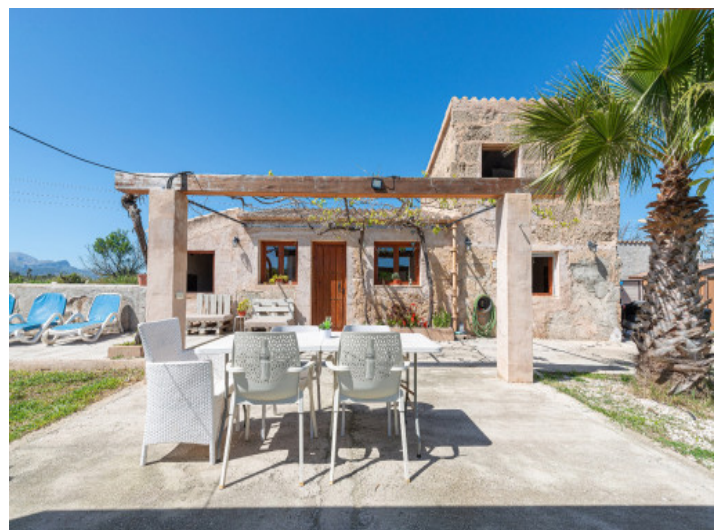
Historic Guest House with Sunny Terrace

All information is correct to the best of our knowledge. Errors and prior sale excepted. This prospectus is purely for information purposes. Only the notarized deed of sale is legally binding.