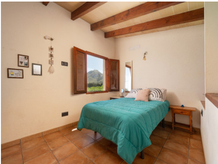
Charming Bedroom with Mountain Views