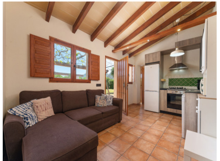
Living-dining area with open kitchen in the guest house