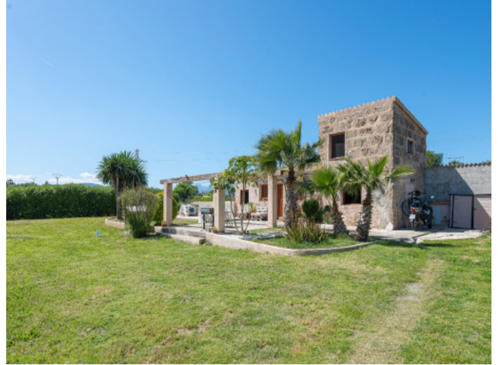
Stone House with Mallorcan Soul