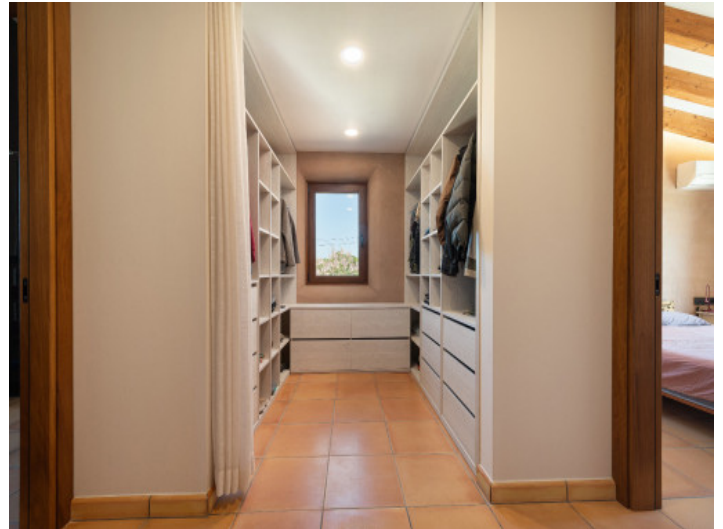
Spacious and bright walk-in closet with window.