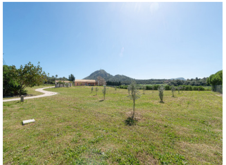
Panoramic View of the Land with Olive Trees, Finca and Garage

All information is correct to the best of our knowledge. Errors and prior sale excepted. This prospectus is purely for information purposes. Only the notarized deed of sale is legally binding.