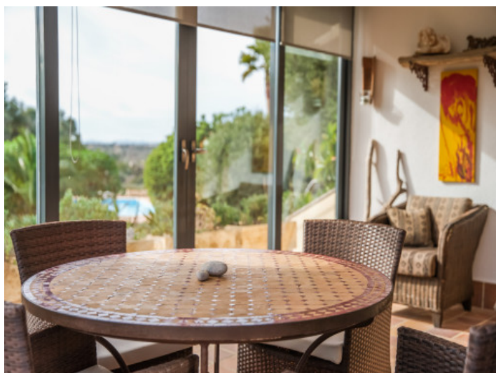
Dining room with large windows