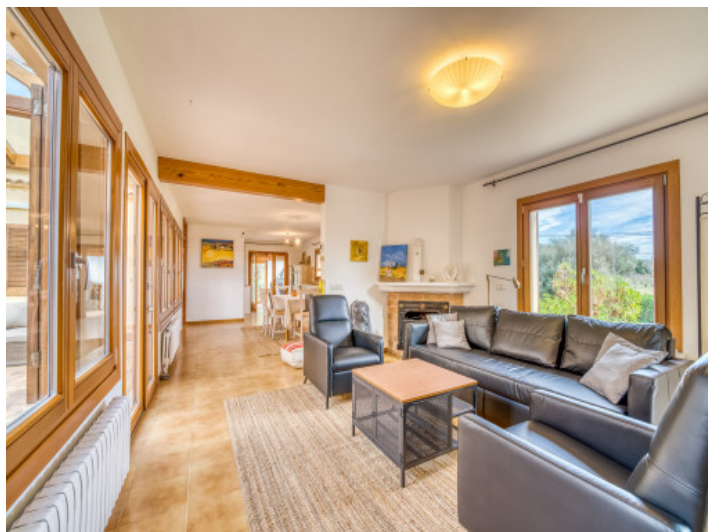
Bright dining room with natural light