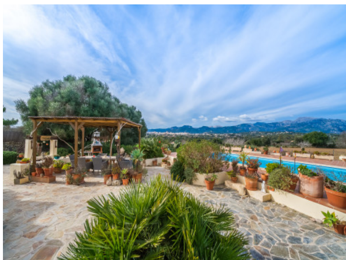
Spacious conservatory with glass roof