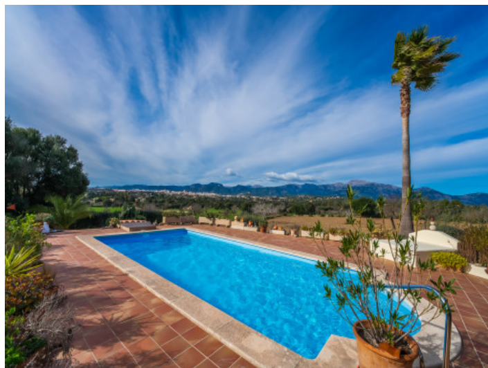
Pool area with palm trees