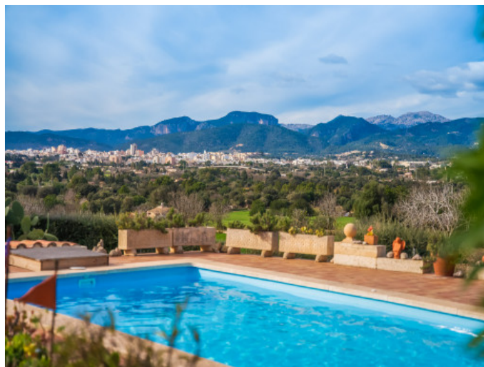
Pool with panoramic view