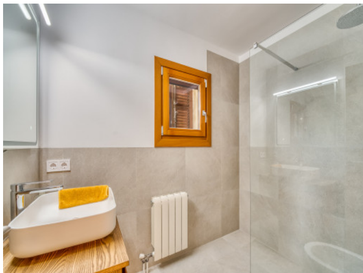
Bathroom with window and washbasin