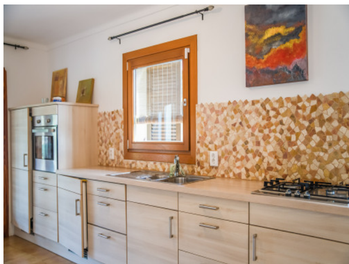
View from the dining area to the garden