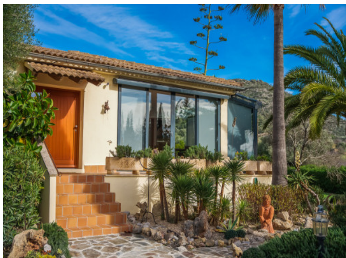
Facade with natural stone