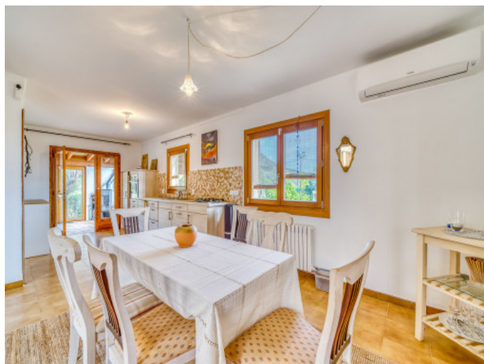
Modern kitchen with wooden details

All information is correct to the best of our knowledge. Errors and prior sale excepted. This prospectus is purely for information purposes. Only the notarized deed of sale is legally binding.