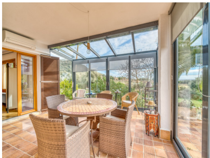
Living room with natural light

All information is correct to the best of our knowledge. Errors and prior sale excepted. This prospectus is purely for information purposes. Only the notarized deed of sale is legally binding.