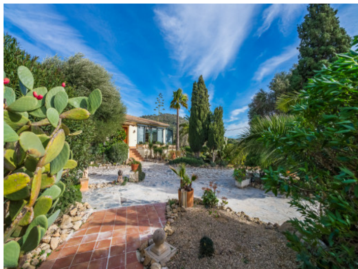
Lush garden area