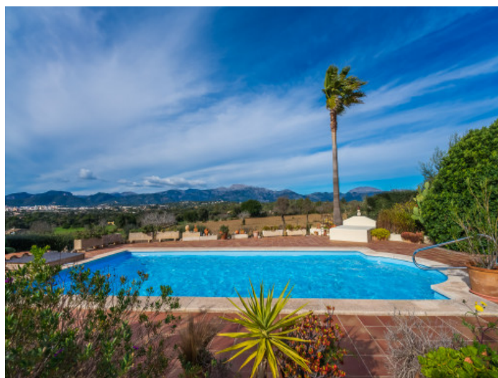
Elegant pool area