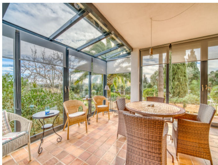
Wintergarten mit Gartenzugang