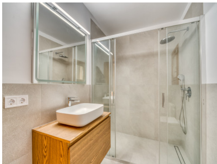
Bathroom with walk-in shower

All information is correct to the best of our knowledge. Errors and prior sale excepted. This prospectus is purely for information purposes. Only the notarized deed of sale is legally binding.