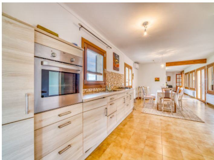
Elegant dining area for social gatherings