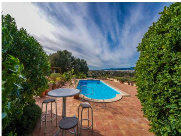
Pool with natural stone terrace