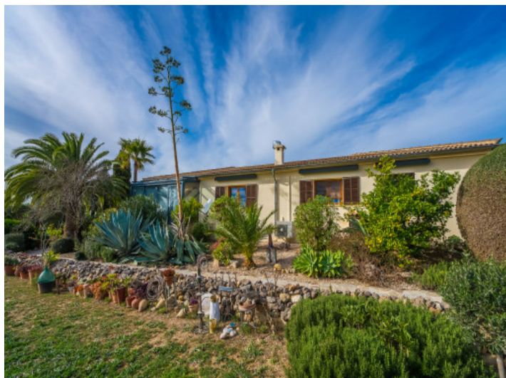
Mallorcan architectural style