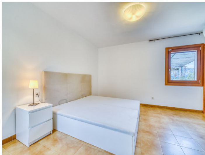
Bright bedroom with window