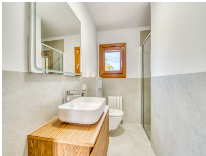
Bathroom with bathtub and natural stone