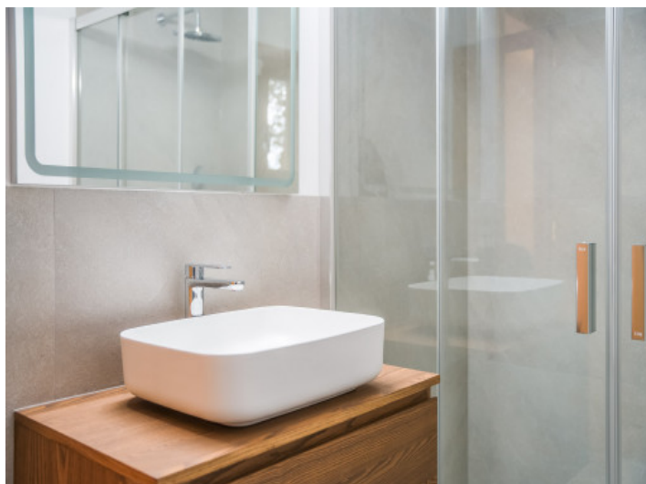
Stylish bathroom with natural light