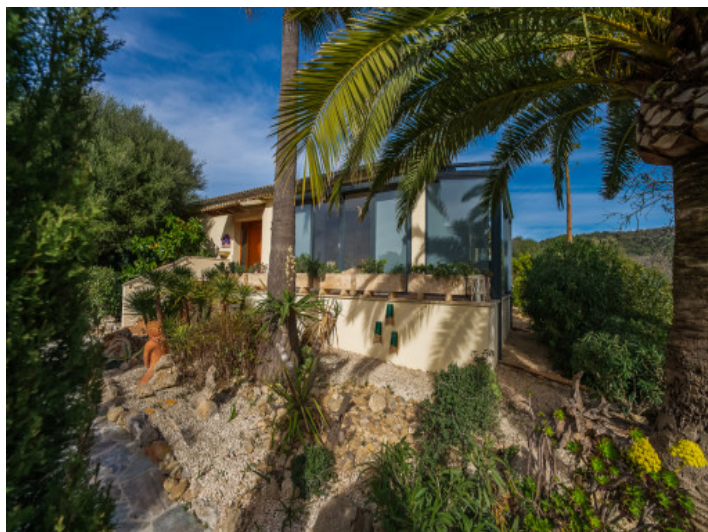
Garden with palm trees and natural views