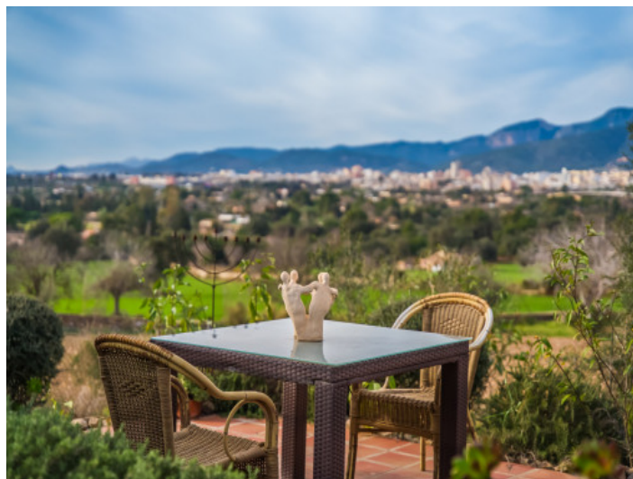
Cozy conservatory with sitting area