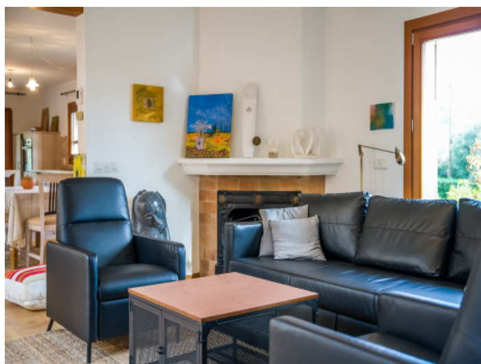
Living room with garden view

All information is correct to the best of our knowledge. Errors and prior sale excepted. This prospectus is purely for information purposes. Only the notarized deed of sale is legally binding.