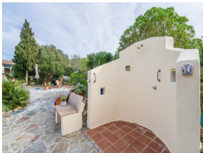
Covered terrace with garden view

All information is correct to the best of our knowledge. Errors and prior sale excepted. This prospectus is purely for information purposes. Only the notarized deed of sale is legally binding.