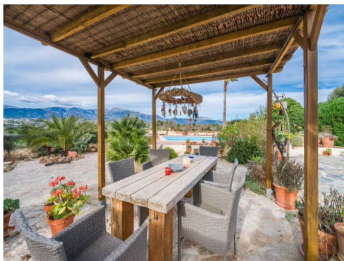
Conservatory with open views