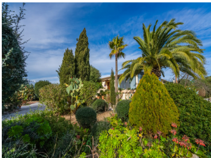
Mediterranean garden with palm trees