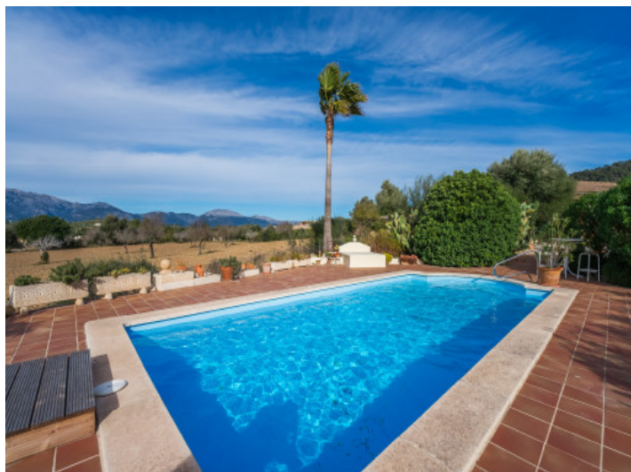
Swimming pool with sun terrace