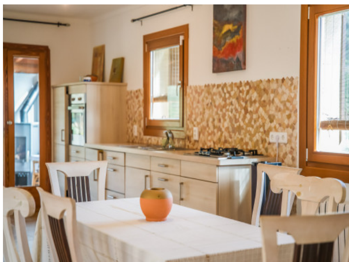
Cozy living area with reading corner