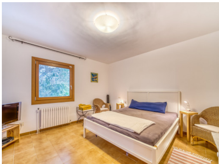
Fully equipped fitted kitchen