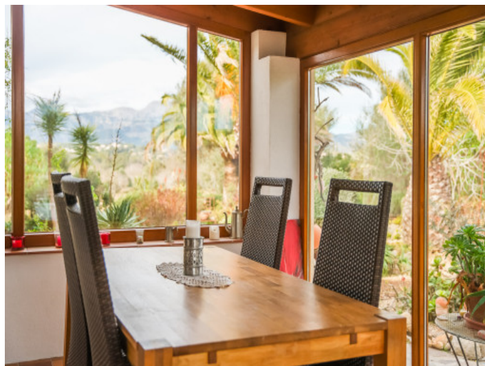
Open living area with sofa and fireplace