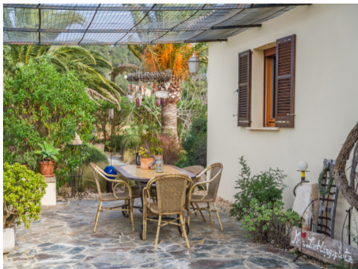
Bright conservatory with nature views