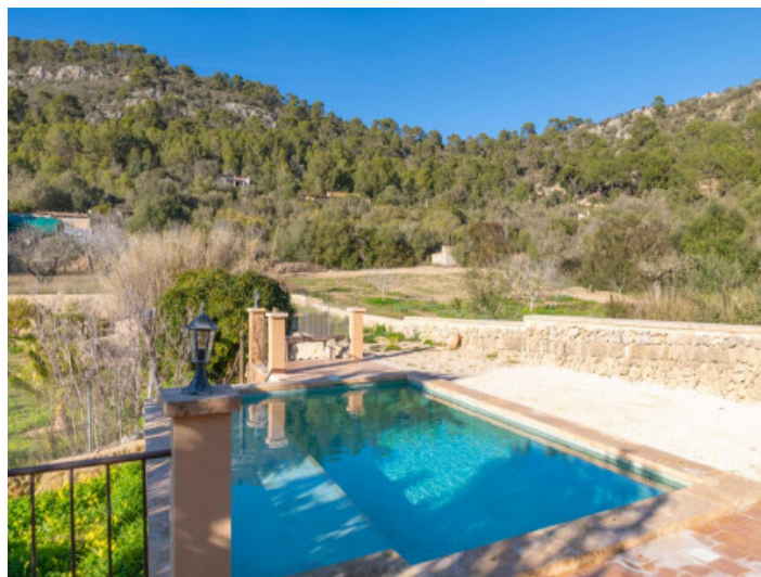
Very nice pool area

All information is correct to the best of our knowledge. Errors and prior sale excepted. This prospectus is purely for information purposes. Only the notarized deed of sale is legally binding.