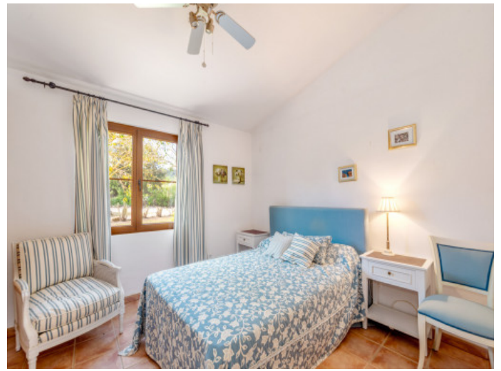
Bedroom in left wing