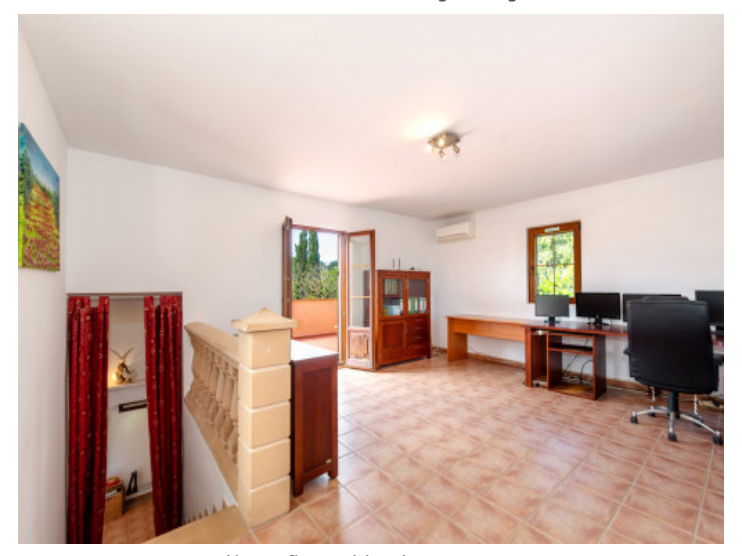
Upper floor with private terrace