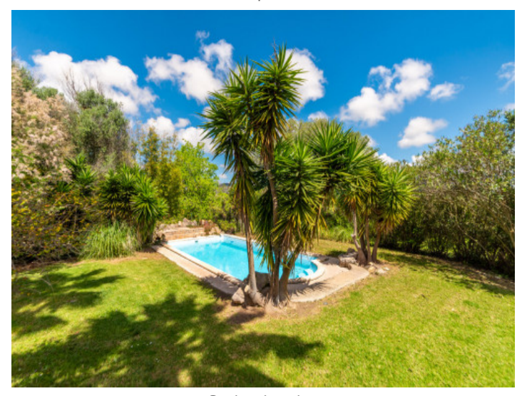
Pool and garden