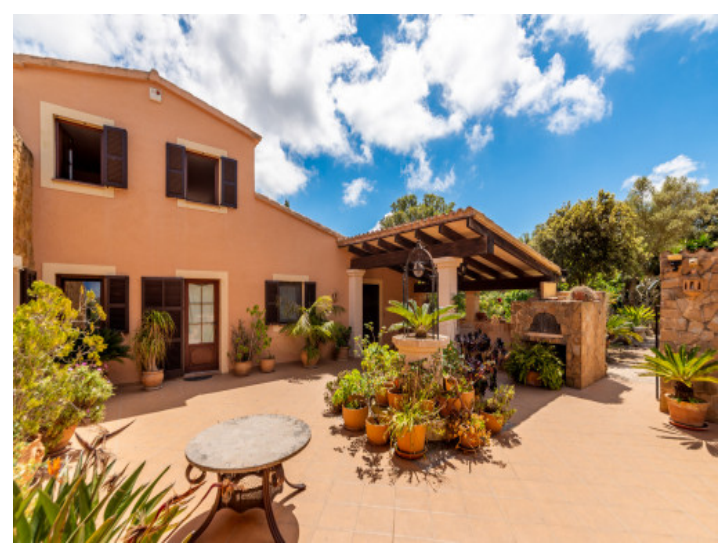
Finca and patio