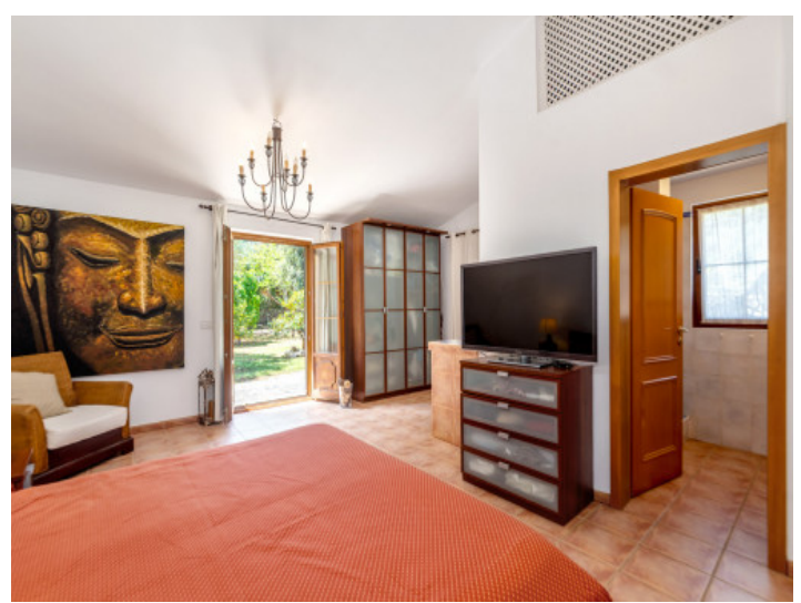
Third bedroom in the right wing with en suite bathroom