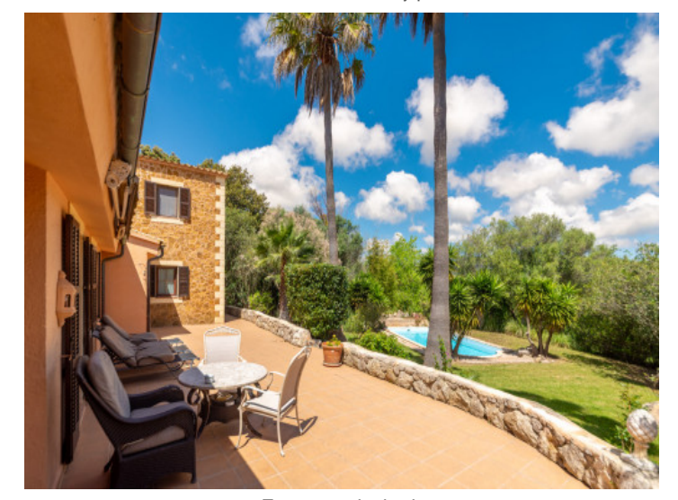
Terrace at the back