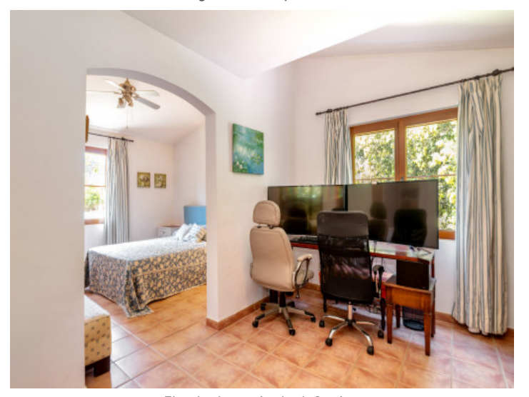
First bedroom in the left wing