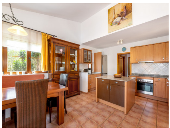
Dining area with open kitchen