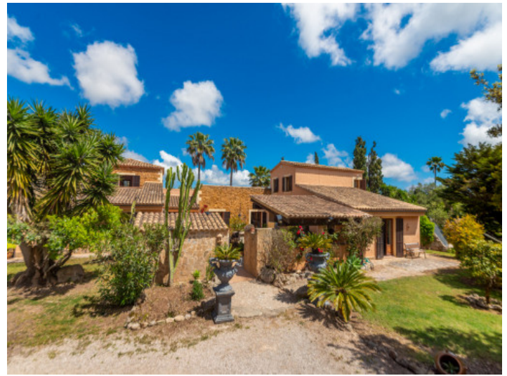
Finca in Arta