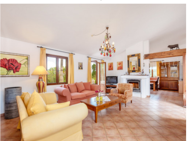
Spacious living area