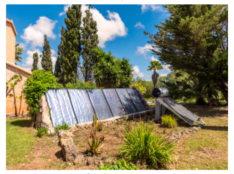
Solar for warm water