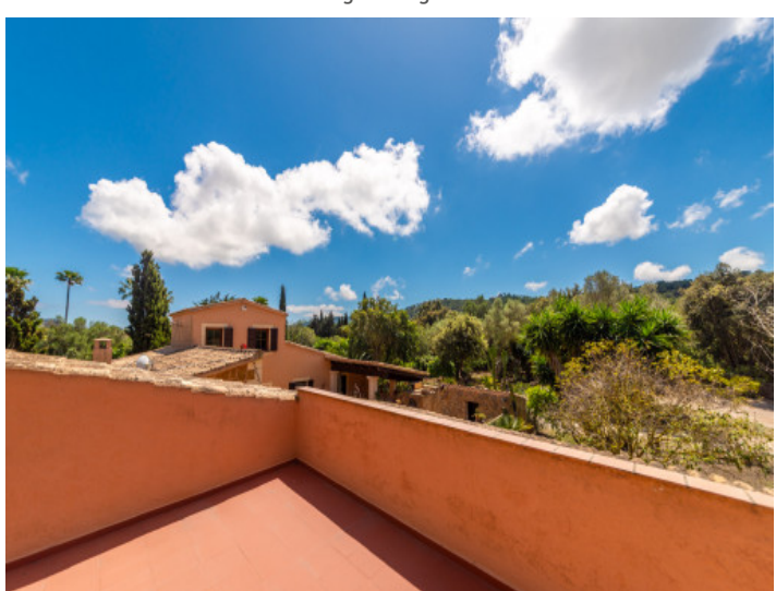
View from the upper terrace