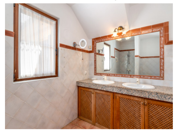
En suite bathroom