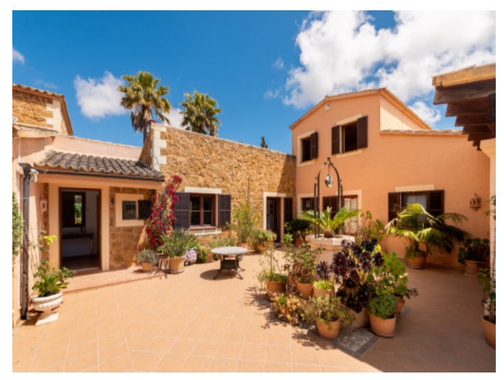
Finca in Artà with cosy patio