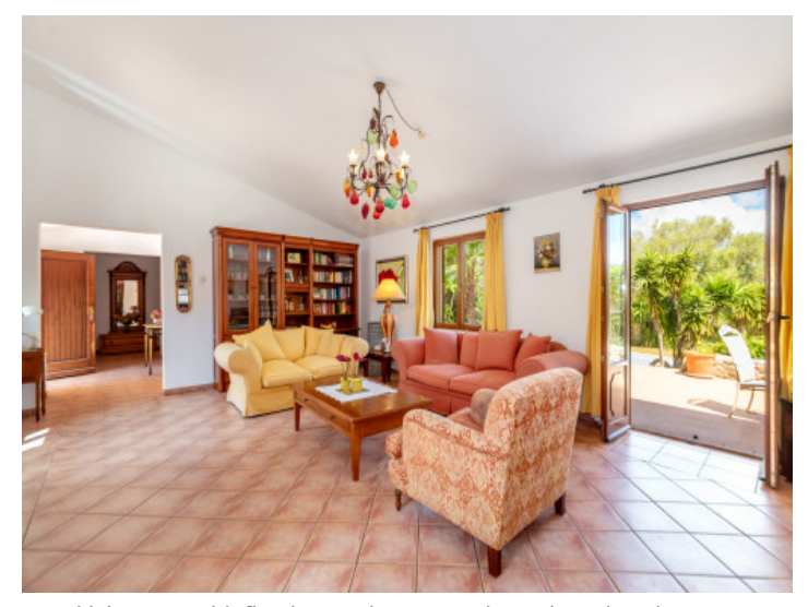
Living area with fireplace and access to the patio and pool terrace