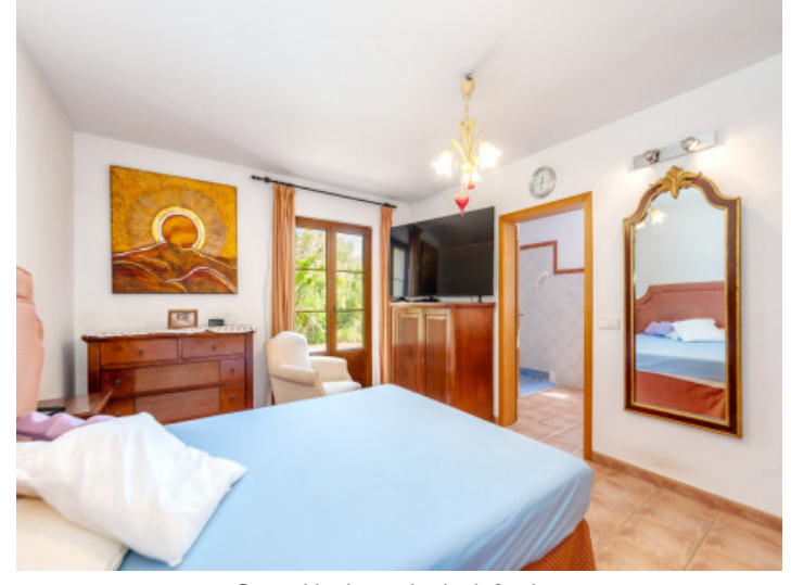
Second bedroom in the left wing