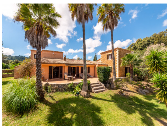
Finca from the pool side