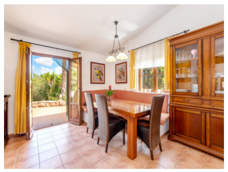
Dining area with open kitchen