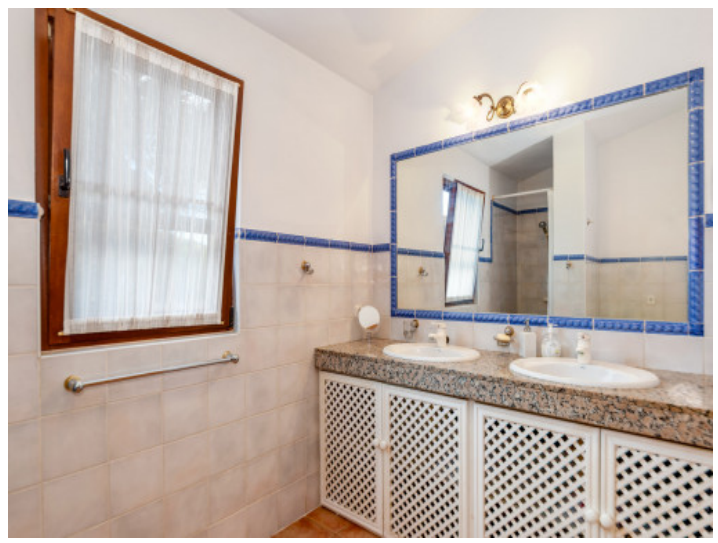
Bathroom in the left wing