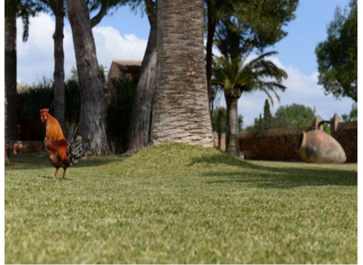
Quiet country life

All information is correct to the best of our knowledge. Errors and prior sale excepted. This prospectus is purely for information purposes. Only the notarized deed of sale is legally binding.