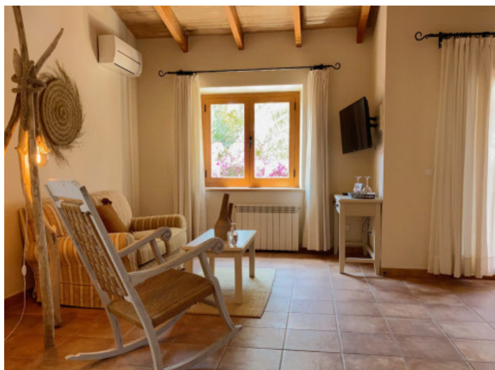
One of 9 junior suites