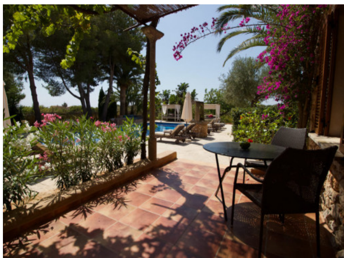
Inviting outdoor area