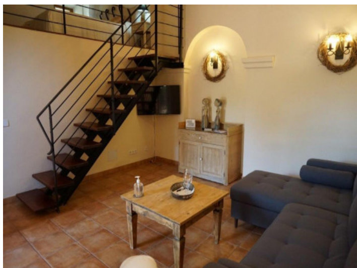
One of 9 junior suites