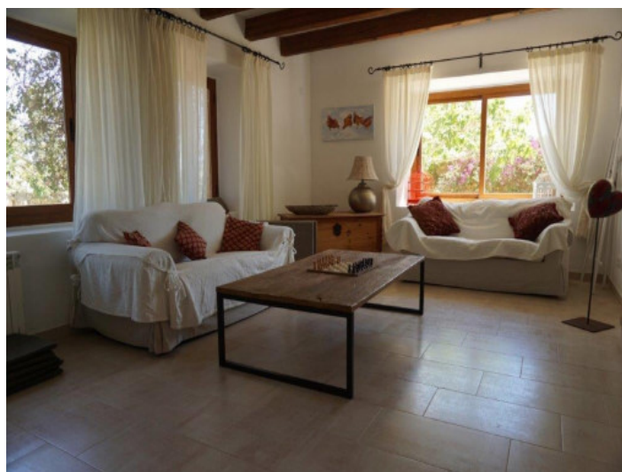
Cosy communal area