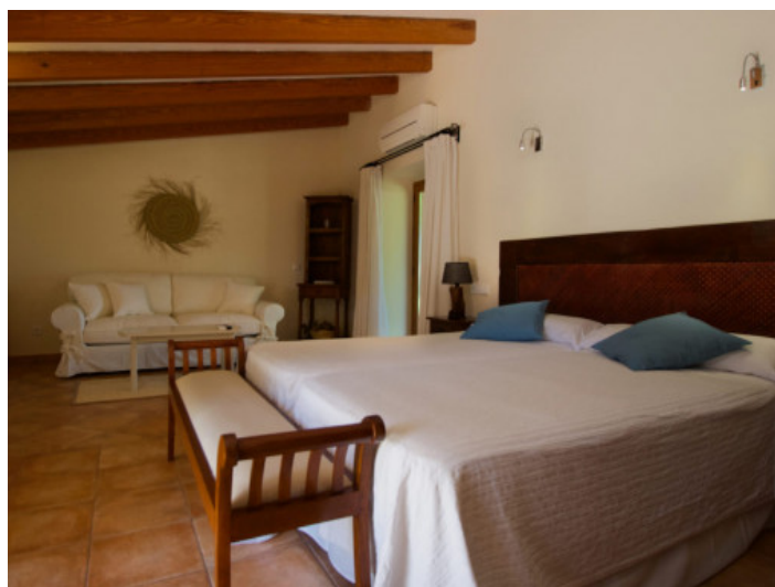
One of 9 junior suites