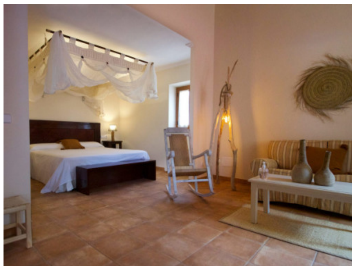
One of 9 junior suites

All information is correct to the best of our knowledge. Errors and prior sale excepted. This prospectus is purely for information purposes. Only the notarized deed of sale is legally binding.