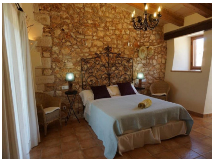
One of 9 junior suites