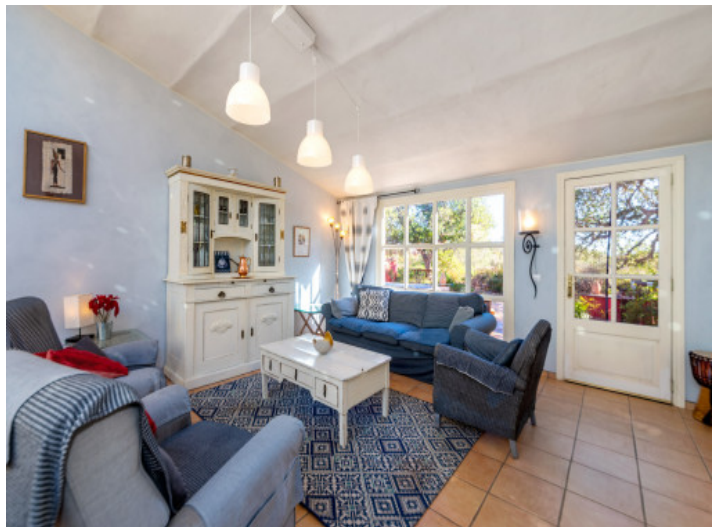
Living area Living area All information is correct to the best of our knowledge. Errors and prior sale excepted. This prospectus is purely for information purposes. Only the notarized deed of sale is legally binding.

PORTA MALLORQUINA • THERESIENSTR.: 81, 80333 MUNICH TEL. +34 971 698 242 • INFO@PORTAMALLORQUINA.COM