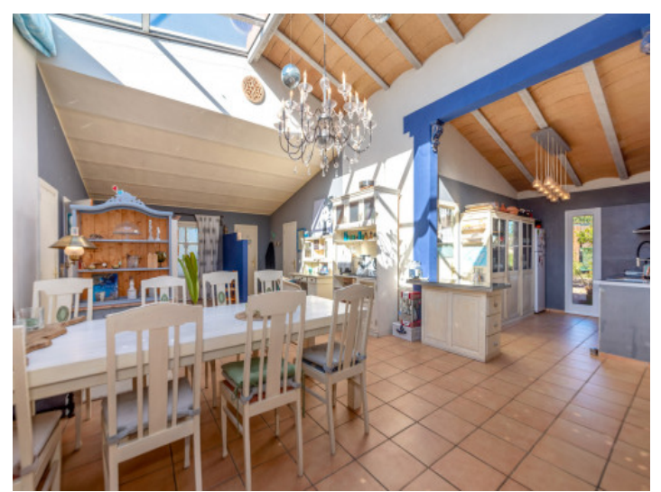
Dining area Dining area All information is correct to the best of our knowledge. Errors and prior sale excepted. This prospectus is purely for information purposes. Only the notarized deed of sale is legally binding.

PORTA MALLORQUINA • THERESIENSTR.: 81, 80333 MUNICH TEL. +34 971 698 242 • INFO@PORTAMALLORQUINA.COM