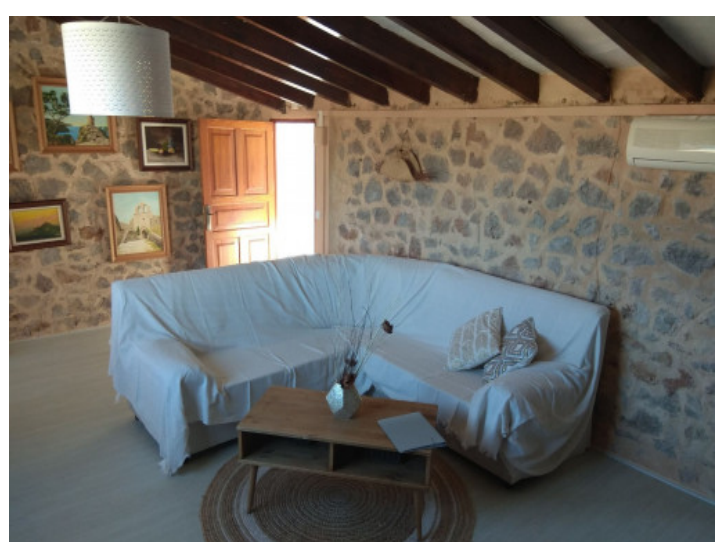
Living area Living area All information is correct to the best of our knowledge. Errors and prior sale excepted. This prospectus is purely for information purposes. Only the notarized deed of sale is legally binding.

PORTA MALLORQUINA • THERESIENSTR.: 81, 80333 MUNICH TEL. +34 971 698 242 • INFO@PORTAMALLORQUINA.COM