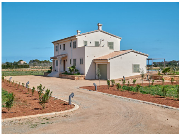
View to the property