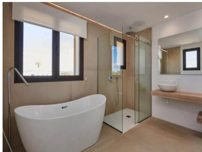
One of 3 bathrooms