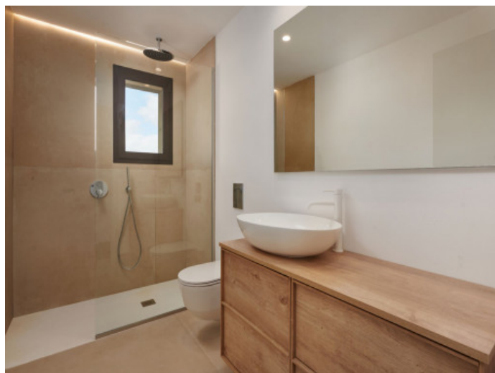
Walk in shower

All information is correct to the best of our knowledge. Errors and prior sale excepted. This prospectus is purely for information purposes. Only the notarized deed of sale is legally binding.