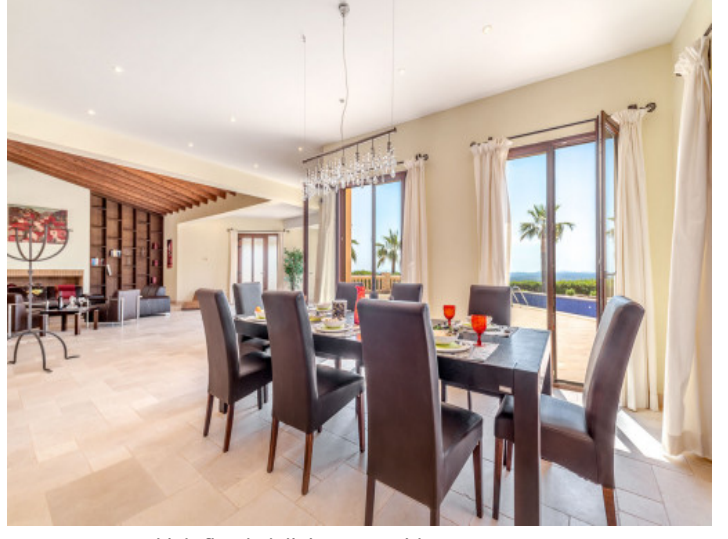
Lightflooded dining area with terrace access

All information is correct to the best of our knowledge. Errors and prior sale excepted. This prospectus is purely for information purposes. Only the notarized deed of sale is legally binding.