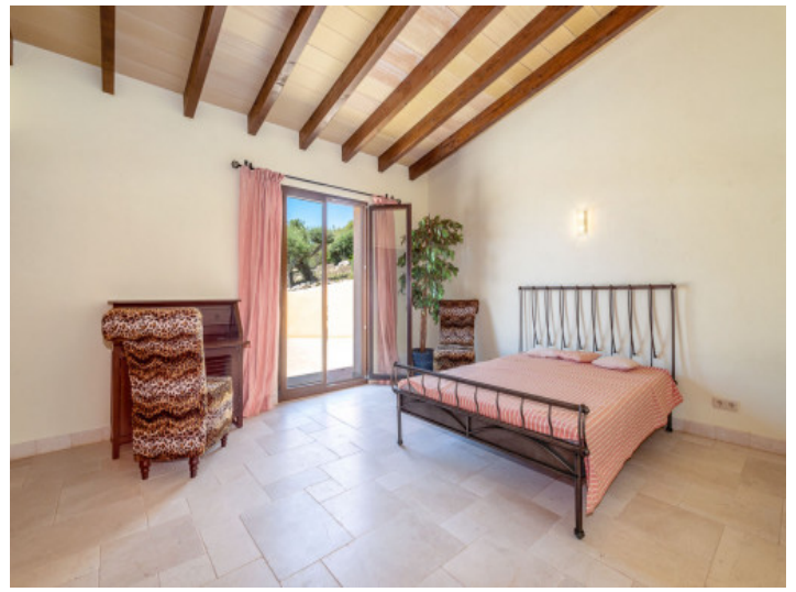
One of 10 bedrooms