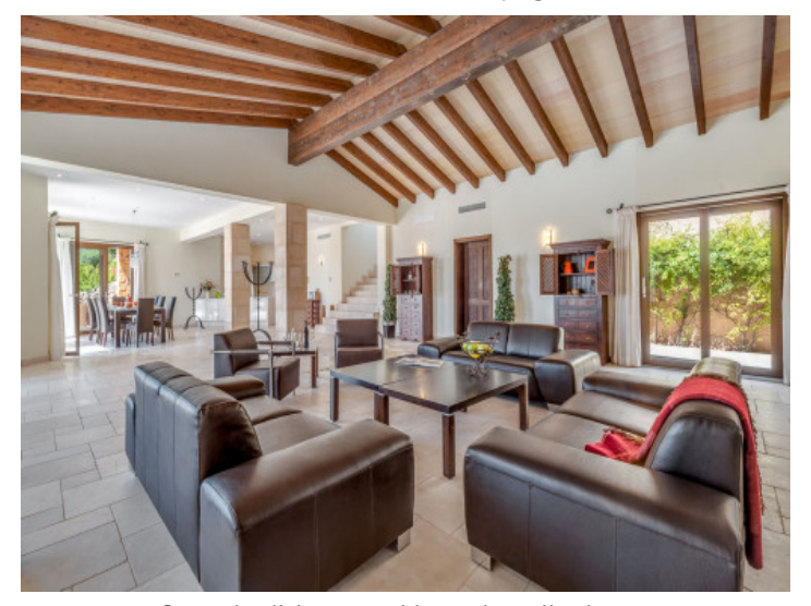
Open-plan living area with wooden celing beams