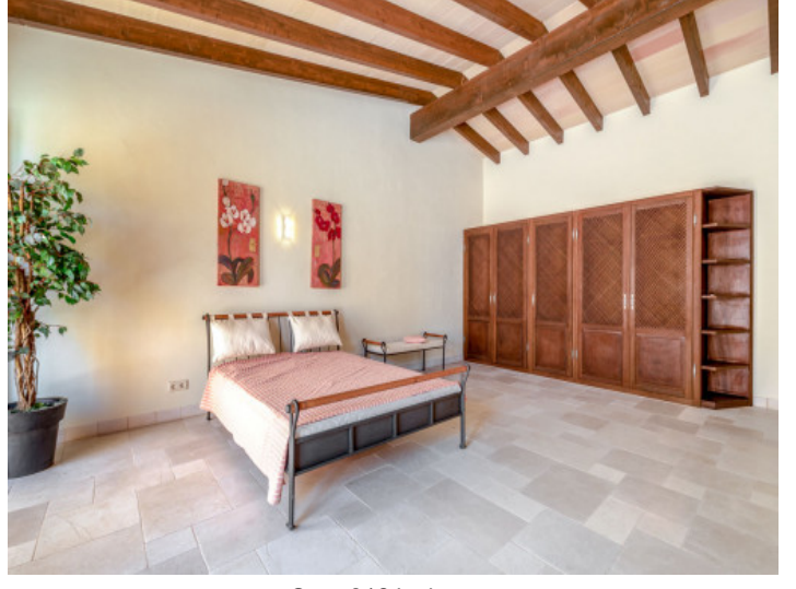
One of 10 bedrooms

All information is correct to the best of our knowledge. Errors and prior sale excepted. This prospectus is purely for information purposes. Only the notarized deed of sale is legally binding.