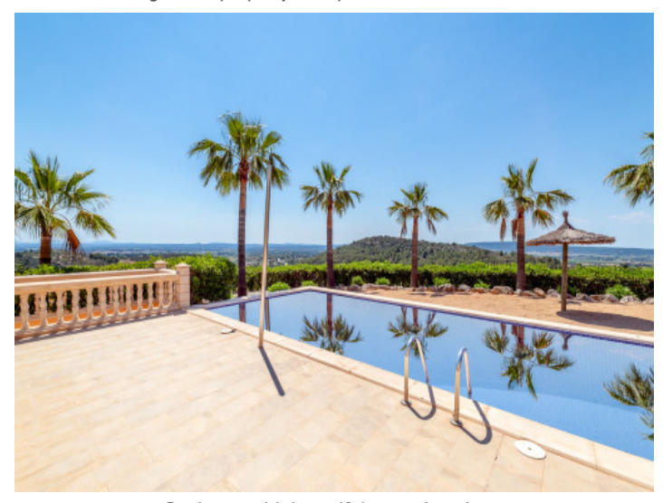
Pool area with beautiful sweeping views