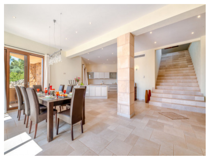
Dining area and open kitchen