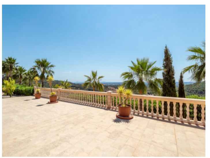
Terrace with views over the landscape