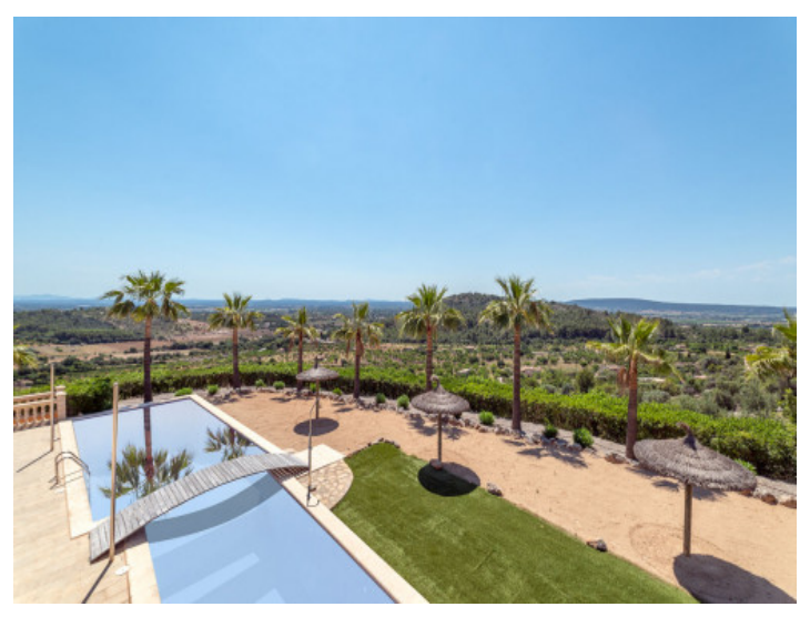
Large finca property with panoramic views in Alaro