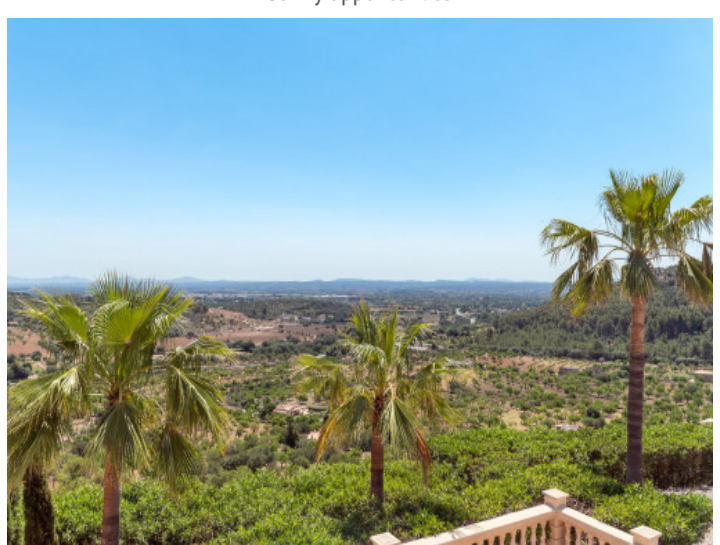
Wonderful panoramic views