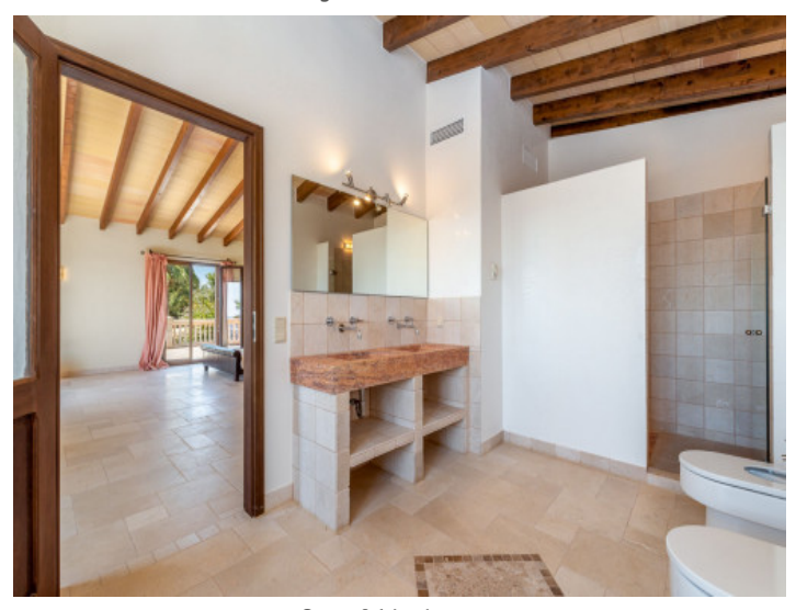
One of 6 bathrooms