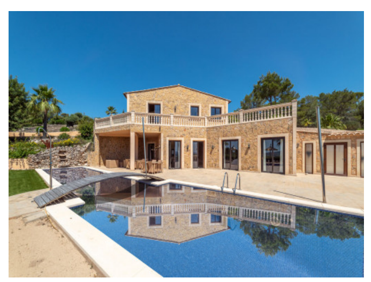
Exterior view and pool area