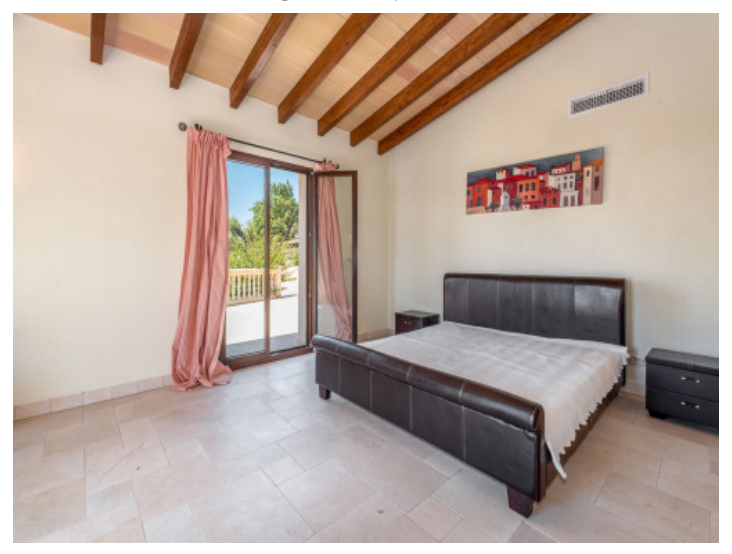
One of 10 bedrooms