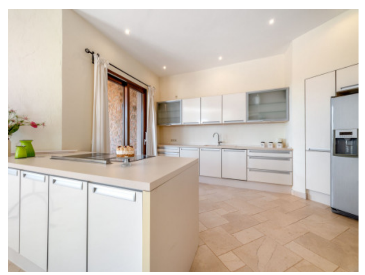
Large, modern kitchen