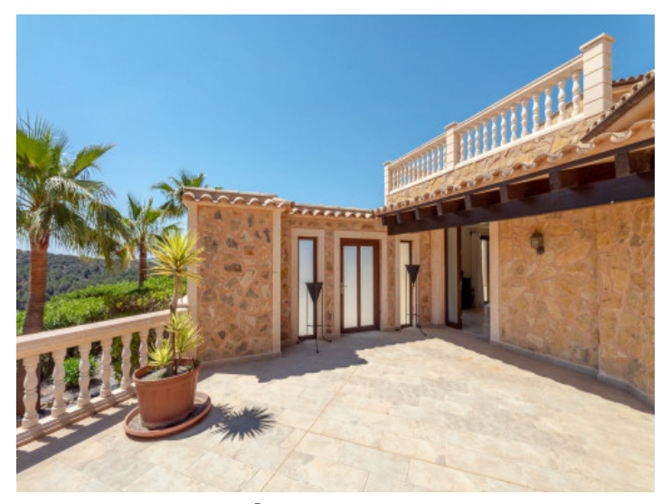
Sunny upper terrace