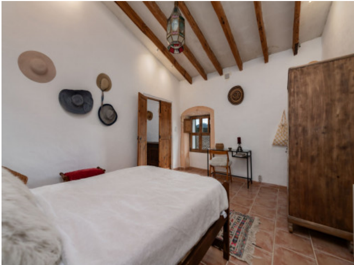
Bedroom on the first floor