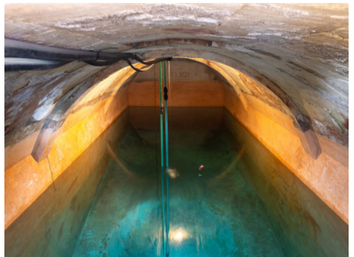
Underground waterbasin from 1829

All information is correct to the best of our knowledge. Errors and prior sale excepted. This prospectus is purely for information purposes. Only the notarized deed of sale is legally binding.