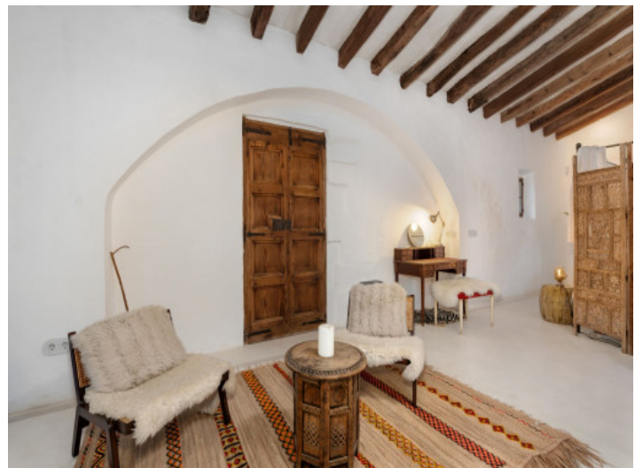
Master bedroom with high ceilings and restored wooden beams

All information is correct to the best of our knowledge. Errors and prior sale excepted. This prospectus is purely for information purposes. Only the notarized deed of sale is legally binding.