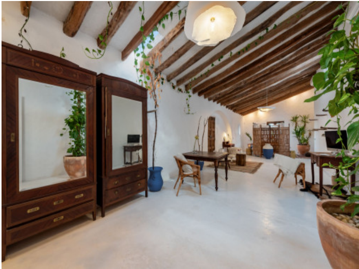
Master bedroom on the first floor