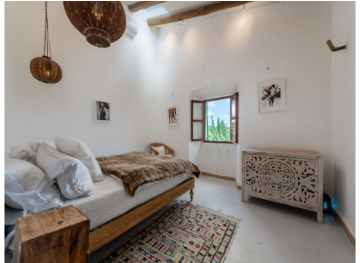
Bedroom with views of the San Salvador monastery