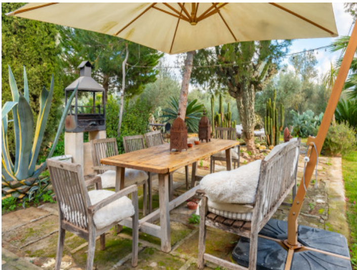
Dining al Fresco