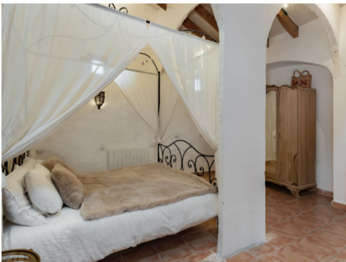
Large romantic bedroom