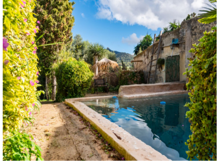
Beautiful pool area