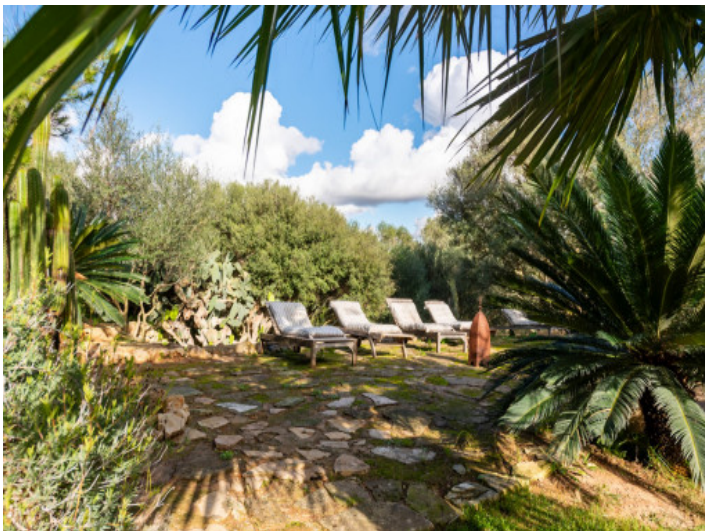
Lots of privacy