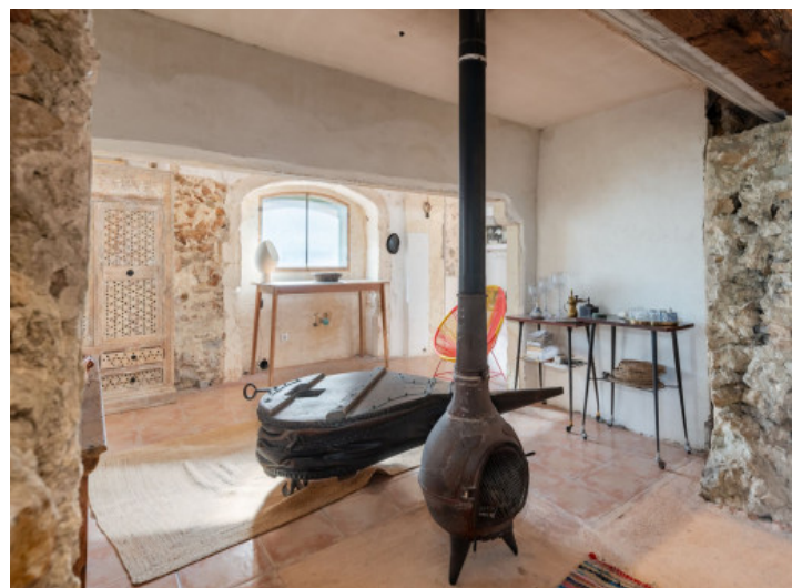
Fireplace open to the kitchen and dining room

All information is correct to the best of our knowledge. Errors and prior sale excepted. This prospectus is purely for information purposes. Only the notarized deed of sale is legally binding.