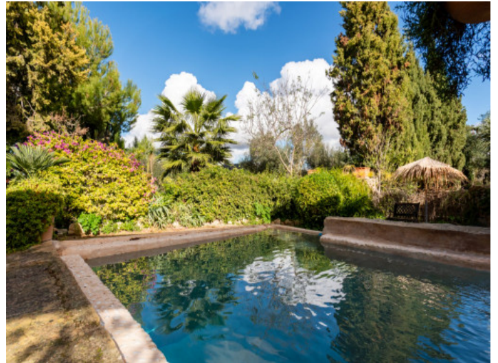
Old water basin converted into a pool