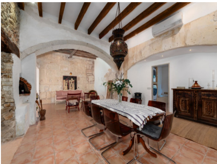
Amazing dining area with stone arches