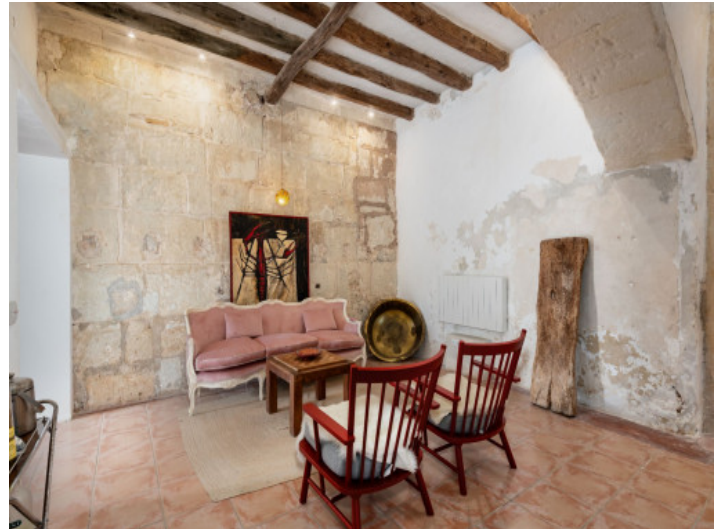
Restored sandstone walls