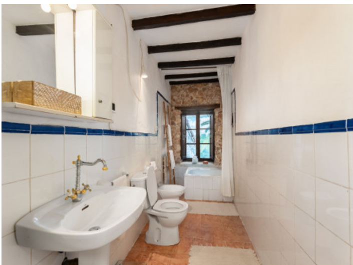
Second bathroom with garden view