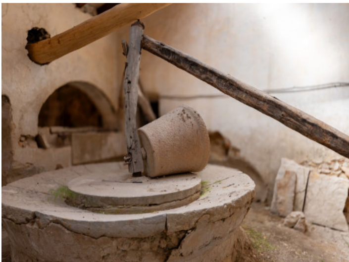
Olive press from the 15 century