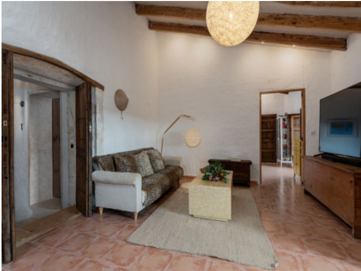
Upper living room with fireplace