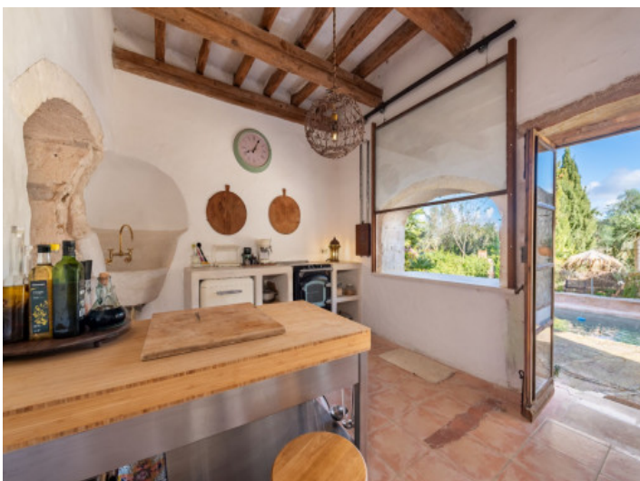
Kitchen with views over the pool