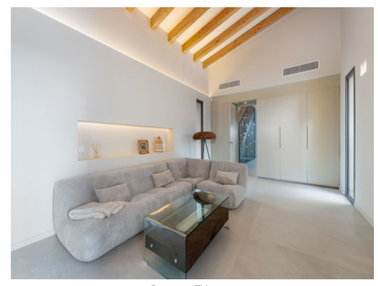
Separate TV room