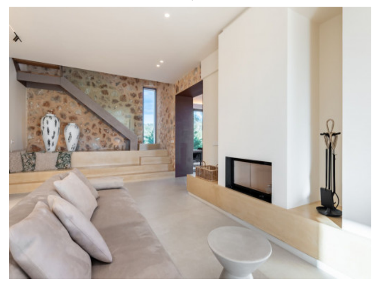
Cozy living area with fireplace