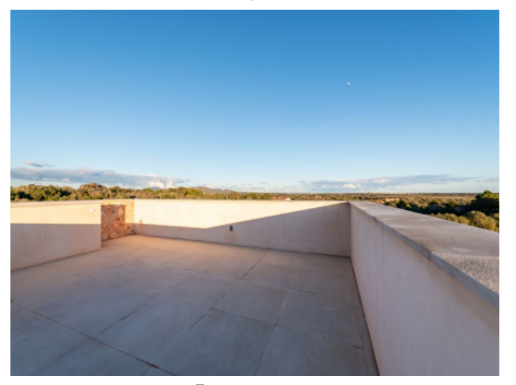
Terrace guest area