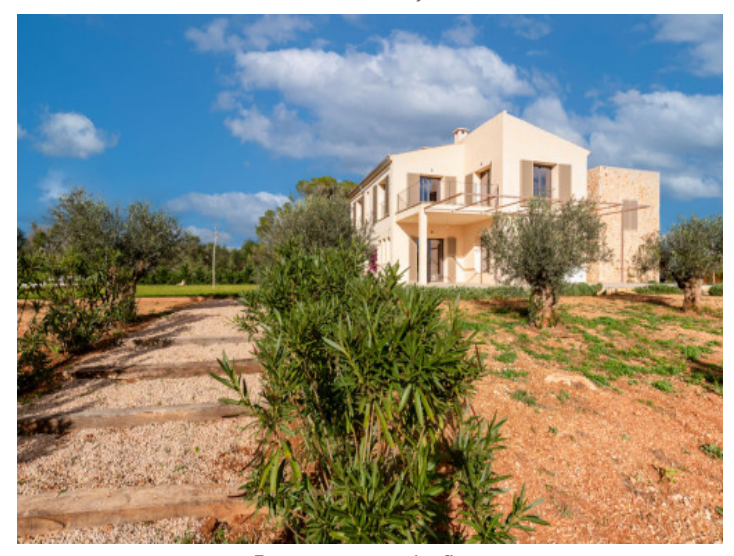
Entrance way to the finca