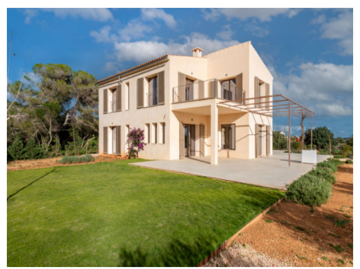
Garden and façade