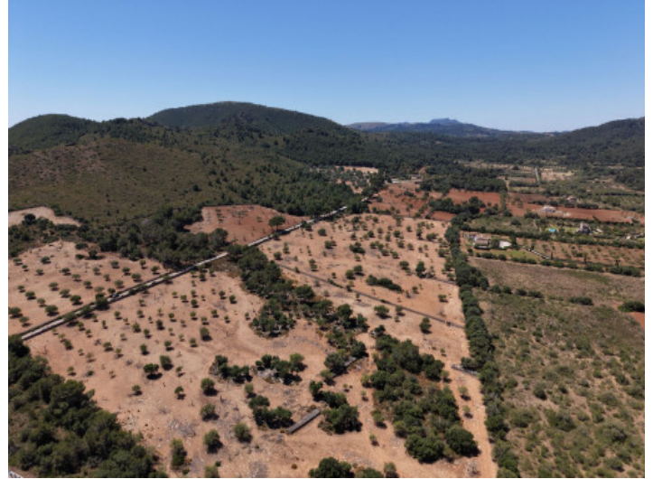
Mountain and sea view