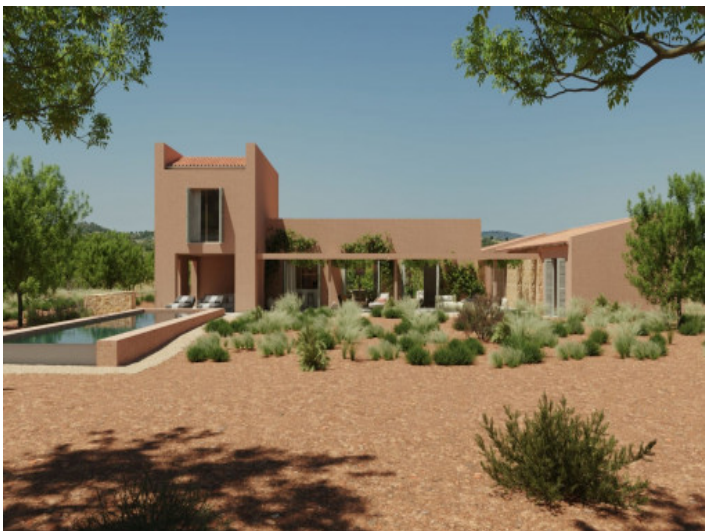
Large plot with great project near Cala Mencia