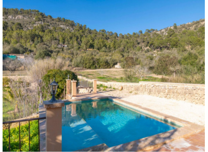
Very nice pool area

All information is correct to the best of our knowledge. Errors and prior sale excepted. This prospectus is purely for information purposes. Only the notarized deed of sale is legally binding.