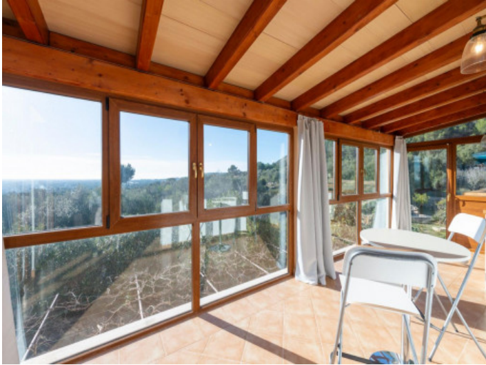
Dining area with amazing views