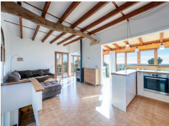
Living, dining and kitchen area