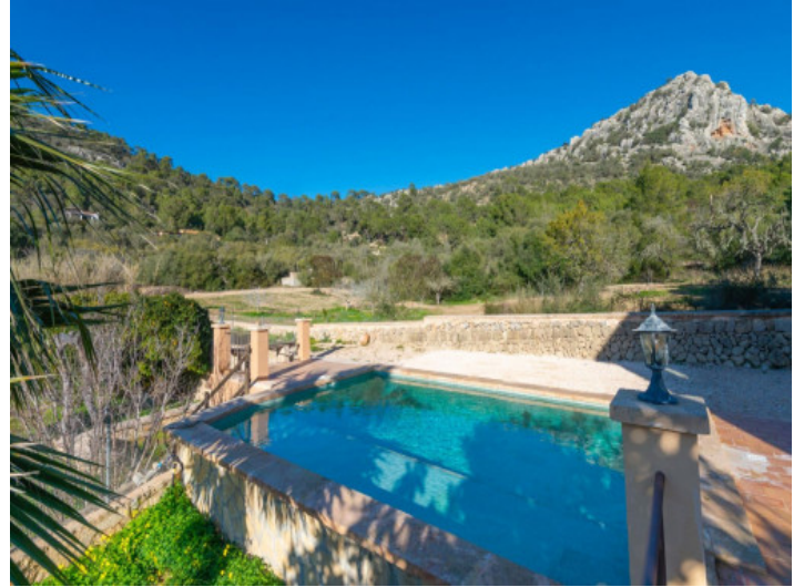
Pool integrated in nature