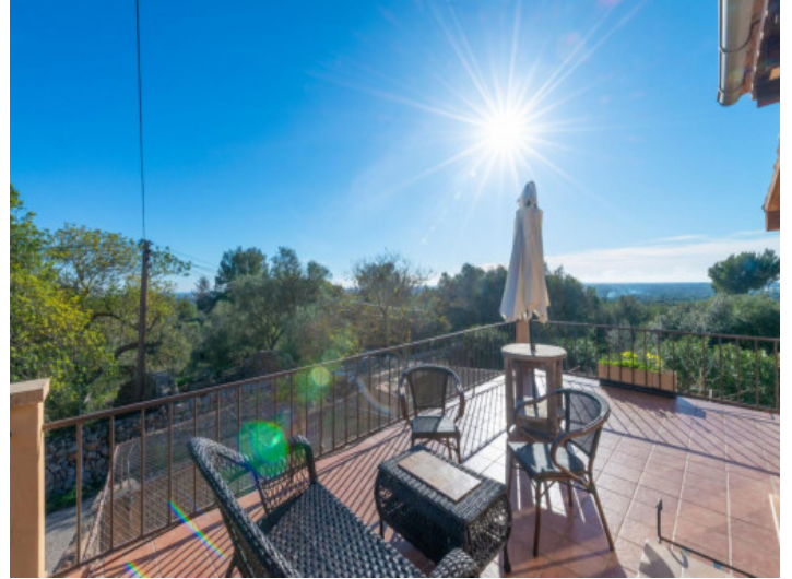
Terrace with views