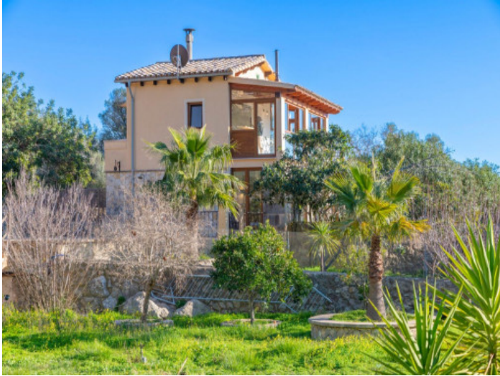
View to the finca