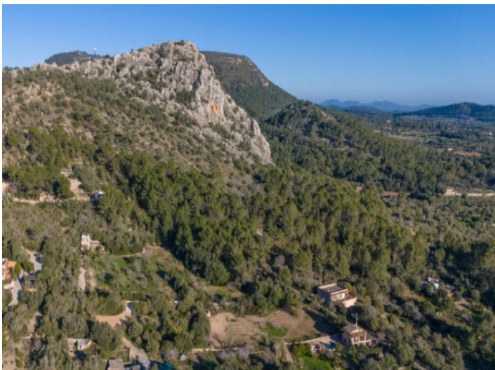
Surrounded by nature