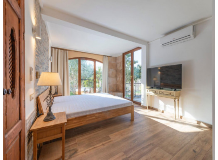
Finca with 3 bedrooms