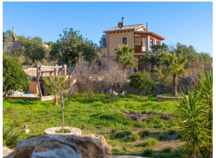
View to the finca