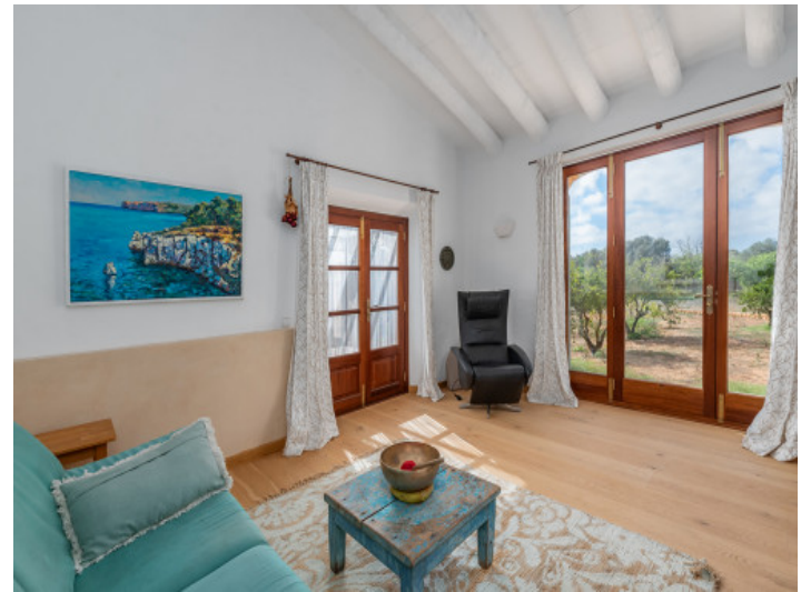
Chill out area All information is correct to the best of our knowledge. Errors and prior sale excepted. This prospectus is purely for information purposes. Only the notarized deed of sale is legally binding.