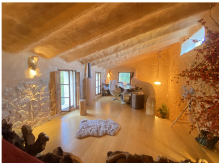
Living area and study