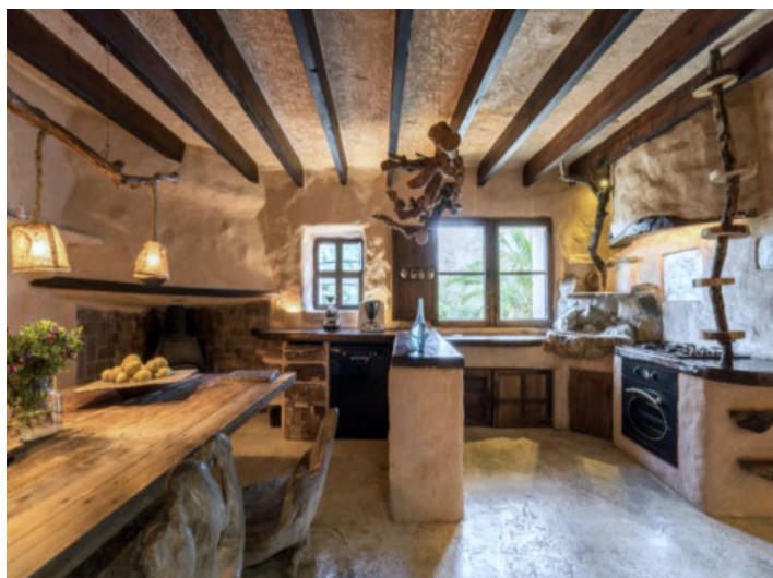
Dining area and open kitchen