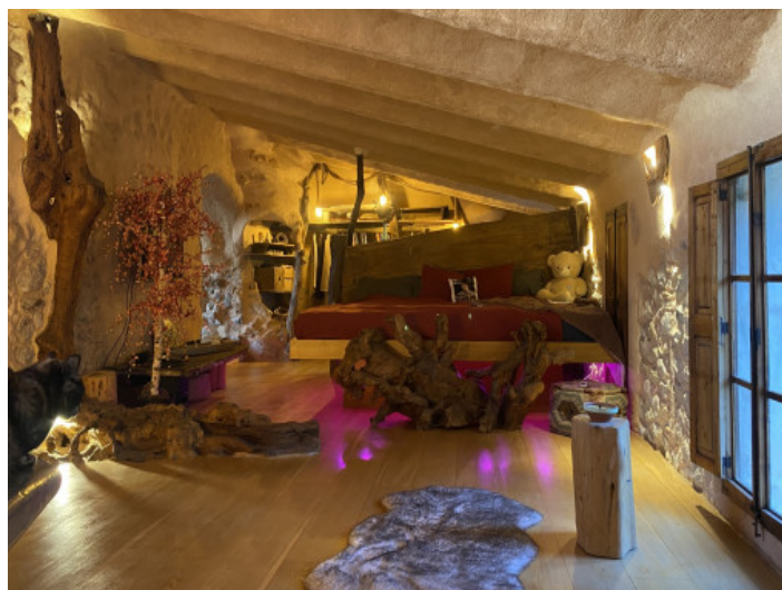
Living area and study

All information is correct to the best of our knowledge. Errors and prior sale excepted. This prospectus is purely for information purposes. Only the notarized deed of sale is legally binding.