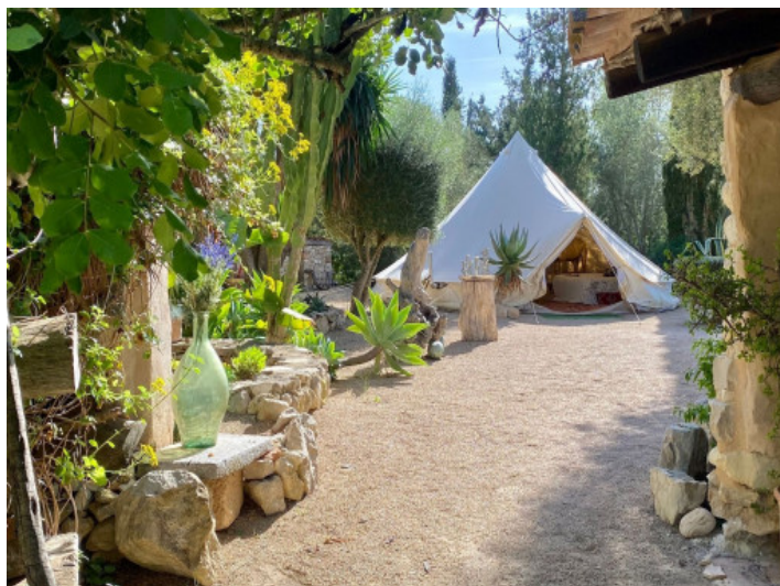
Oriental glamping area