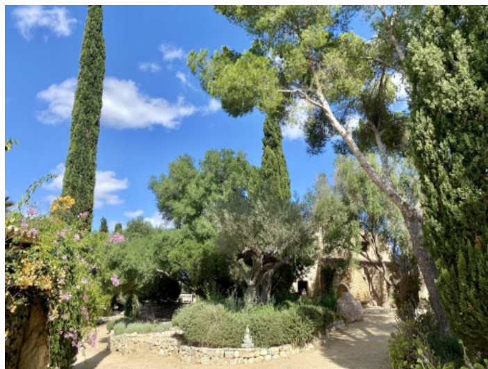
Well-maintained garden with mature trees