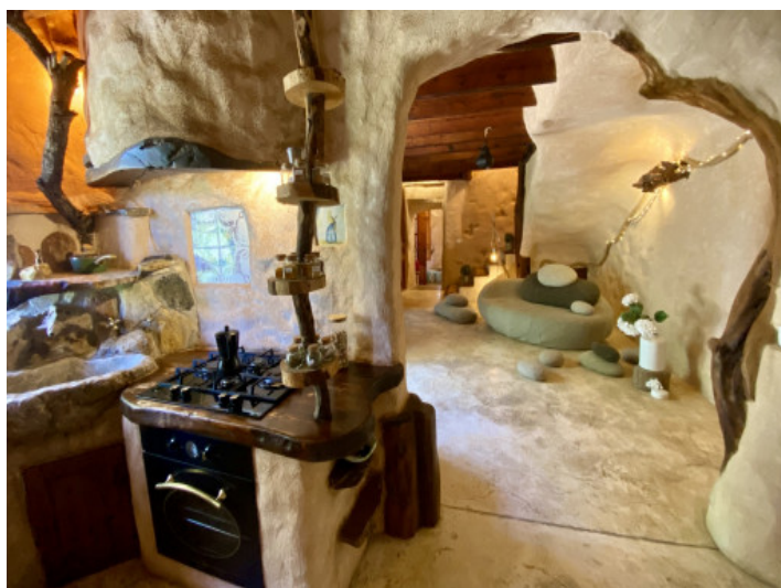
Kitchen adjacent to the living area