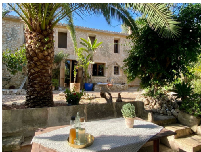
View to this gem