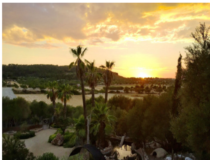
Finca Sant Joan