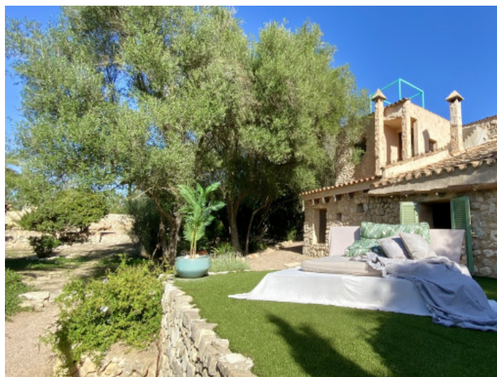
Chill out area

All information is correct to the best of our knowledge. Errors and prior sale excepted. This prospectus is purely for information purposes. Only the notarized deed of sale is legally binding.