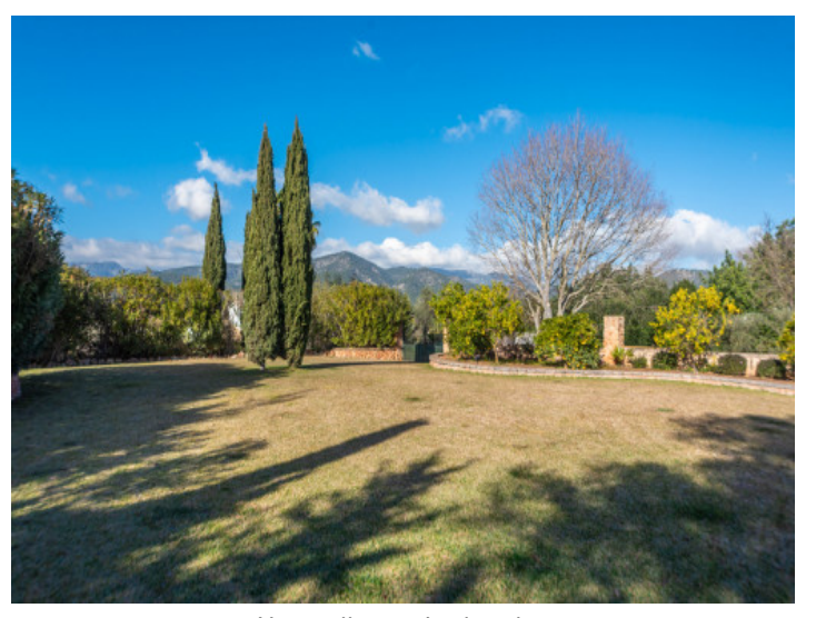
Very well mantained garden

All information is correct to the best of our knowledge. Errors and prior sale excepted. This prospectus is purely for information purposes. Only the notarized deed of sale is legally binding.