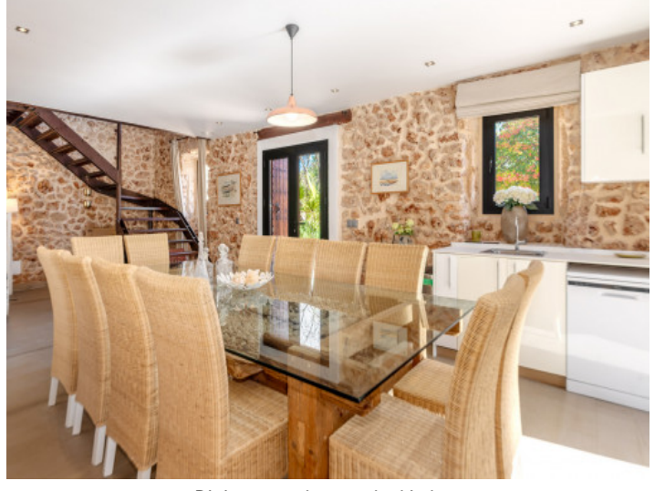
Dining area close to the kitchen

All information is correct to the best of our knowledge. Errors and prior sale excepted. This prospectus is purely for information purposes. Only the notarized deed of sale is legally binding.