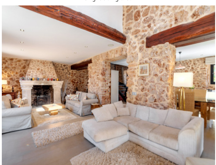
High ceilings and natural stone walls