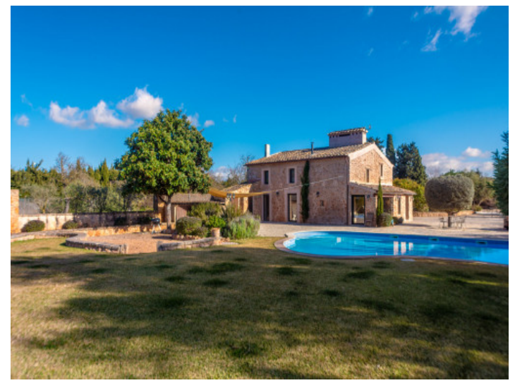
Enchanting, renovated natural-stone finca near Santa María with beautiful garden and large pool