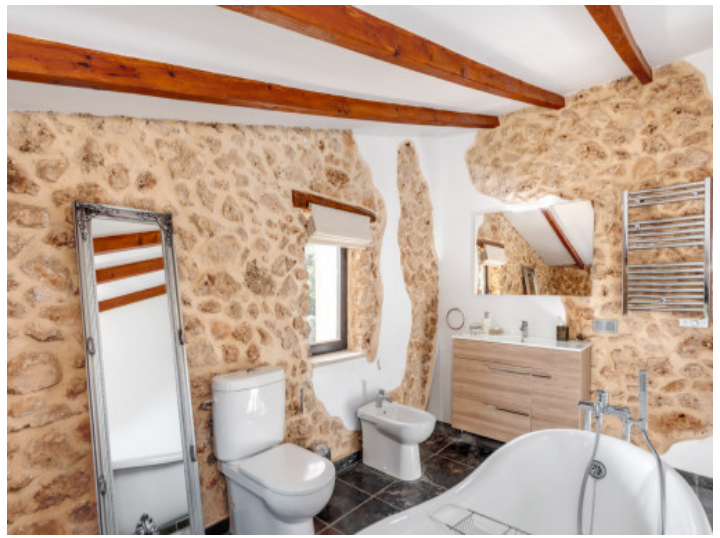
Fully equipped bathroom