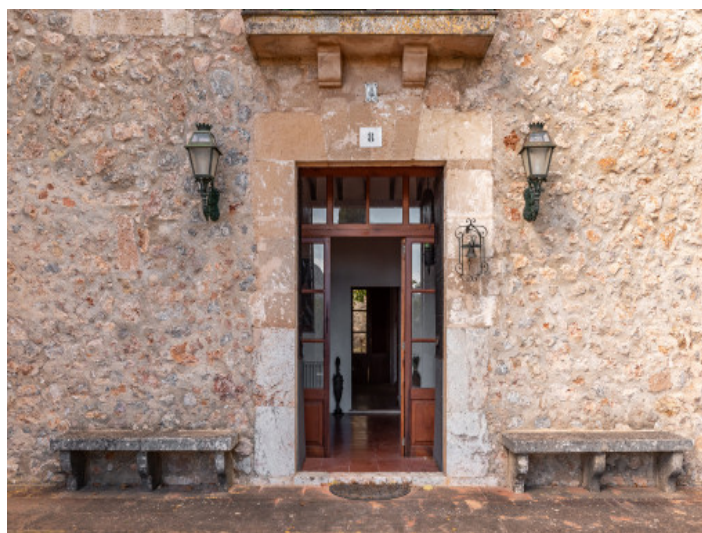
Pristine entrance to the country property