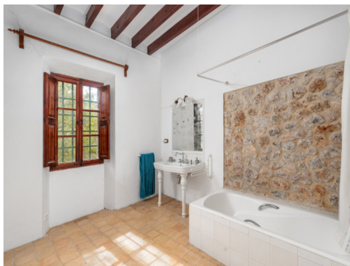
One of 14 bedrooms