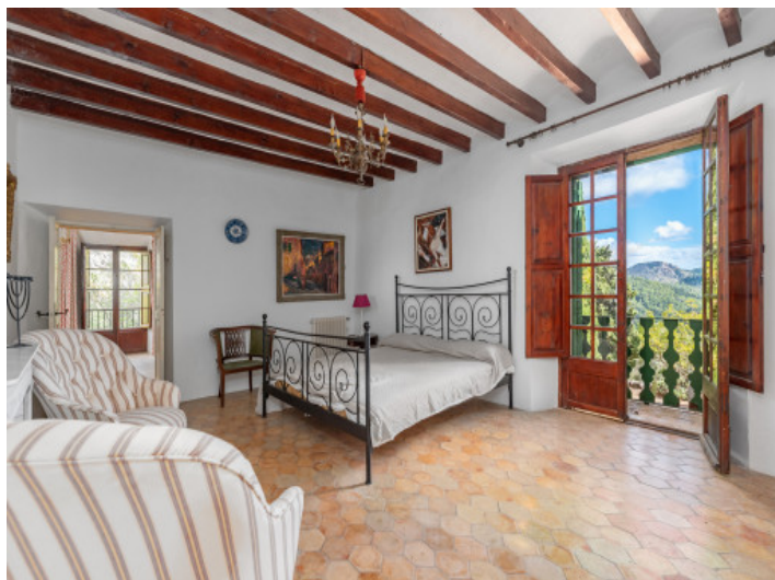
One of 14 bedrooms