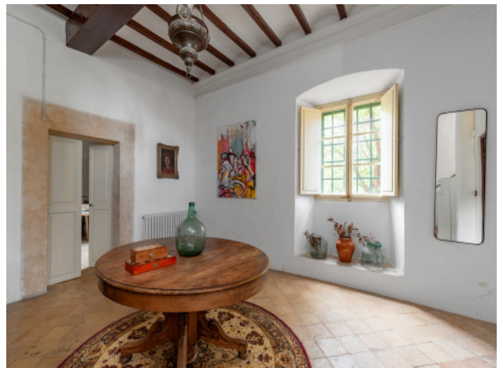
Lovely entrance area

All information is correct to the best of our knowledge. Errors and prior sale excepted. This prospectus is purely for information purposes. Only the notarized deed of sale is legally binding.