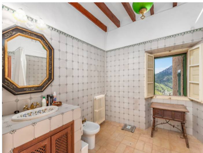
One of 7 bathrooms

All information is correct to the best of our knowledge. Errors and prior sale excepted. This prospectus is purely for information purposes. Only the notarized deed of sale is legally binding.