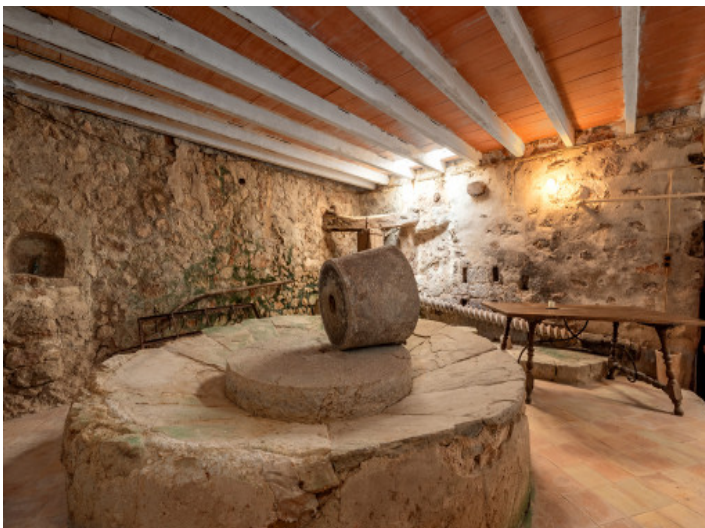
Historic olive press