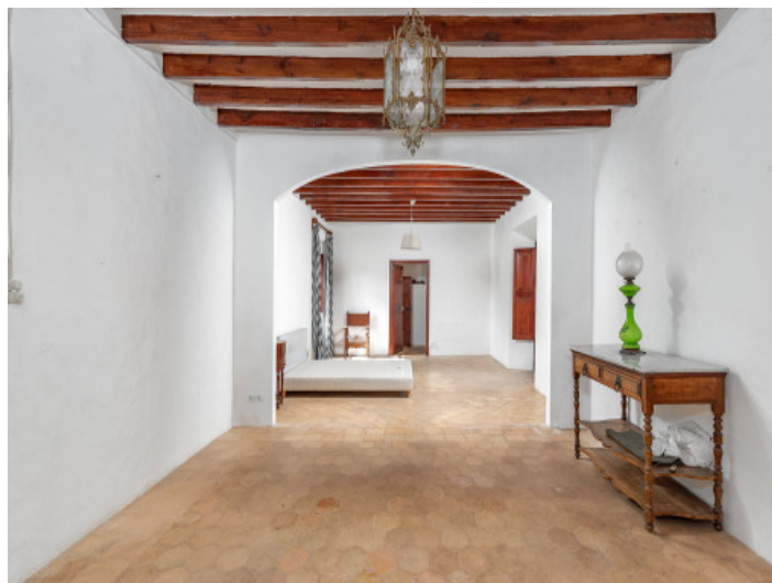
One of 14 bedrooms