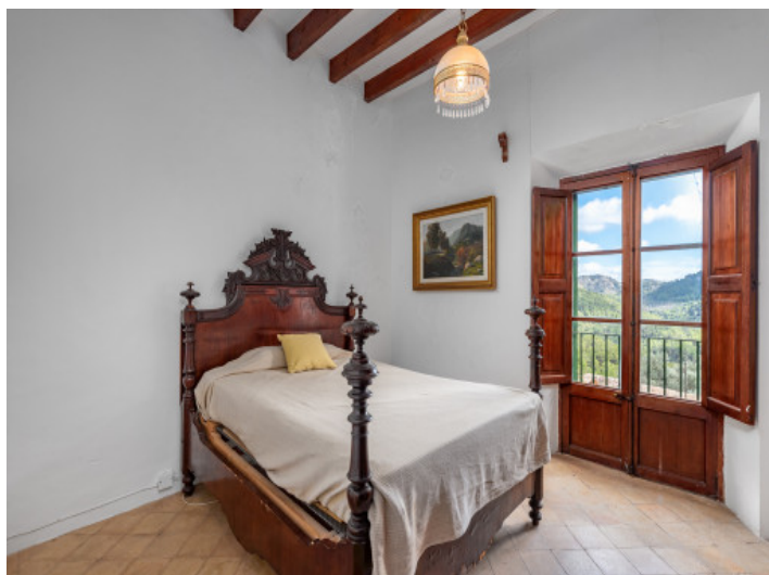
One of 14 bedrooms