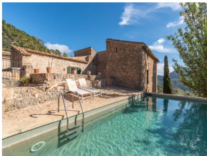
Pool with mountain views

All information is correct to the best of our knowledge. Errors and prior sale excepted. This prospectus is purely for information purposes. Only the notarized deed of sale is legally binding.