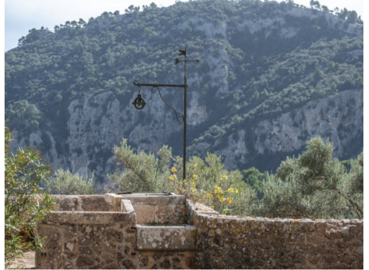
Fantastic mountain views