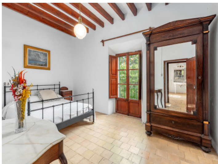
One of 14 bedrooms