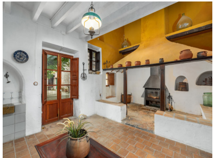
Historical part of the kitchen