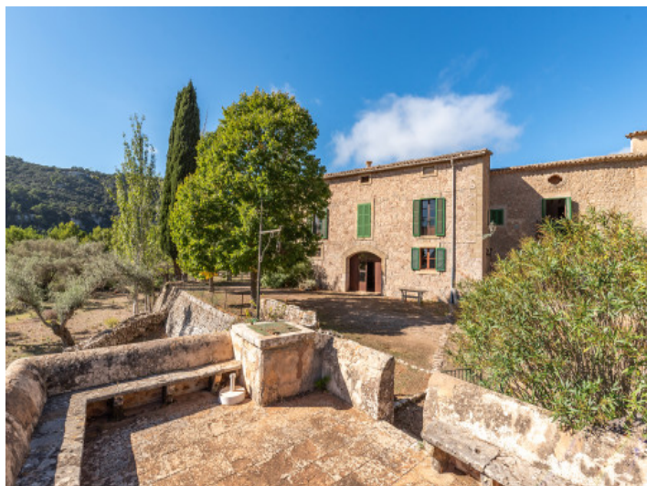
Exterior view of the property