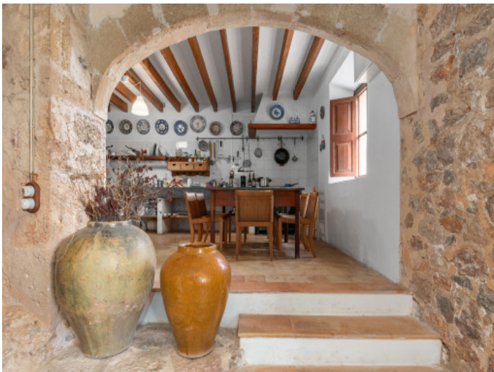
Country kitchen with dining area