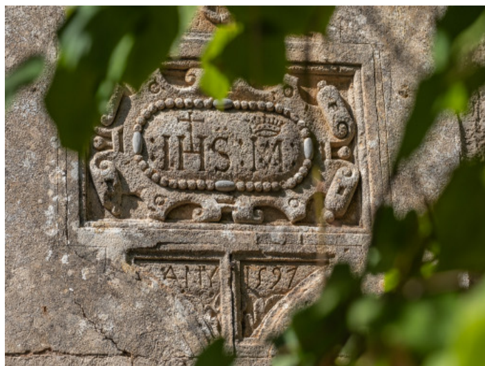
Built in 1597

All information is correct to the best of our knowledge. Errors and prior sale excepted. This prospectus is purely for information purposes. Only the notarized deed of sale is legally binding.