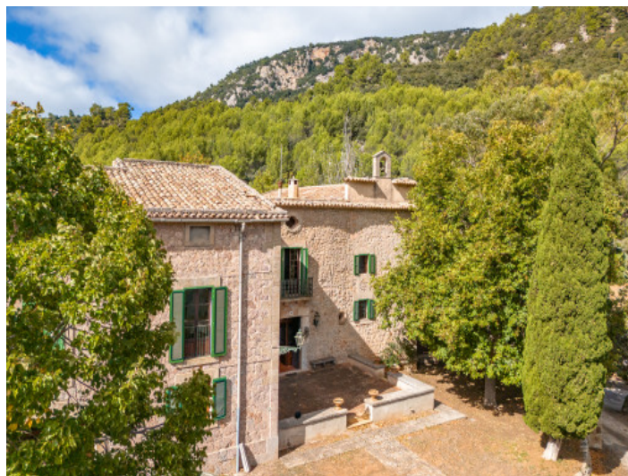
Natural stone façade