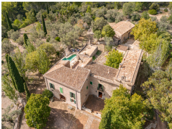
Nestled in the Tramuntana mountains