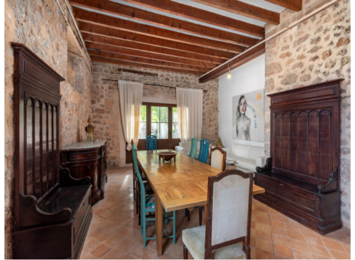
Dining area with antiques