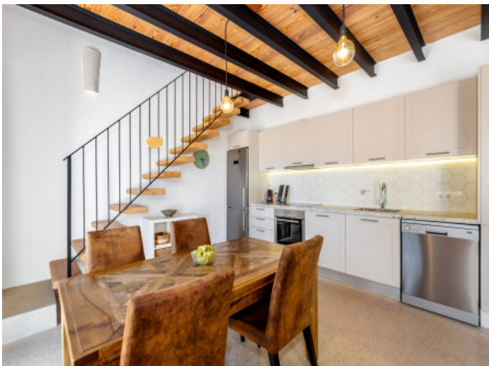
dining and kitchen area