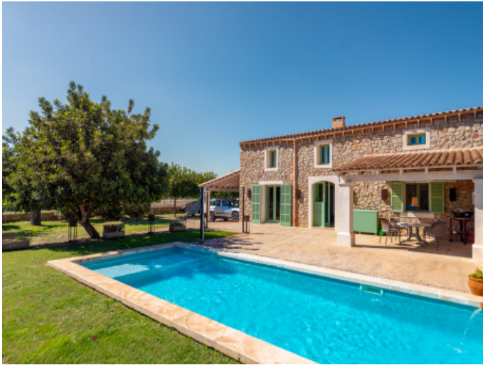
Garten and pool