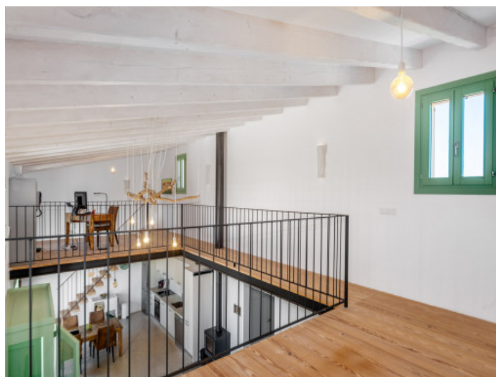
Study room 1. floor