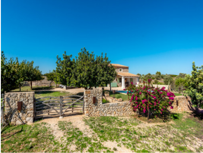
Entrance way to the finca

All information is correct to the best of our knowledge. Errors and prior sale excepted. This prospectus is purely for information purposes. Only the notarized deed of sale is legally binding.