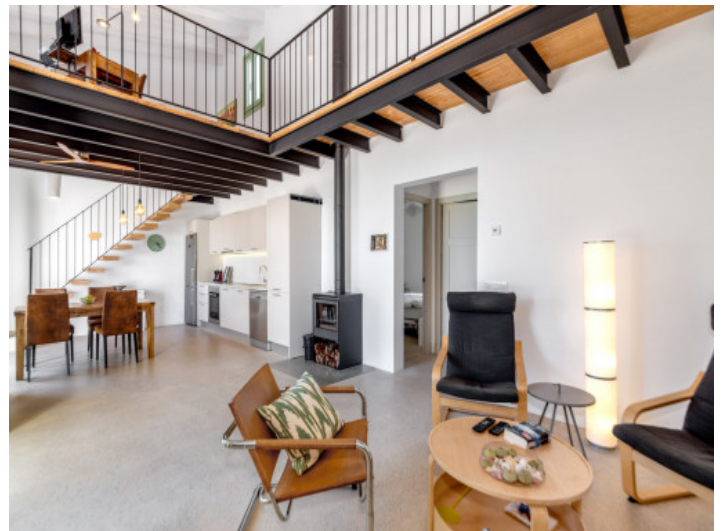
Open room layout