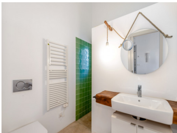
Finca with 2 bathrooms