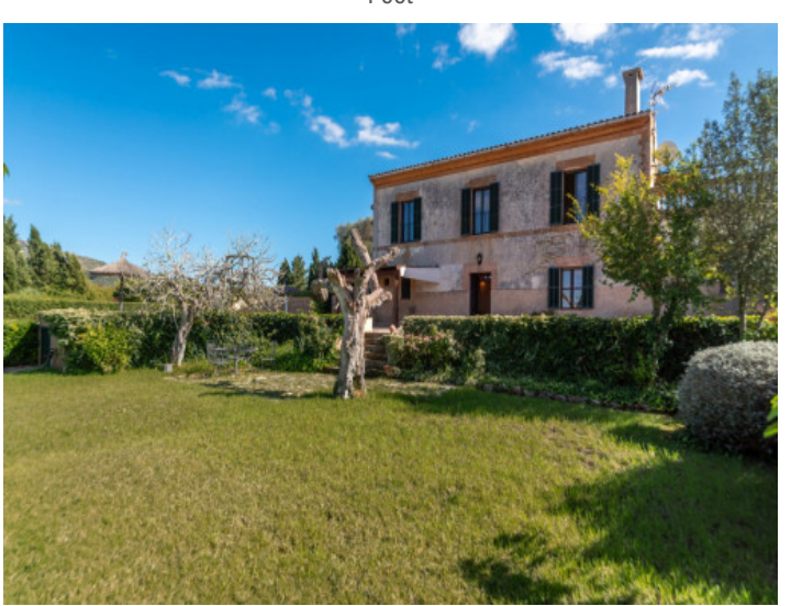
View to the garden and façade