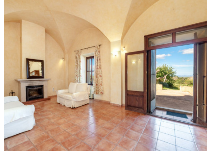
finca-maLiving and dining areanacor-pool-mallorca-rent05