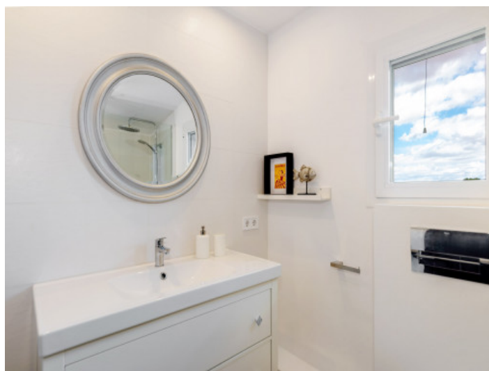
En suite bathroom