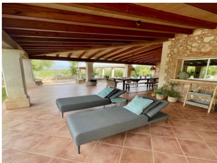
Terrace with shadow