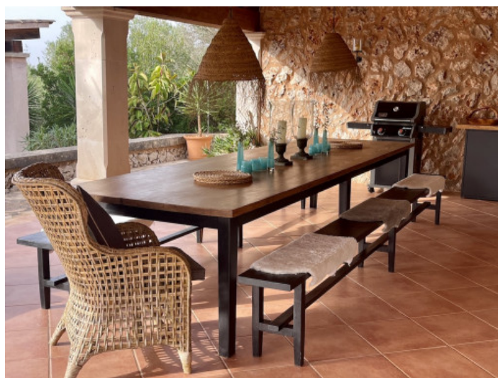
Inviting seating with a panoramic view