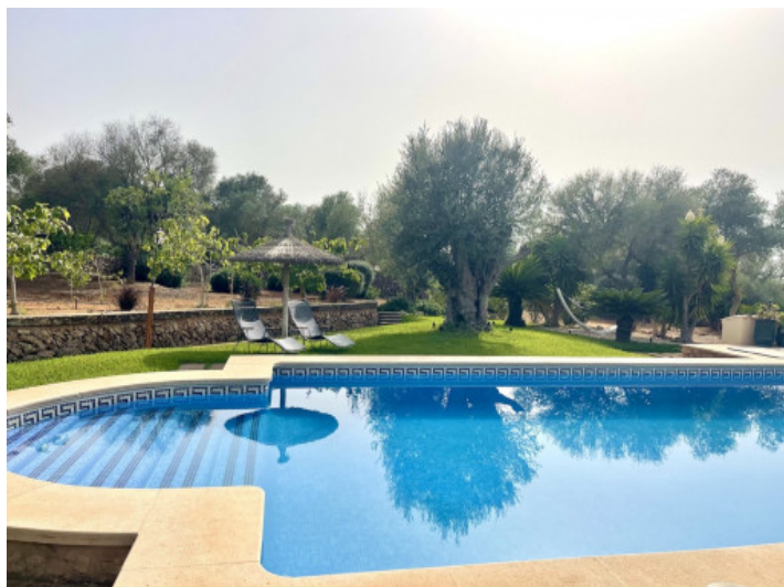
Peaceful oasis by the pool