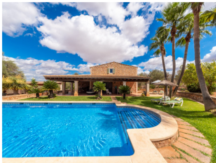
Garden and pool