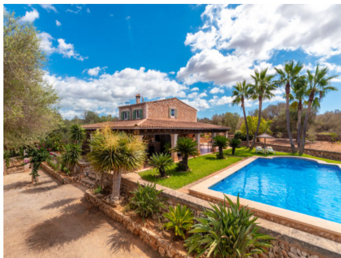
View to the finca

All information is correct to the best of our knowledge. Errors and prior sale excepted. This prospectus is purely for information purposes. Only the notarized deed of sale is legally binding.