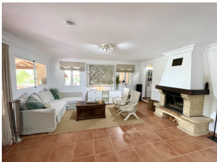
Bright living area with fireplace