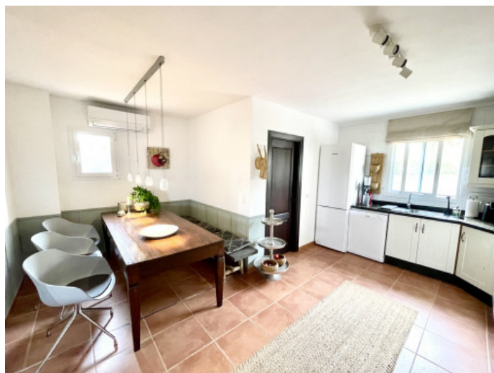
Cozy dining area

All information is correct to the best of our knowledge. Errors and prior sale excepted. This prospectus is purely for information purposes. Only the notarized deed of sale is legally binding.