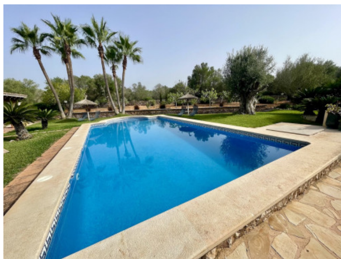
Sun terrace at the pool