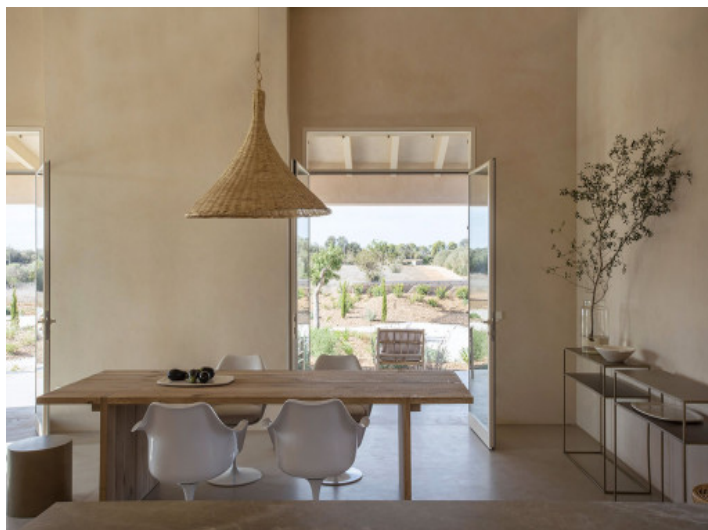
Kitchen and dining area