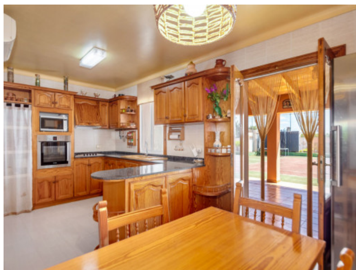
Country style kitchen