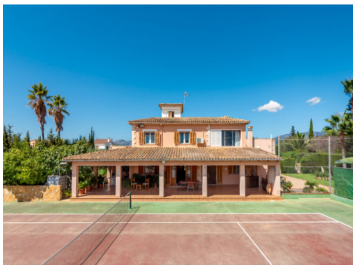
Façade and tennis court