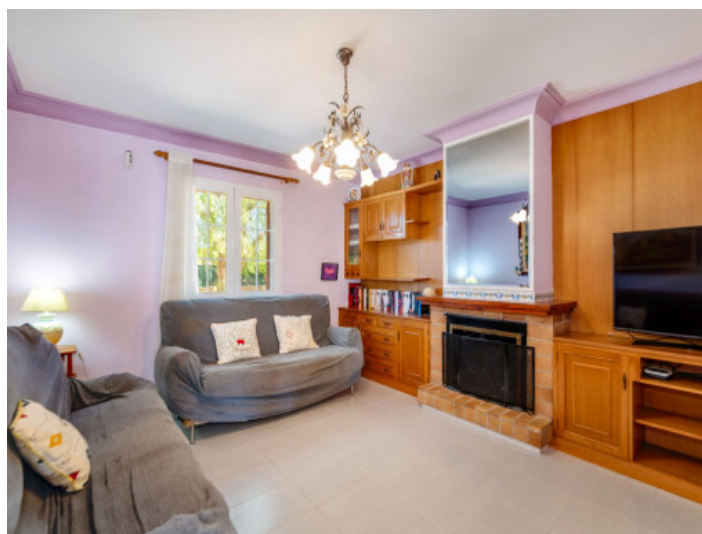
Living area with fireplace