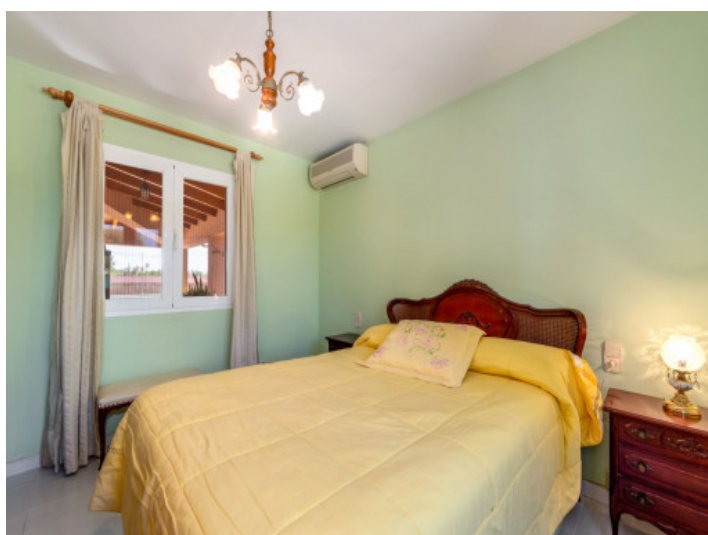
One of 4 bedrooms