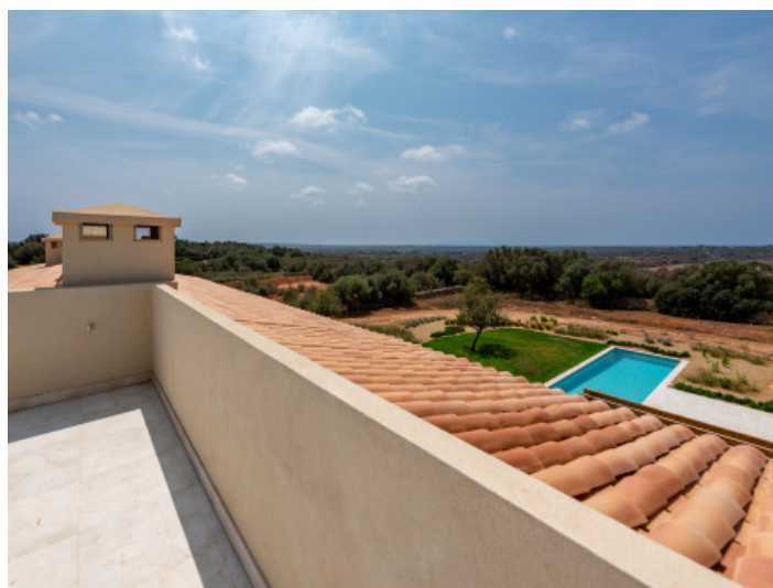
View from the first floor