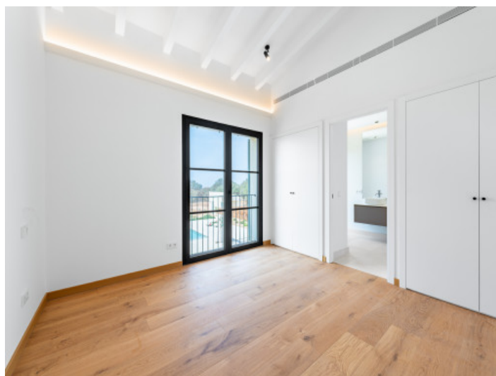
Bedroom with en suite bathroom