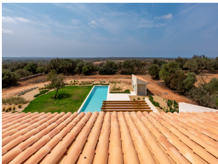
Views up to the sea