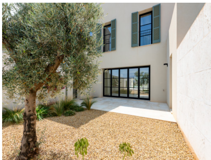
Patio close to the kitchen