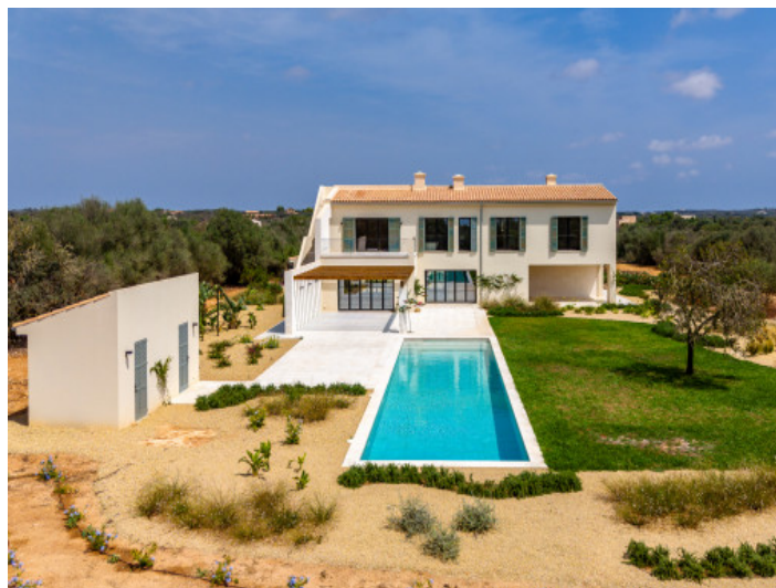
Garden view of the finca