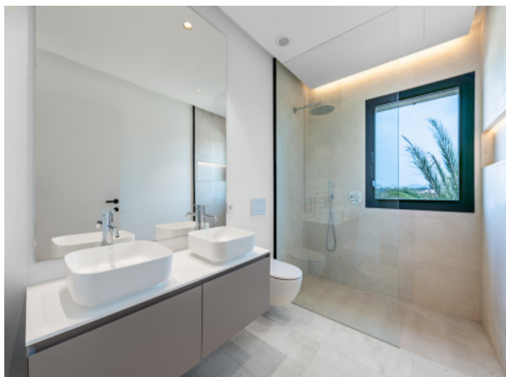
En suite bathroom