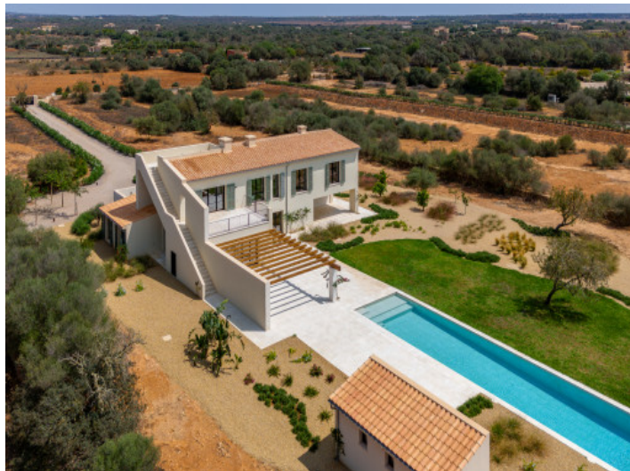
View to the property