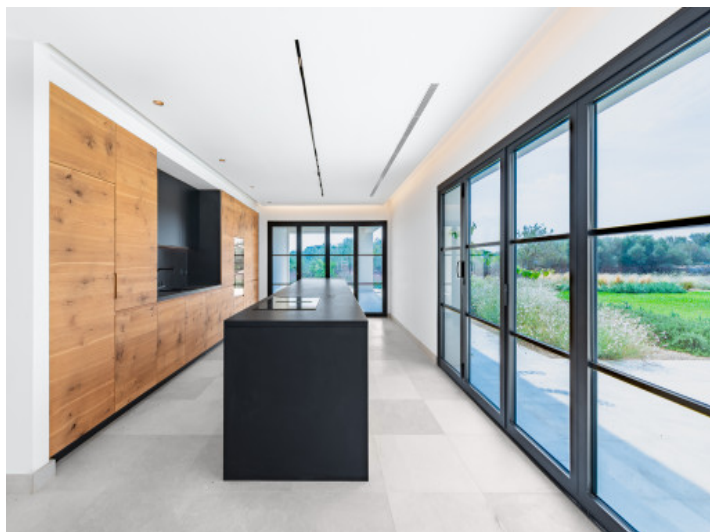
Modern kitchen with kitchen island