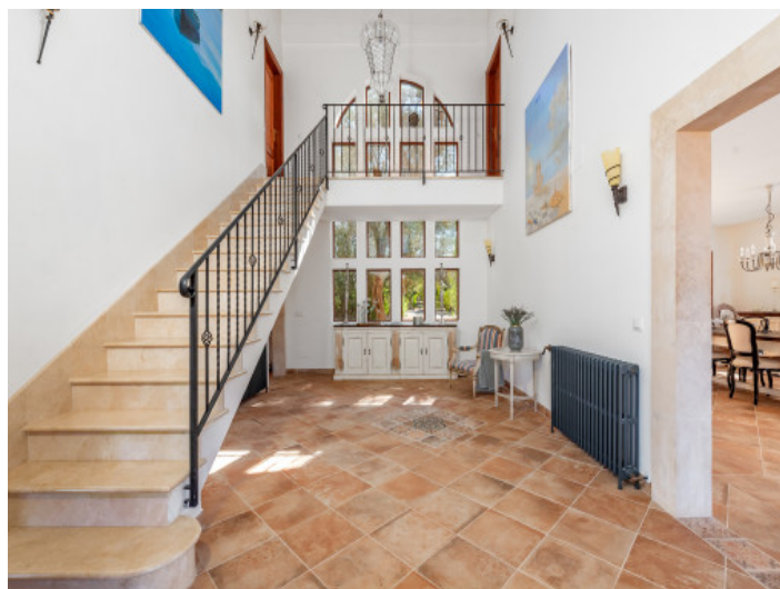
Large entrance hall

All information is correct to the best of our knowledge. Errors and prior sale excepted. This prospectus is purely for information purposes. Only the notarized deed of sale is legally binding.