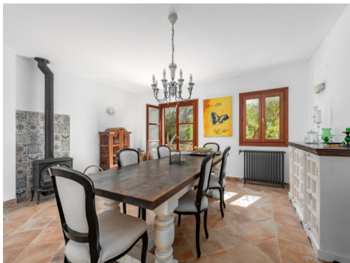
Dining area with fireplace