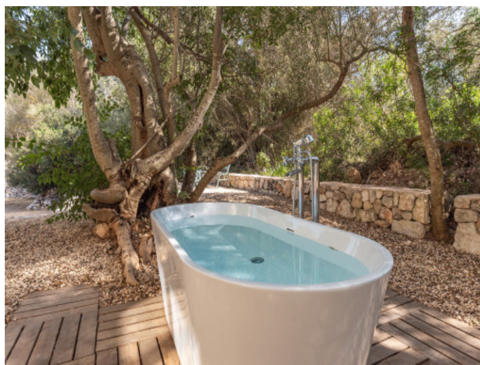
Refreshing cooling in the garden