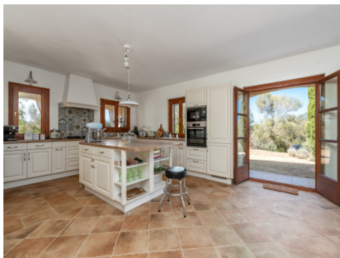
Large country style kitchen