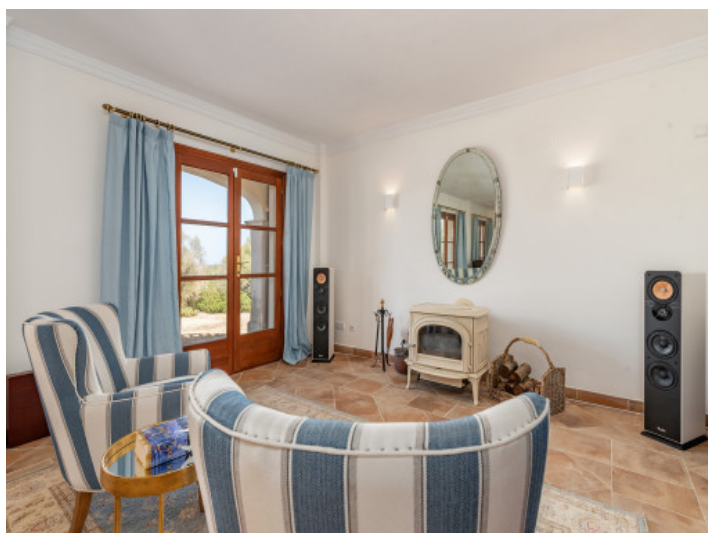
Living room with fireplace