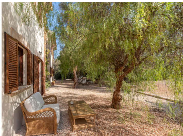
Beautiful spot in the garden