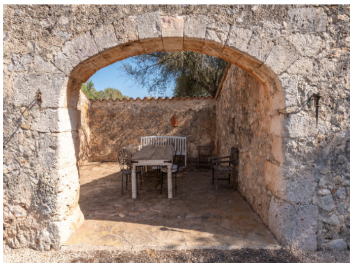
Romantic outdoor dining