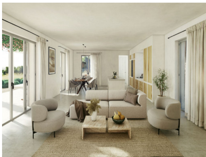
Modern interior design