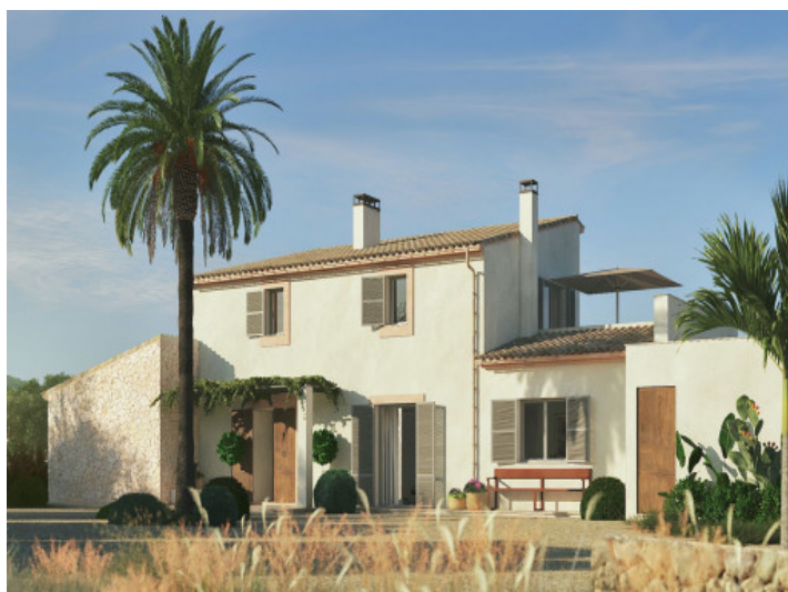
View to the finca project