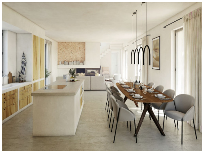
Large kitchen and dining area