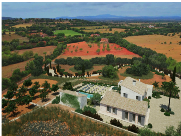
Aerial view to the Project