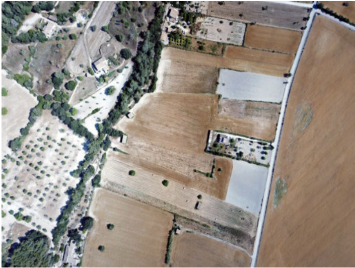
Aerial view of the plot