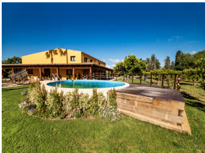
Pool and garden