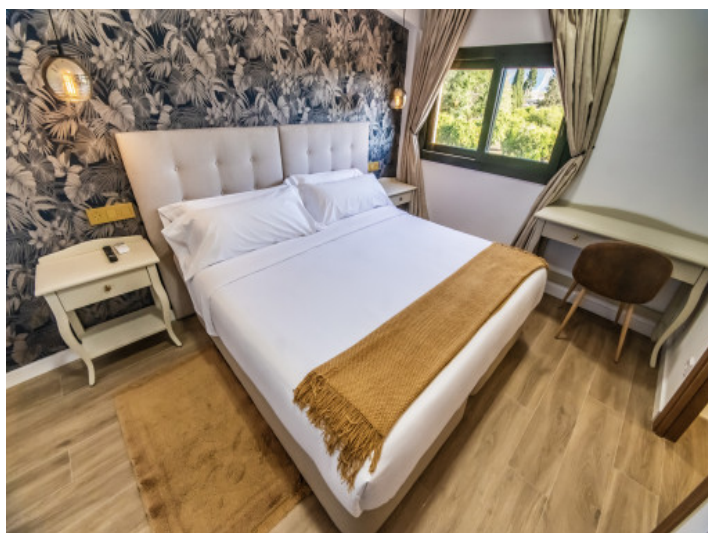
One of 12 bedrooms