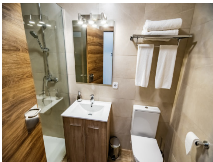
One of 12 bathrooms