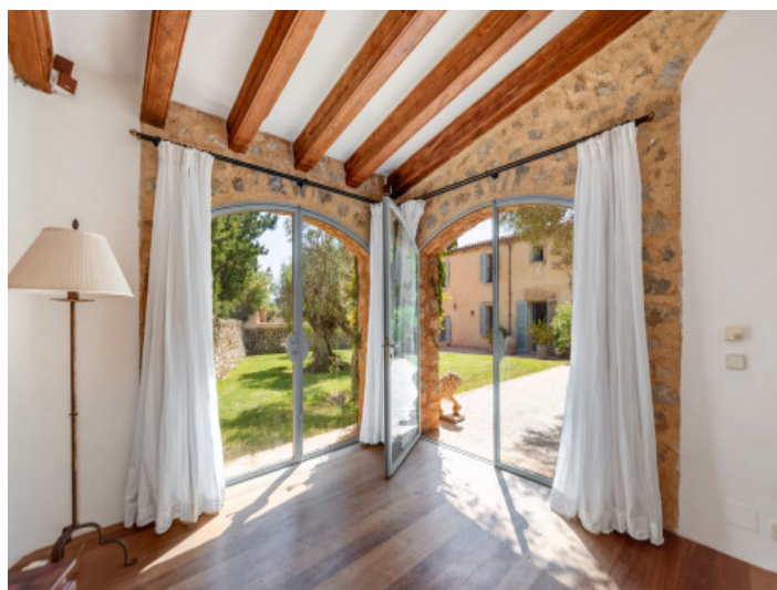
Fantastic garden views