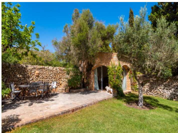
Very well maintained garden