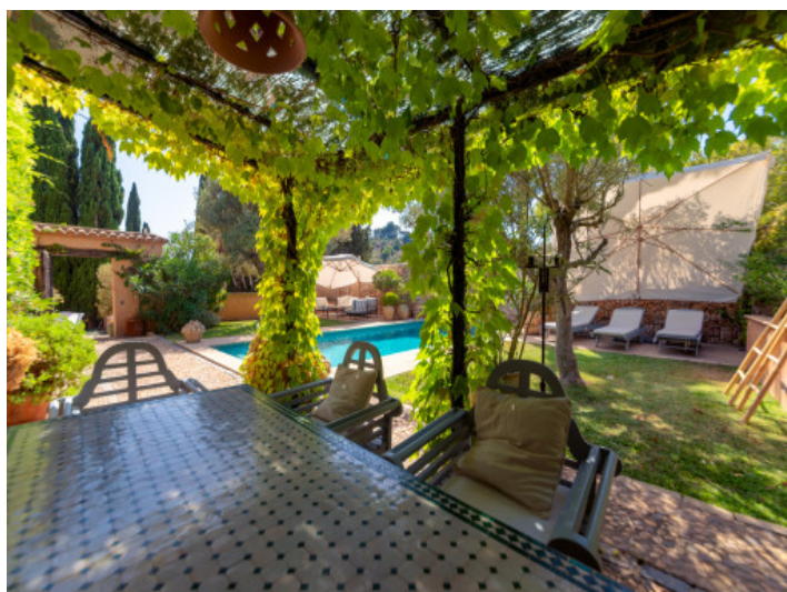
Covered garden terrace