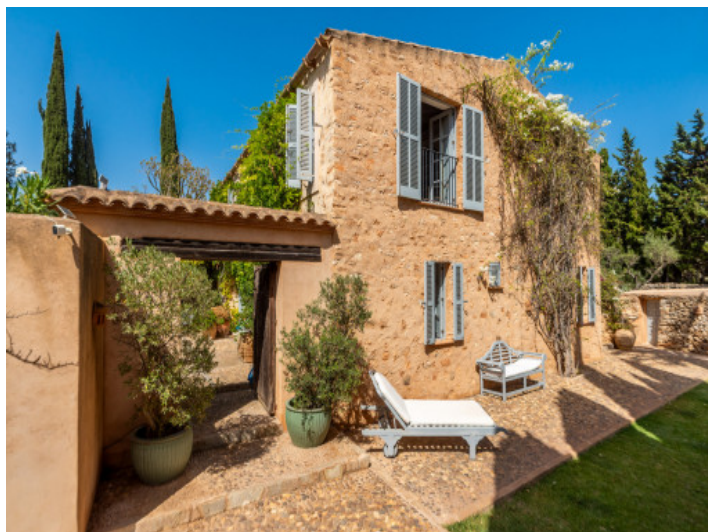
Facade of a typical mallorcan country home