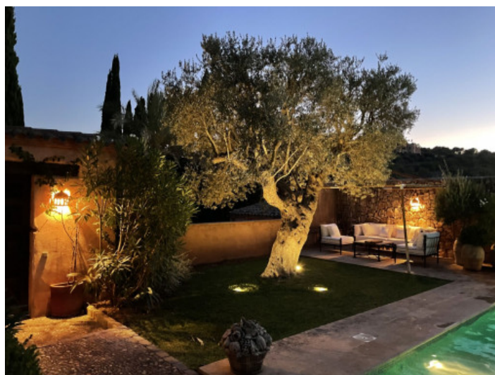
The finca by night