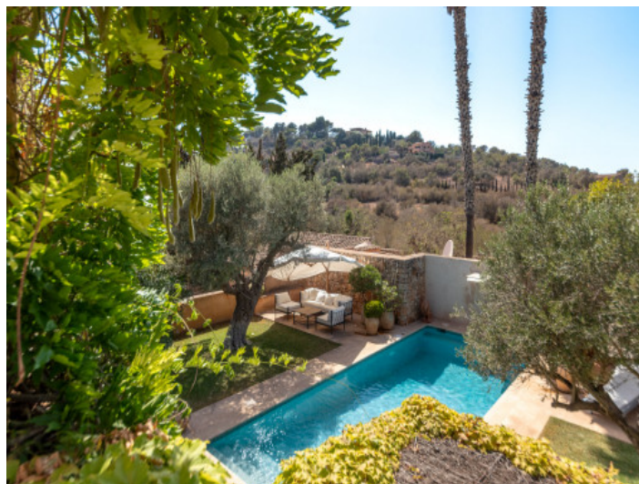
Romantic garden and pool