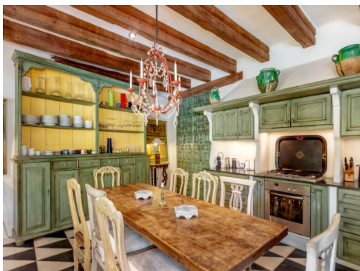
Country style kitchen