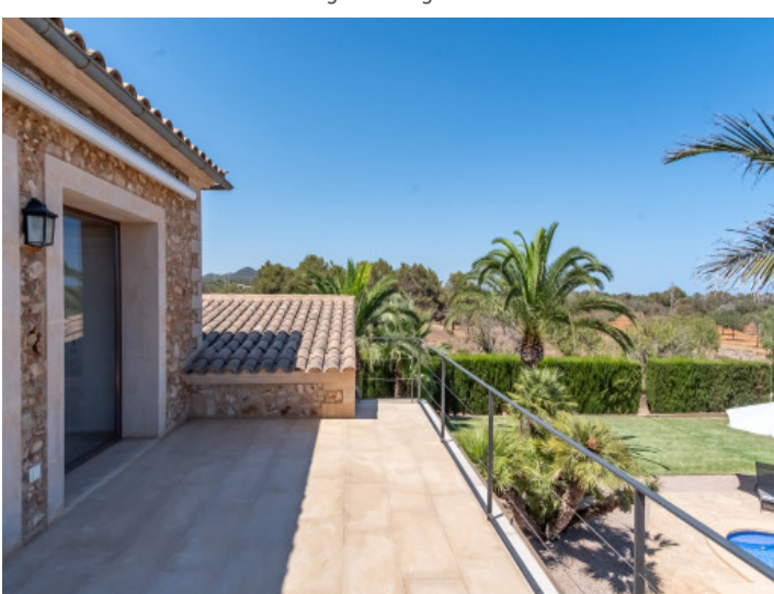
Terrace of the living area