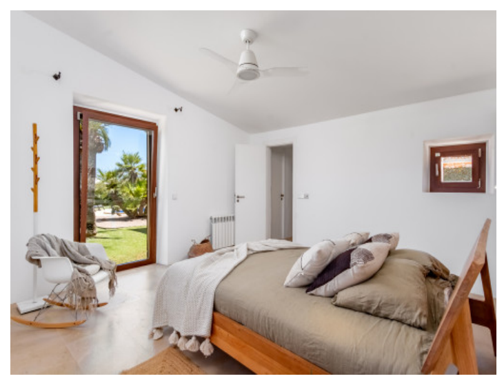
Bedroom with direct access to the garden