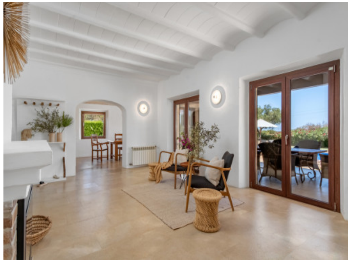
Bright entrance area