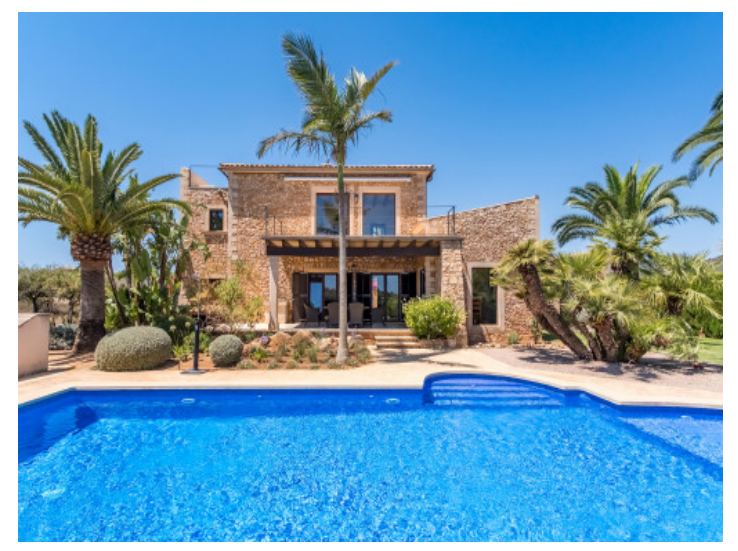
Stylish oasis of peace