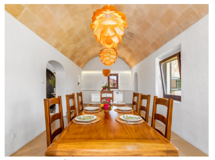
Dining area and sandstone vault