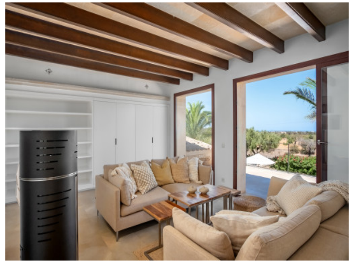
Living area with sea views