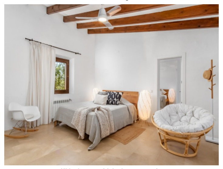
All bedrooms with bathroom en suite