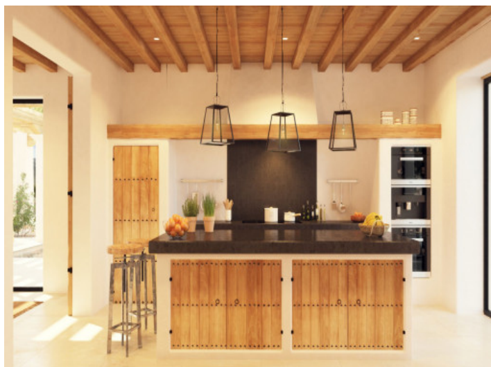
Country style kitchen