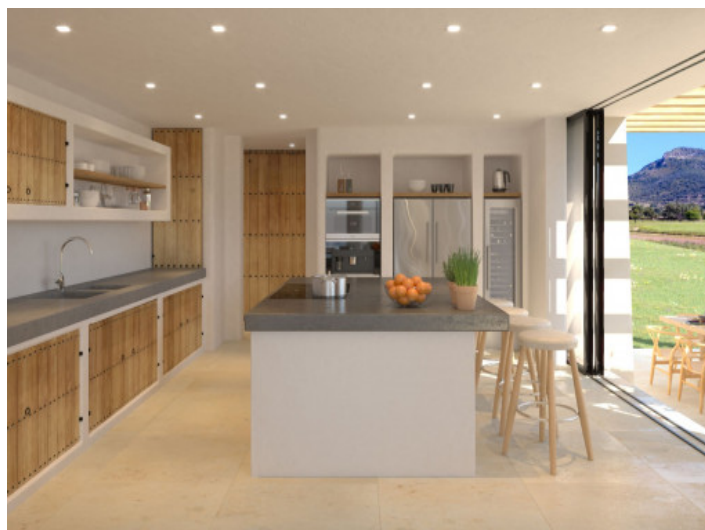
Kitchen with large kitchen island

All information is correct to the best of our knowledge. Errors and prior sale excepted. This prospectus is purely for information purposes. Only the notarized deed of sale is legally binding.