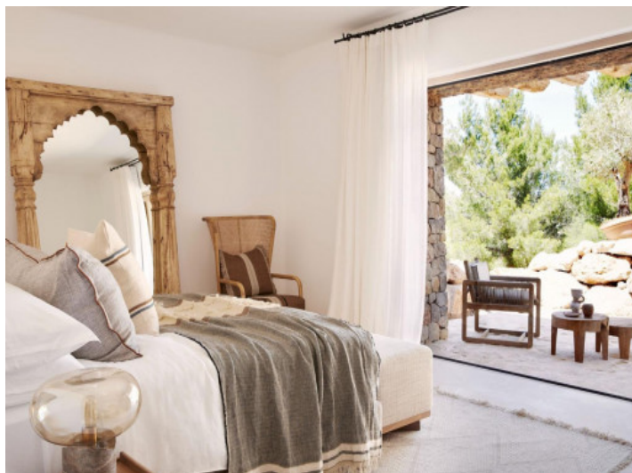
One of 6 bedrooms