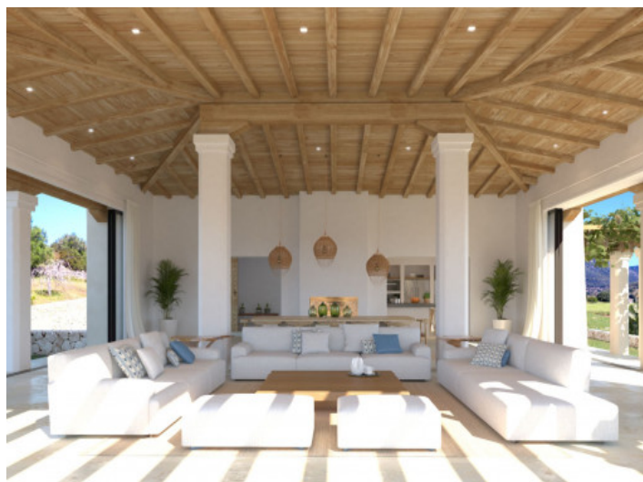
Prestigious new-build project in the middle of Mallorca's unique nature, Mangor San Lorenzo

All information is correct to the best of our knowledge. Errors and prior sale excepted. This prospectus is purely for information purposes only and is not a contract. Sale is legally binding.