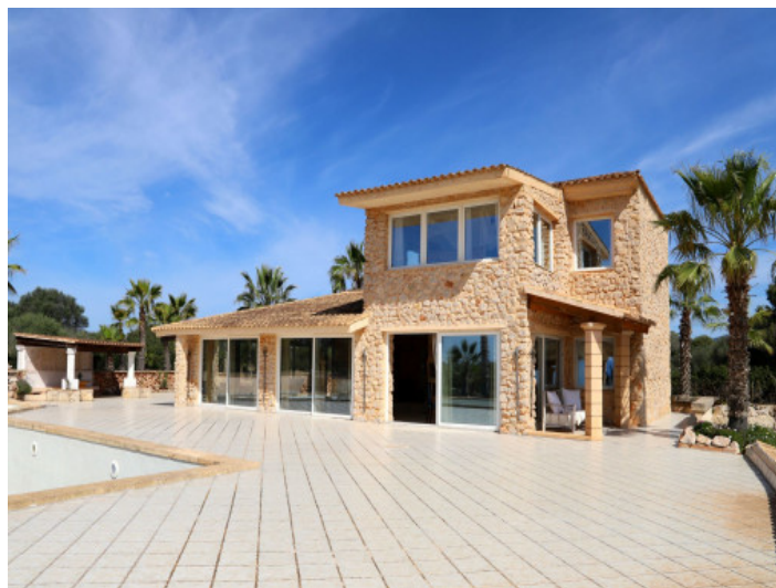
View to the house