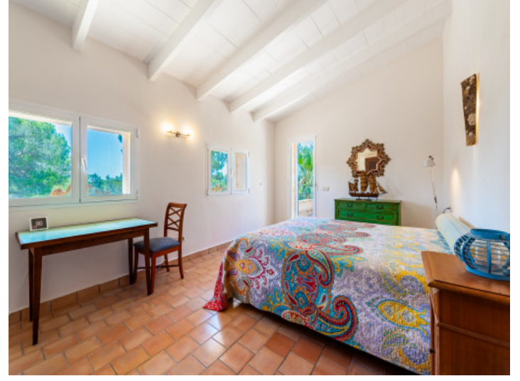
Bedroom with private terrace