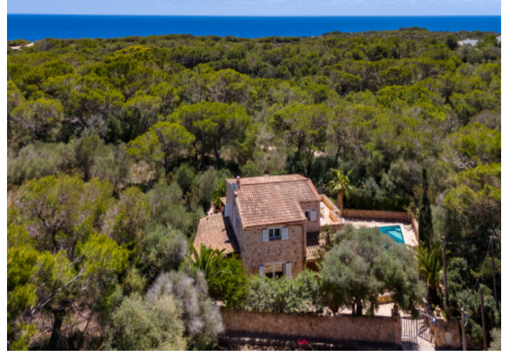
Close to the beach