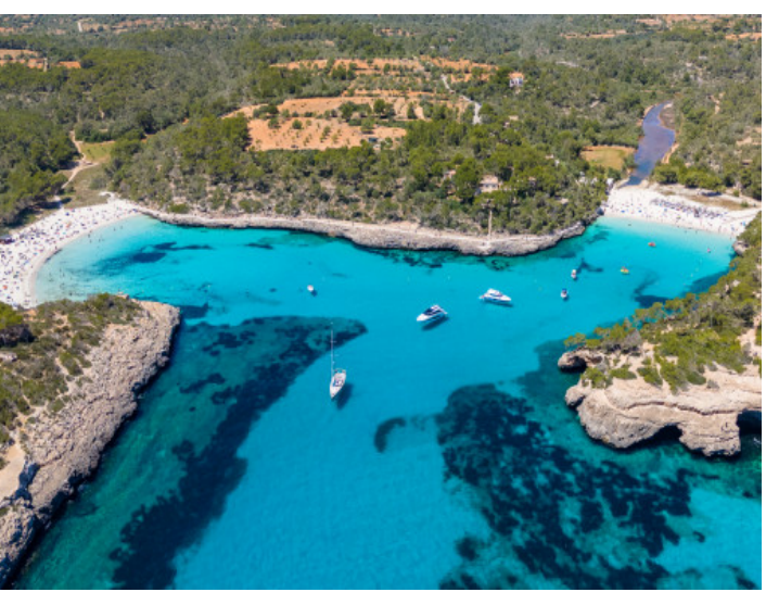
Cala Mondrago and Cala S'Almunia