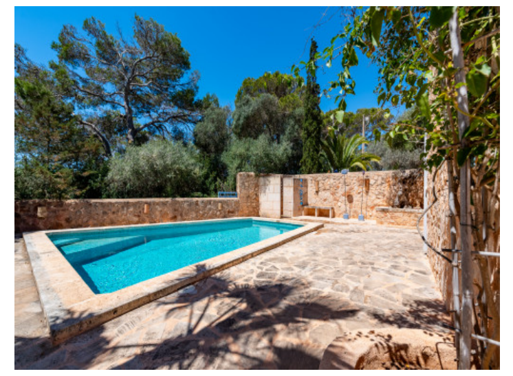
Pool with privacy

PORTA MALLORQUINA® Your home. Our passion.