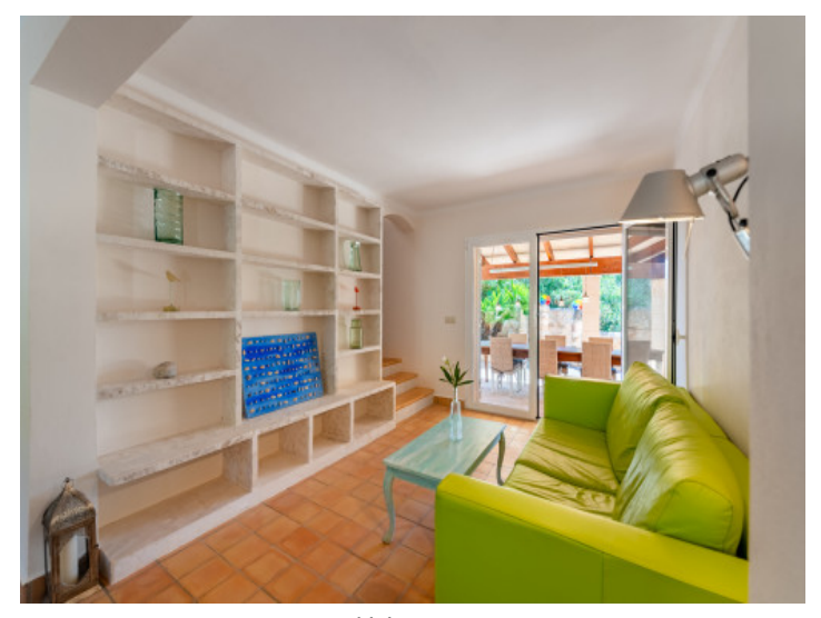
Living area Dining area All information is correct to the best of our knowledge. Errors and prior sale excepted. This prospectus is purely for information purposes. Only the notarized deed of sale is legally binding.

PORTA MALLORQUINA • THERESIENSTR.: 81, 80333 MUNICH TEL. +34 971 698 242 • INFO@PORTAMALLORQUINA.COM