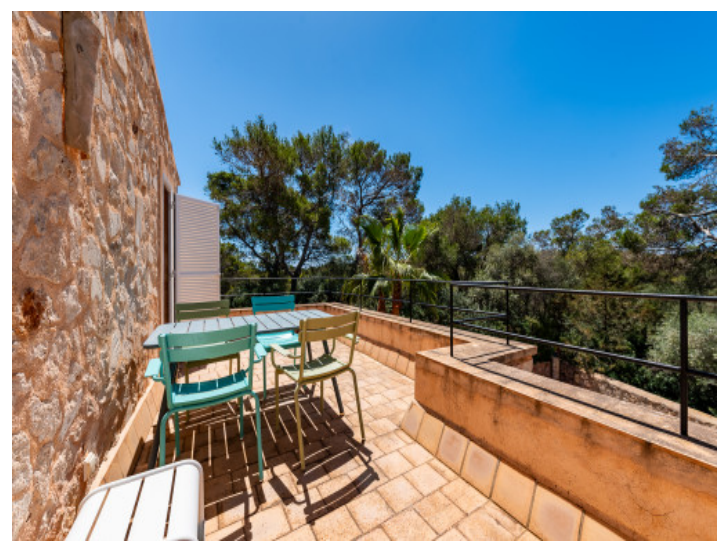
Terrace from the bedroom