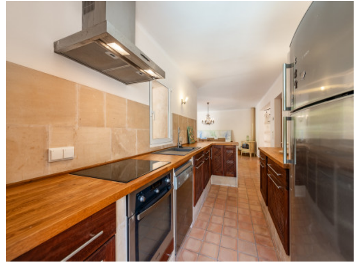
Very nice kitchen

PORTA MALLORQUINA® Your home. Our passion.