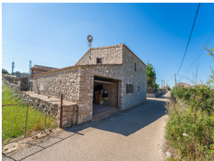
Garage and facade