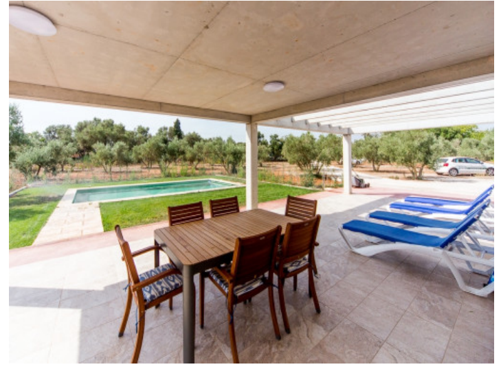
Covered terrace with dining area and views of the garden

PORTA MALLORQUINA® Your home. Our passion.