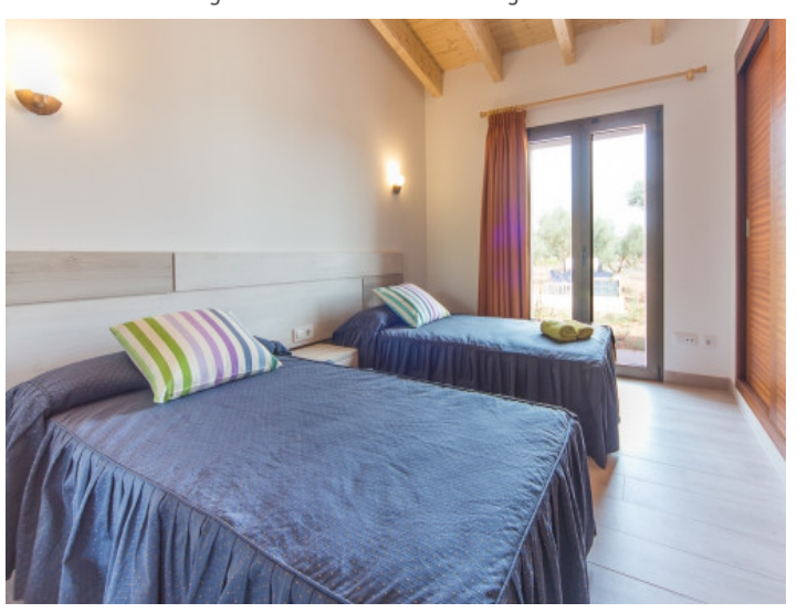
Double bedroom with panoramic windows