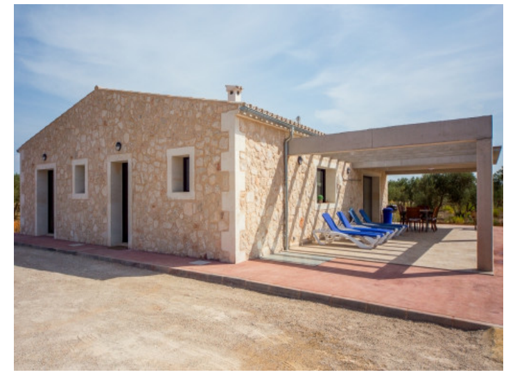
Mediterranean elements and modern equipment

PORTA MALLORQUINA® Your home. Our passion.