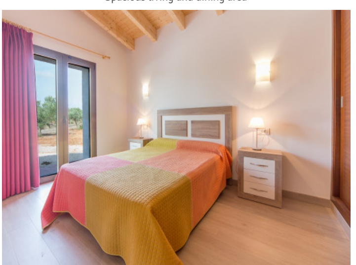
Friendly master bedroom Master bedroom with bathroom en suite All information is correct to the best of our knowledge. Errors and prior sale excepted. This prospectus is purely for information purposes. Only the notarized deed of sale is legally binding.

PORTA MALLORQUINA • C./ CONQUISTADOR 8, 07001 PALMA TEL. +34 971 698 242 • INFO@PORTAMALLORQUINA.COM