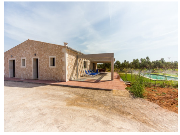
Access to the property