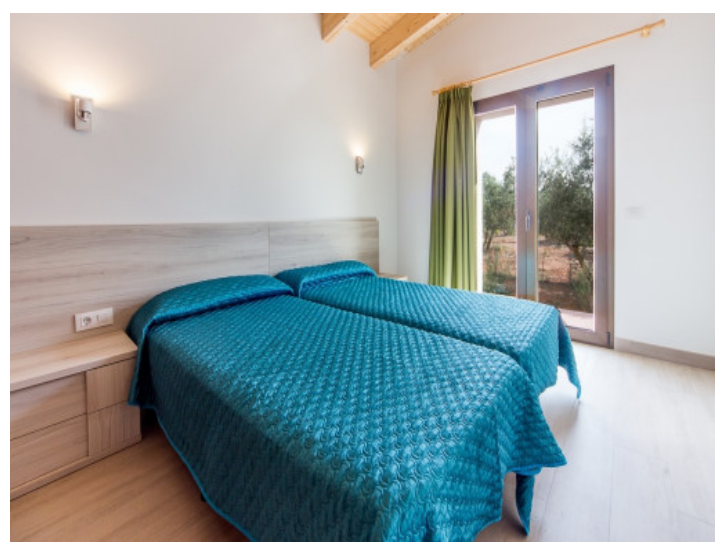
One of three double bedrooms