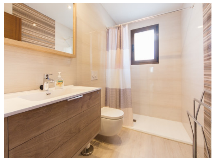
Bright master bathroom with large shower