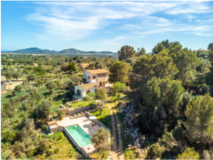
View from above