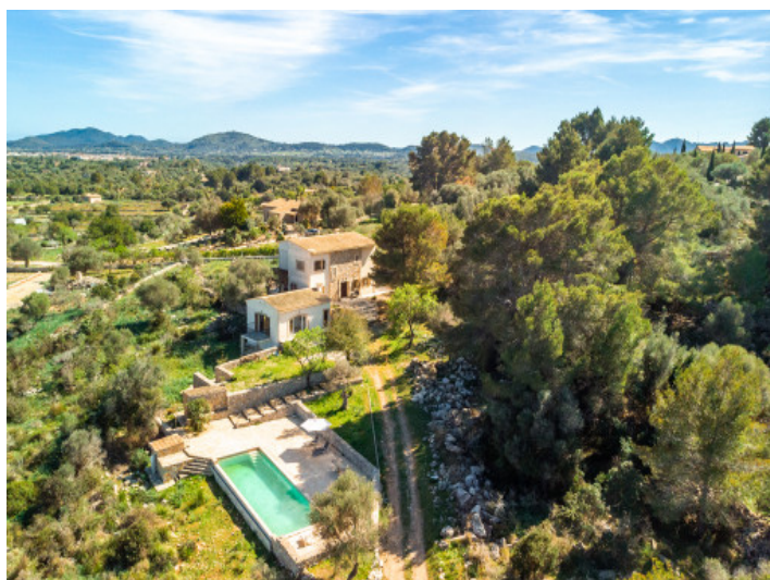
Bird's eye view