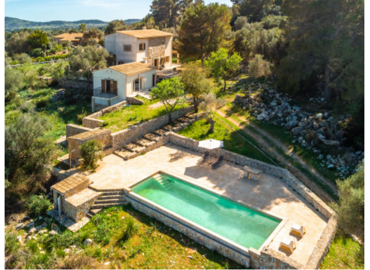
Finca and pool