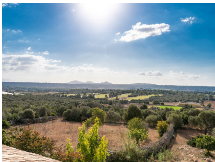
Stunning panoramic views