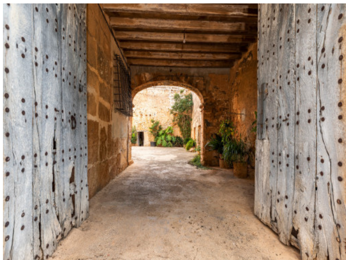
Entrance to the patio