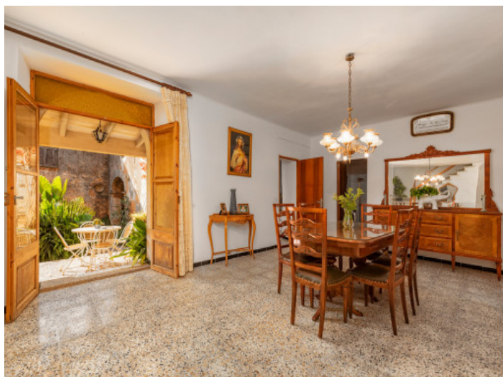
Traditional dining area