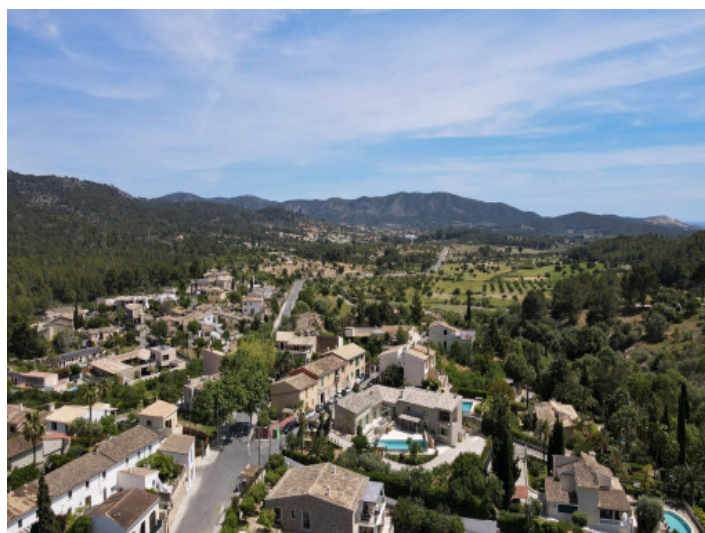
View to the property