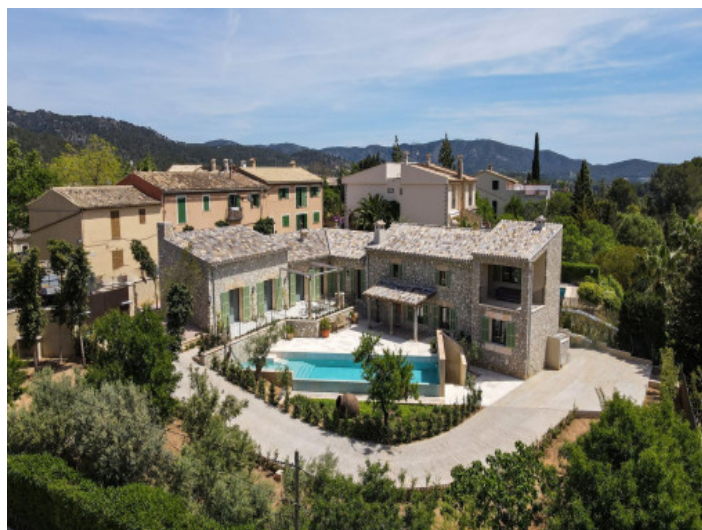
View to the property

All information is correct to the best of our knowledge. Errors and prior sale excepted. This prospectus is purely for information purposes. Only the notarized deed of sale is legally binding.