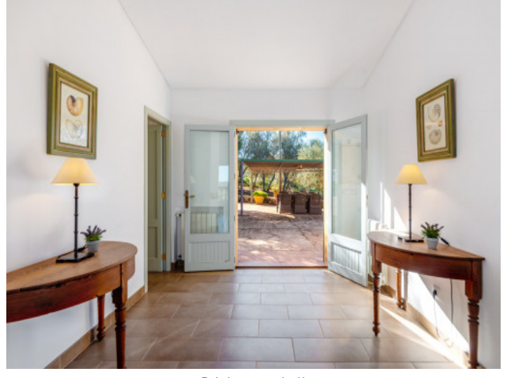
Bright entry hall

All information is correct to the best of our knowledge. Errors and prior sale excepted. This prospectus is purely for information purposes. Only the notarized deed of sale is legally binding.