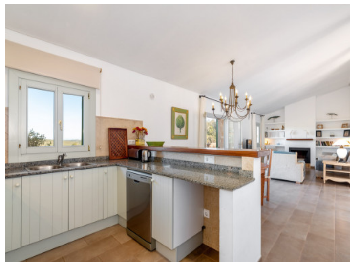
Semi open kitchen