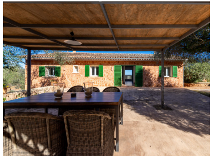
Nice covered terrace