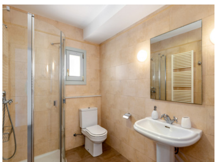
Two bedrooms share this bathroom