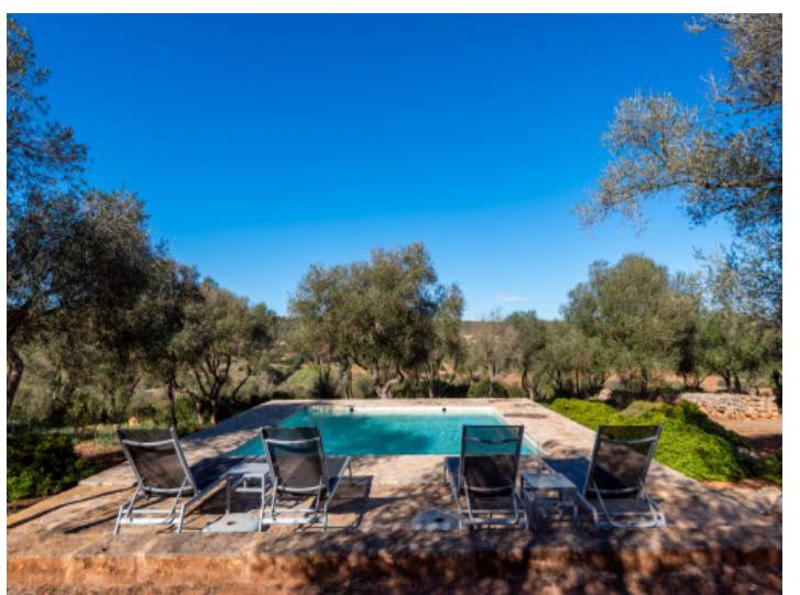
Beautiful mallorcan pool area