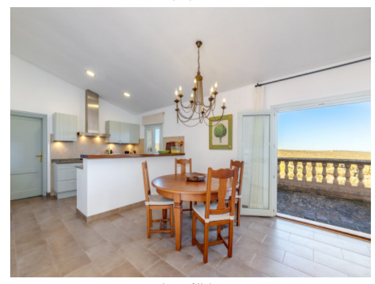
Lots of light