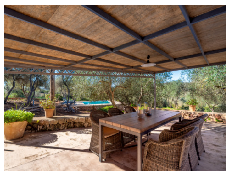
Enchanting outdoor terrace