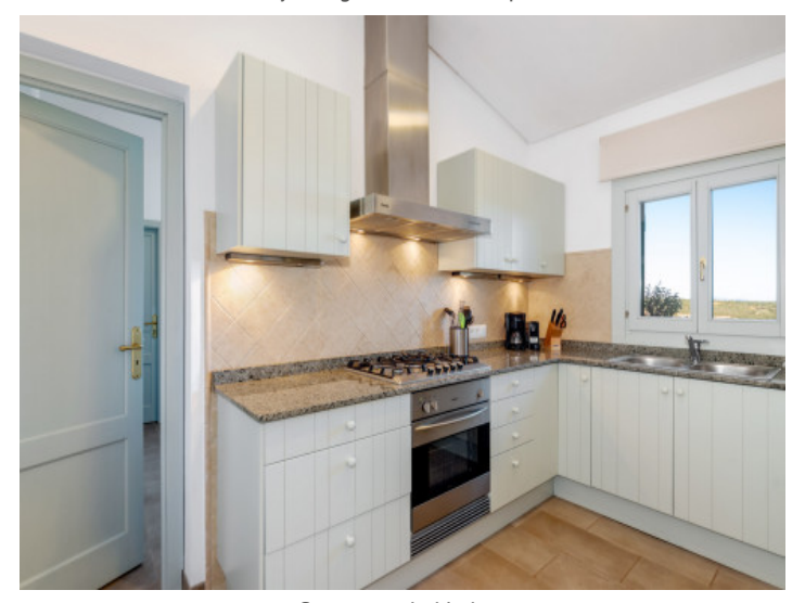
Country style kitchen