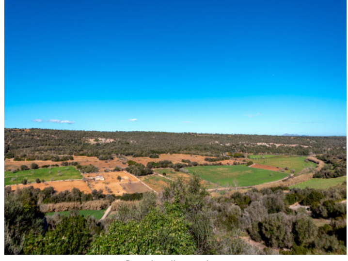
Stunning distant views