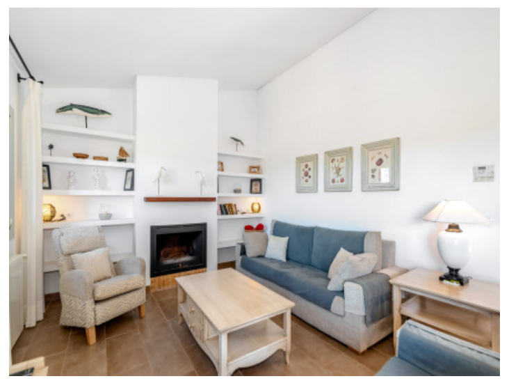
Cozy living area with a fireplace