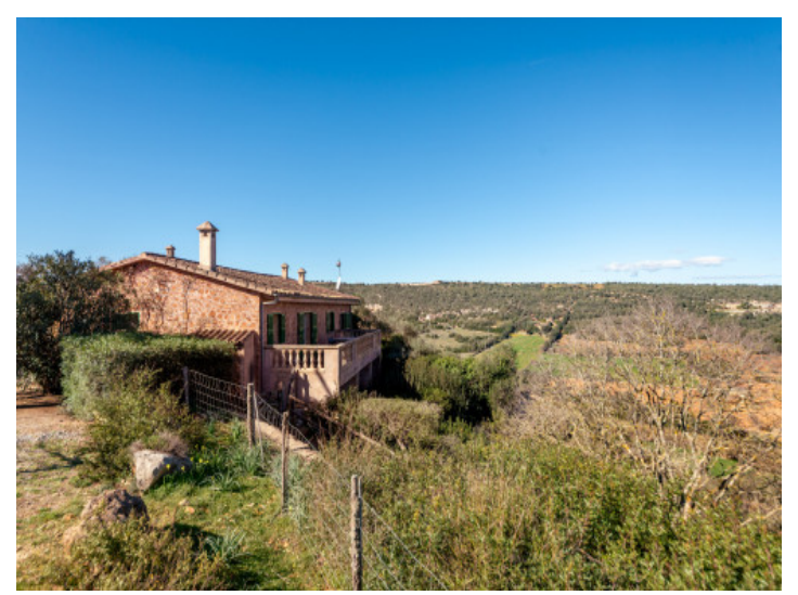
Finca in the middle of nature