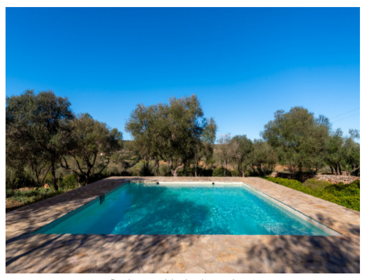
Pool area with absolute privacy

All information is correct to the best of our knowledge. Errors and prior sale excepted. This prospectus is purely for information purposes. Only the notarized deed of sale is legally binding.